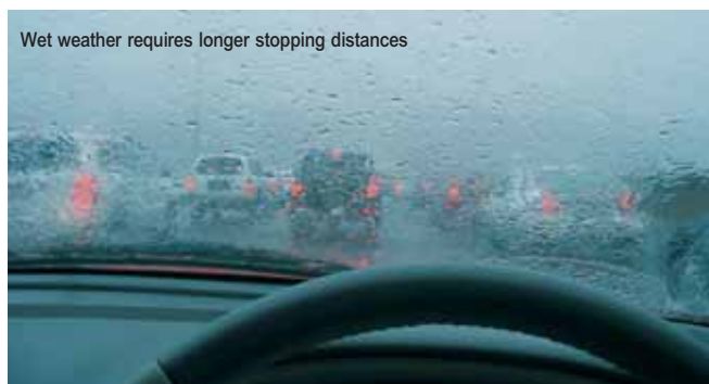
Wet weather requires longer stopping distances

For information on the roads winter maintenance programme, or to request that a grit bin be filled, contact ACCESSLine on 08452 777 778. information is also available at www.angus.gov.uk/wintermaintenance