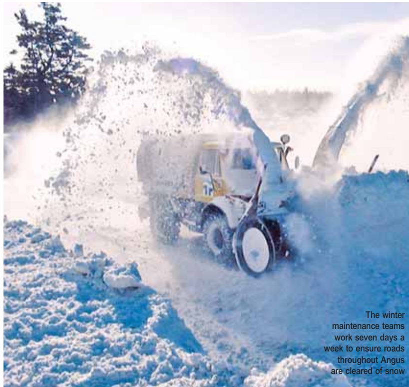
The winter maintenance teams work seven days a week to ensure roads throughout Angus are cleared of snow