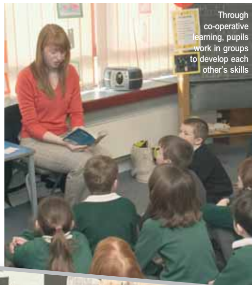
Through co-operative learning, pupils work in groups to develop each other's skills

"Angus teachers who have been trained in it have been very enthusiastic and we will be training all of our teachers, including those in adult education, in this way of working over the next few years." ■