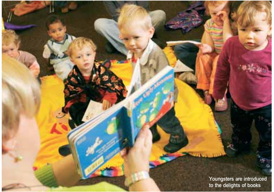
Youngsters are introduced to the delights of books

Local firm Blackadders Solicitors and Micro Librarian Systems, producers of the Eclipse library management software used in Angus secondary schools, partly sponsor the Angus Book Award.