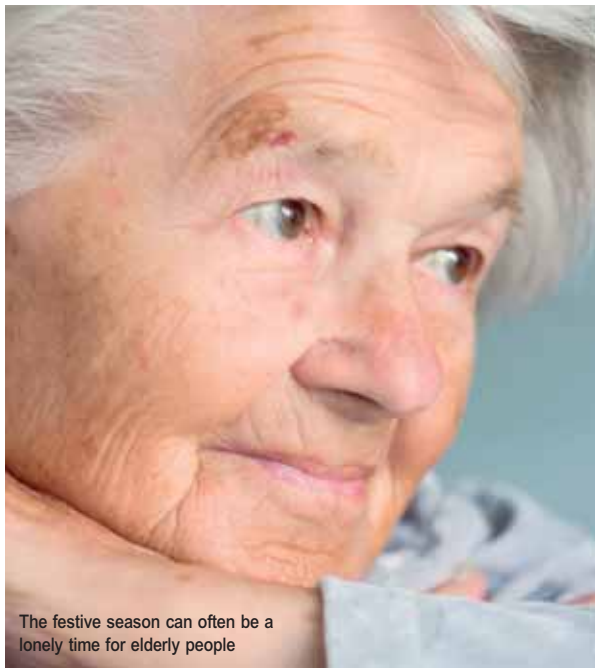
The festive season can often be a lonely time for elderly people

Project offers vital support for elderly residents