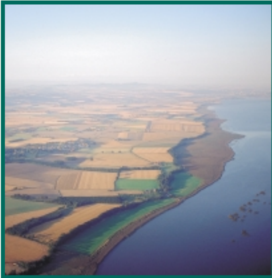
P. & A. MACDONALD

For the purposes of this Habitat Action Plan the upper limit of the estuary is defined by the confluence of the Earn with the Tay – about 8 km downstream of Perth. The lower limit is less easy to define but because estuarine conditions are vital to otherwise coastal species such as Common seal Phoca vitulina , Sparling Osmerus eperlanus , and Eider Somateria mollissima , their ranges within the estuary have been taken into consideration. Consequently, the area between Buddon Ness and Tentsmuir Point Nature Reserve (Fife) is covered by this Action Plan.