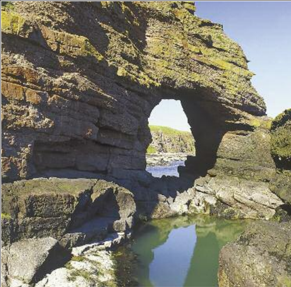
Rock Arch, Auchmithie