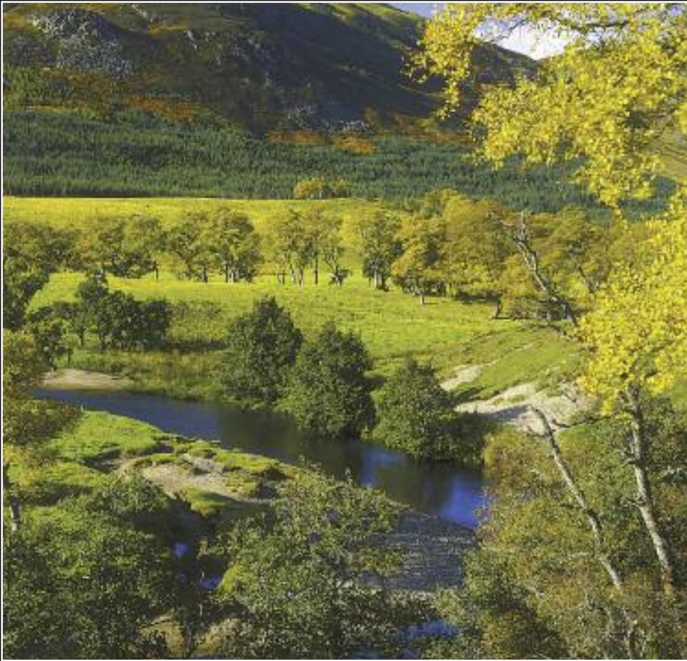
River South Esk, Glen Clova