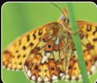
Pearl bordered fritillary

This is the best time of year to see pipistrelles and daubenton's bats at dusk in a whole range of habitats as evening scented plants and moths are abundant.