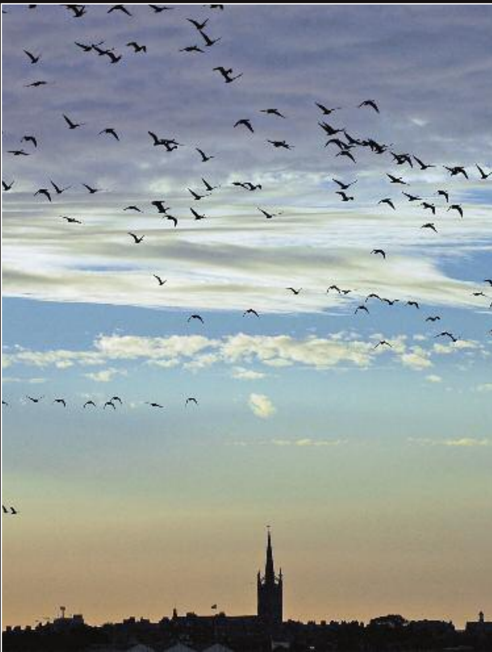
Pink footed geese over Montrose Basin