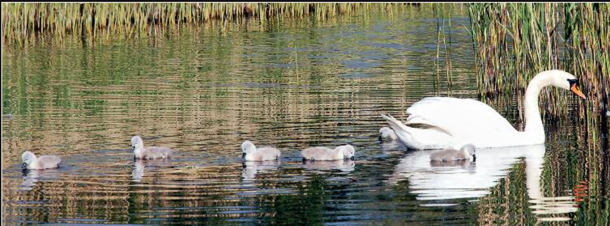
Mute swan and cygnets