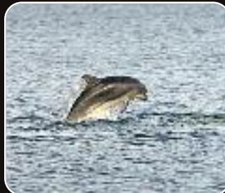
Bottlenose dolphin