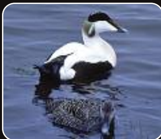
Eider duck