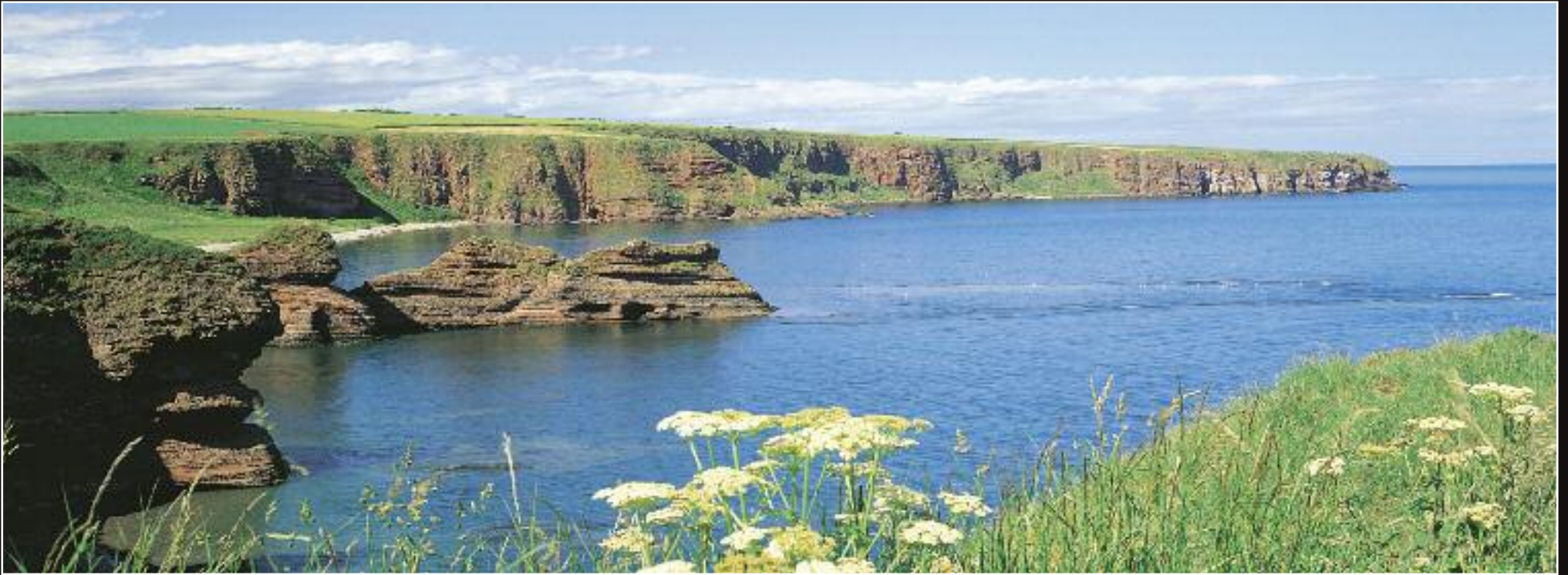
Carlingheugh Bay, Auchmithie