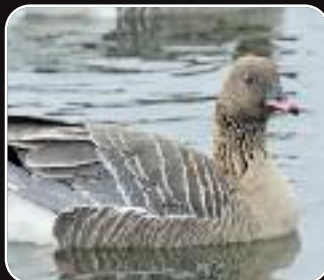
Pink footed goose