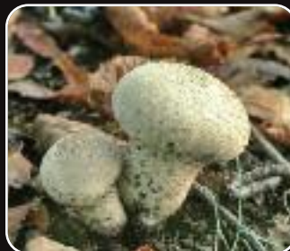
Puffball © T Norman Tait