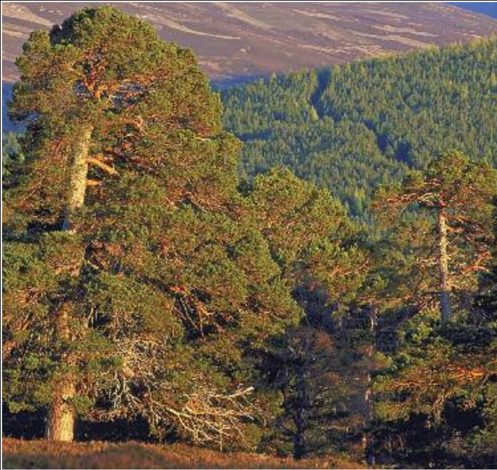
Native scots pine