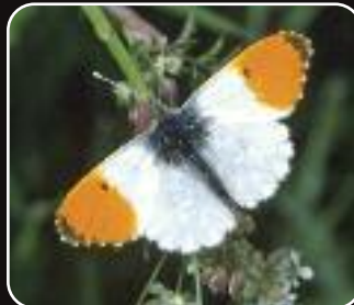
Orange tip