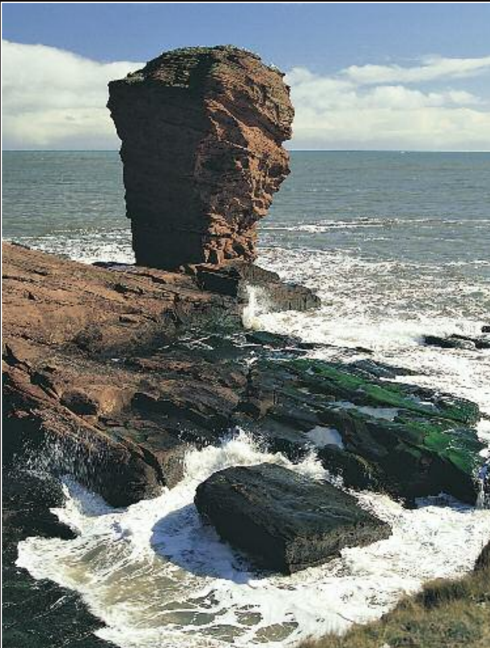
Deil's Heid, Seaton Cliffs, Arbroath