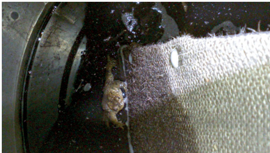
Frog using ladder