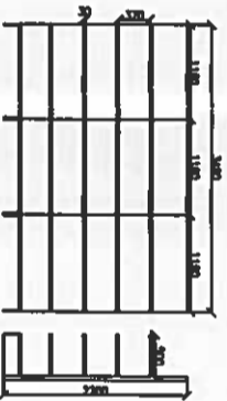
Alcohol Shelves @ 1:100