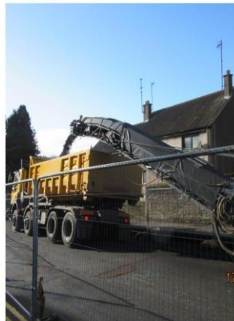
Planing out of Witchden Road, in preparation for the drainage work. Road Planes were re-used in Zones 3 & 4