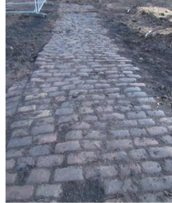
Old road exposed in Zone 1 from the Bleaching Greens / Paperies

As part of the Scheme design, a new play park at the Inch will be installed, which will represent a substantial enhancement to the old park play.