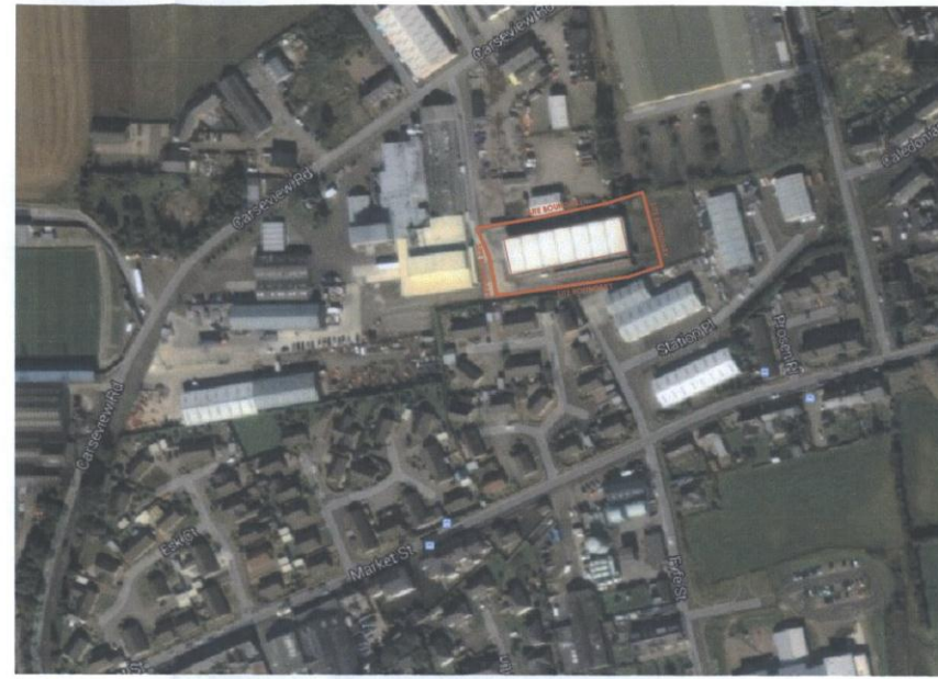
AERIAL PHOTOGRAPH SHOWING SITE LOCATION Not To Scale