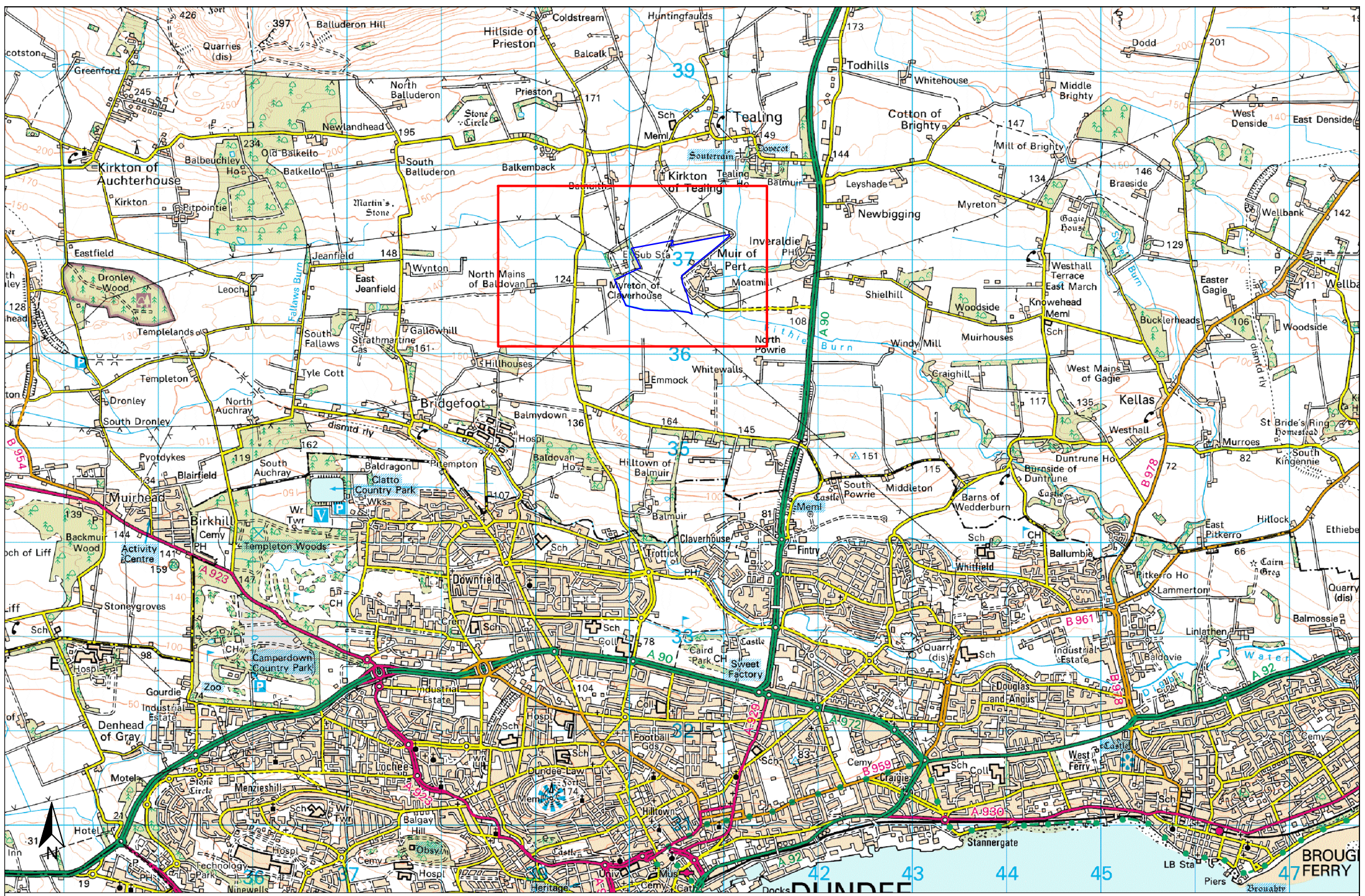
DEVELOPMENT SITE LOCATION - 1:50,000