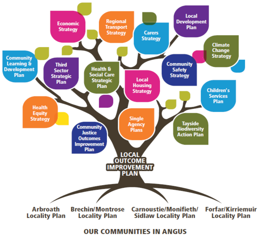
Diagram One – Shared Approach for Improving Local Outcomes in Angus