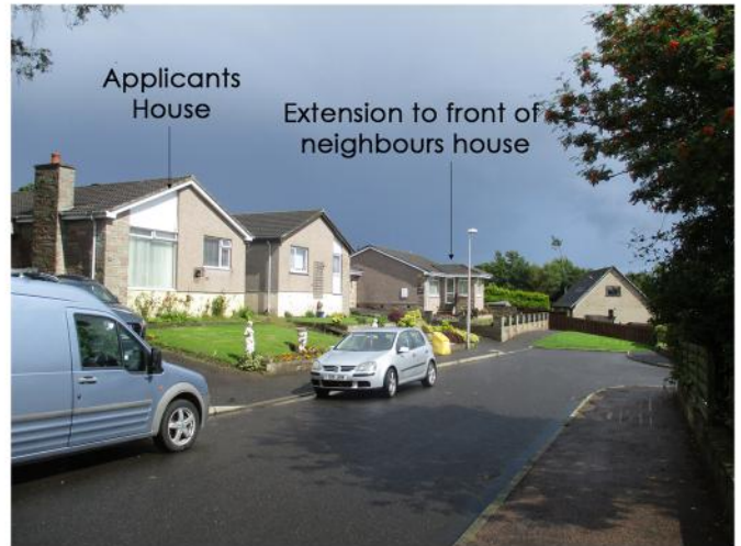
2) Photograph showing precedence set for front extension.