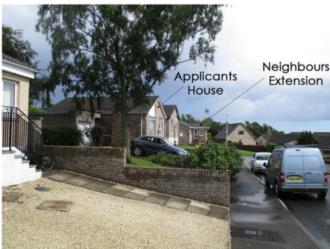
5) Photograph shows neighbours extension and lack of strict building line.