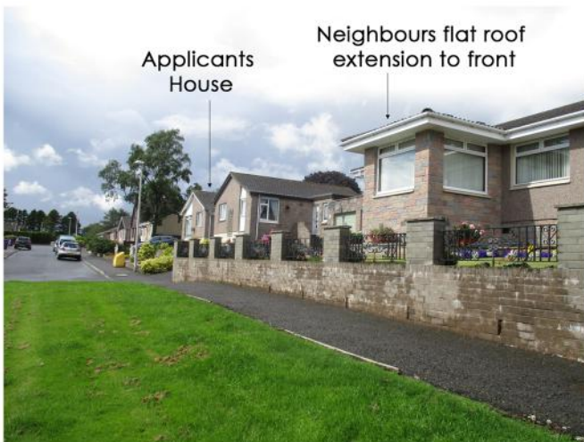
3) Photographs shows unfairness of the refusal when a precedence has been set, by allowing an inferior style of extension.