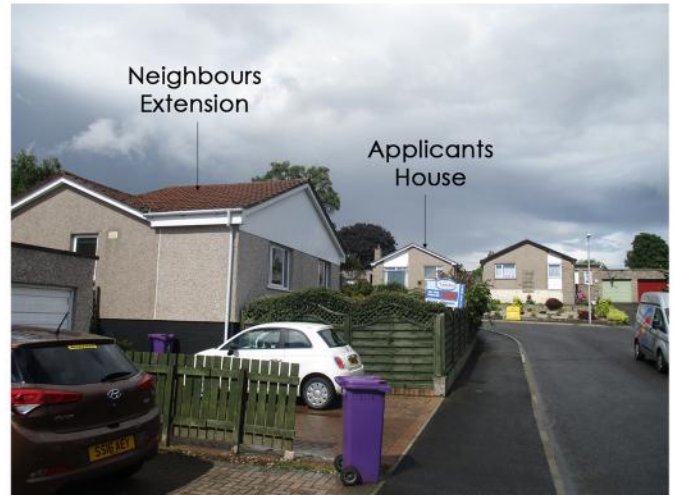
4) Photograph showing extension to front of immediately adjacent house, which breaks the ridge line and is twice the size of the applicants required extension.