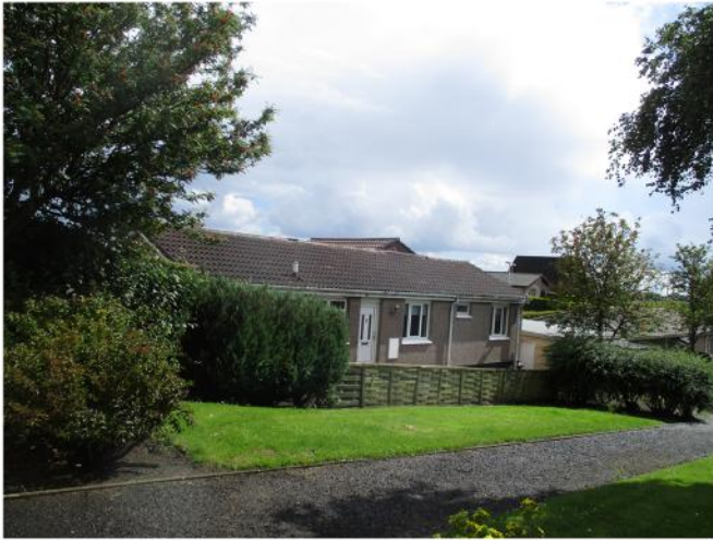
1) Photograph from applicants site showing neighbours extension breaking the ridge line to the front elevation.