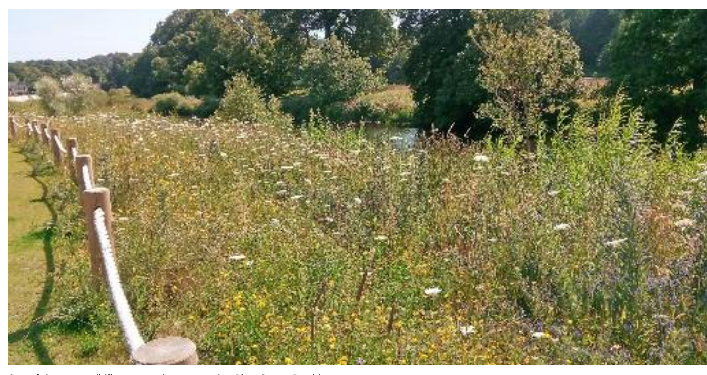
One of the many wildflower meadows created at River Street, Brechin.

A variety of shrubs and trees that are nectar and food sources for birds, vertebrates and insects have been planted around the park. Moisture loving perennials such as meadowsweet, marsh marigold, yellow flag and purple loosestrife accompanied by willow and alder trees have been planted in drifts along the river.