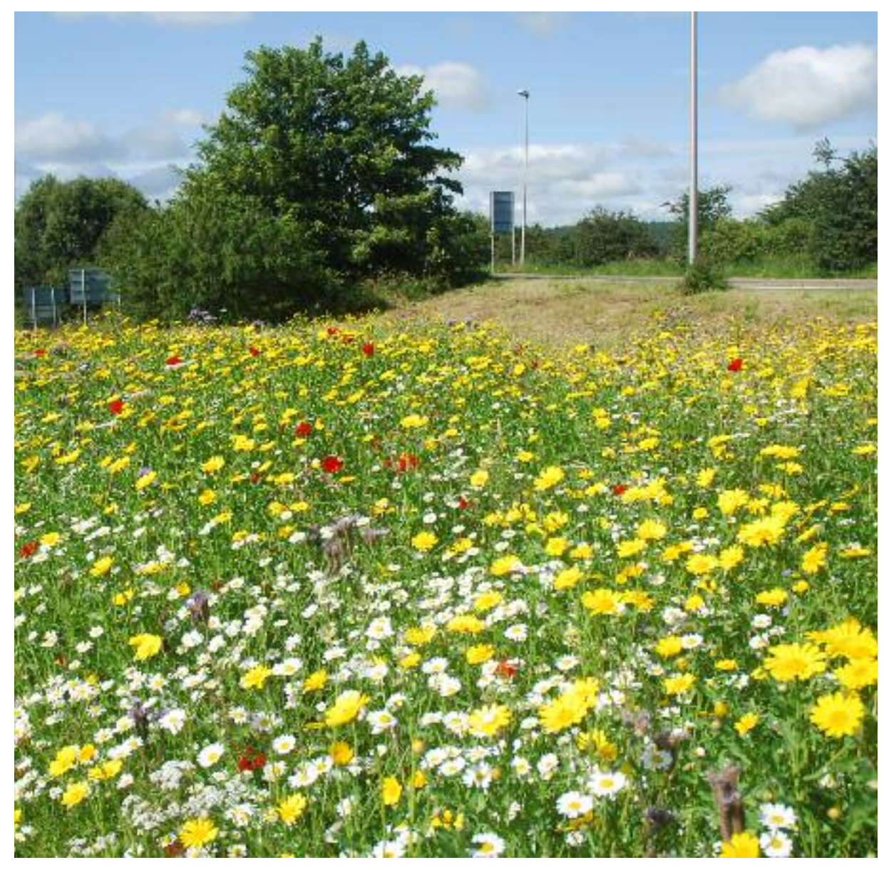
A community wildflower meadow brightening up the roadside in Forfar, Angus.

Parks Services have also designed a series of interpretation boards to inform on the history, culture and natural environment of the local area and Brechin as a whole. Two of the information signs inform on the wildlife in the park such as bats, birds and butterflies and also on life in the River South Esk with its internationally important populations of Atlantic salmon and Freshwater pearl mussels. The signs act to inform visitors what to look out for and to raise awareness of threats and dangers to the vulnerable species and their habitats.