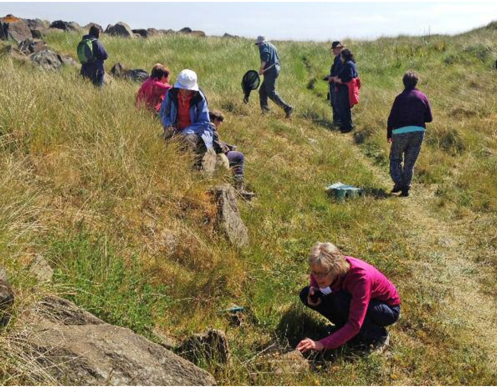
A well attended community survey at Barry Buddon, Angus.

In addition, Angus Council officially launched the new Scottish Coppice Festival Week in March 2017 and worked with the Partnership to make the inauguration of the first Scottish Small Blue Butterfly Week successful. The first such Week took place in May 2017 and there are now plans in place to continue the event into 2018.