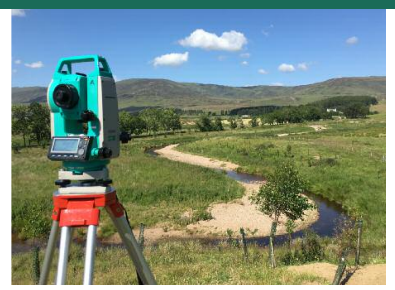
Monitoring change at the Rottal Burn, Glen Clova.

Although initially driven by a desire to improve habitat for fish, the project has delivered multiple benefits including: improved water quality, improved habitat for species, natural flood management, better access to enjoy the site and increased education opportunities. The project has captured the interest of a wide range of audiences and is used to show good practice in river restoration. The project, and wider land use projects in the catchment, have been valuable in meeting Angus Council s environmental statutory duties e.g. Climate Change and Biodiversity duties and Single Outcome Agreement. This example of good practice has been showcased by the Scottish Government on numerous occasions, as an example for other Local Authorities of how to achieve multiple benefits by working in partnership.