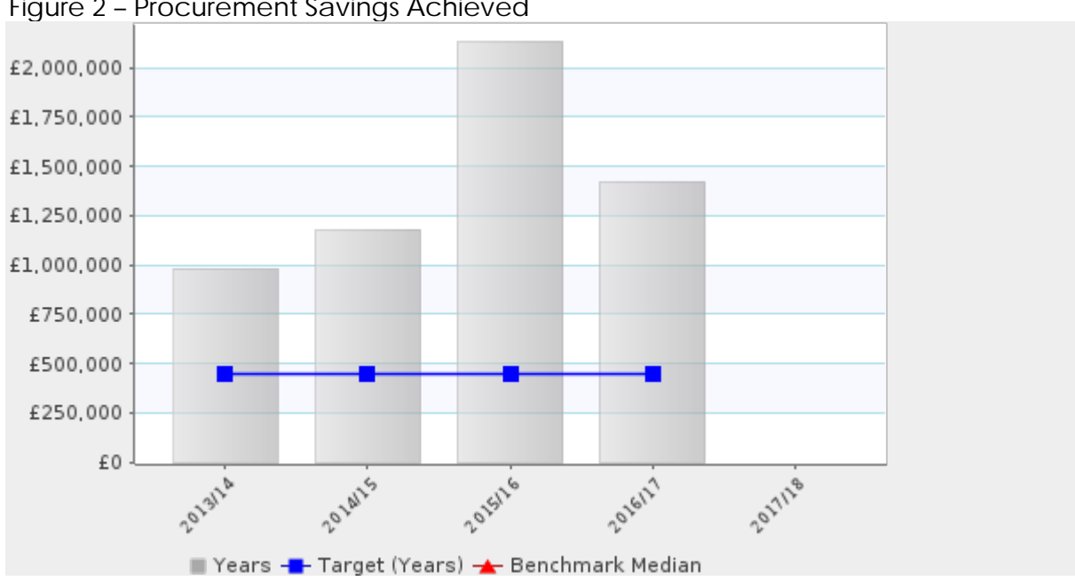
Figure 2 - Procurement Savings Achieved

This chart indicates ongoing procurement savings opportunities being achieved annually of between £1M and £2M, well above target (£450K).