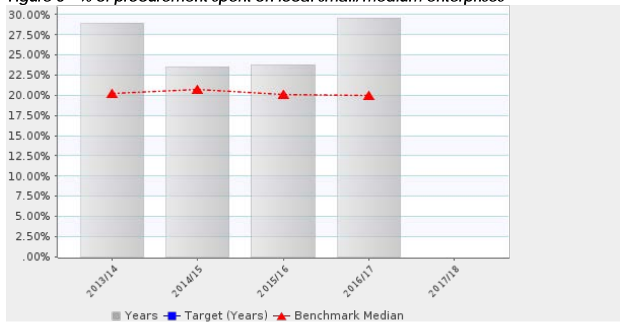
Figure 3 - % of procurement spent on local small/medium enterprises

For ease of reference the performance chart for this metric is reproduced at Figure 3 below.