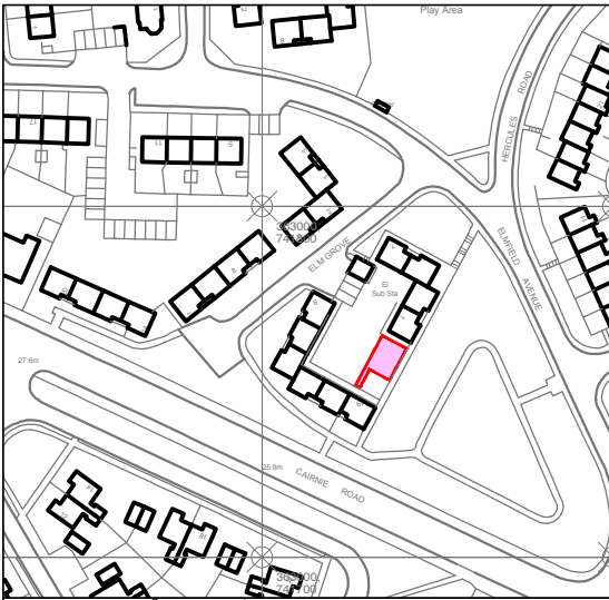
Location Plan Scale 1:2500