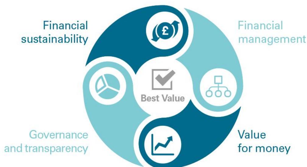
Exhibit 1 Audit dimensions