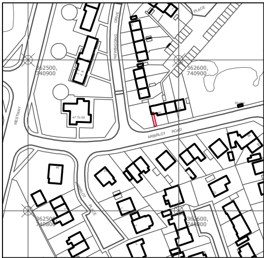
Location Plan Scale 1:2500