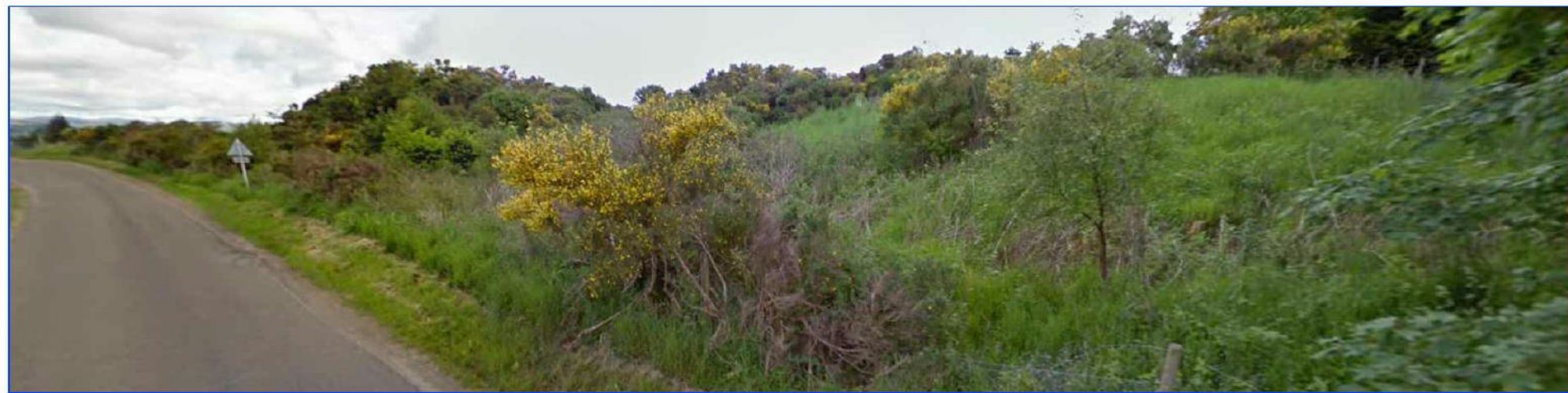
ROADSIDE LOOKING ONTO FIELD