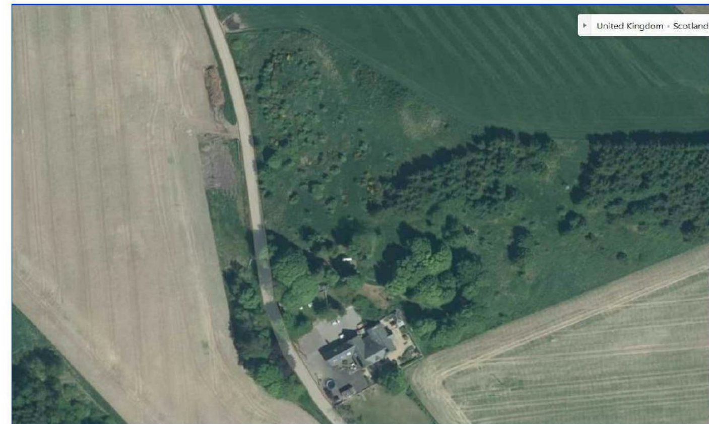
AERIAL VIEW OF FIELD