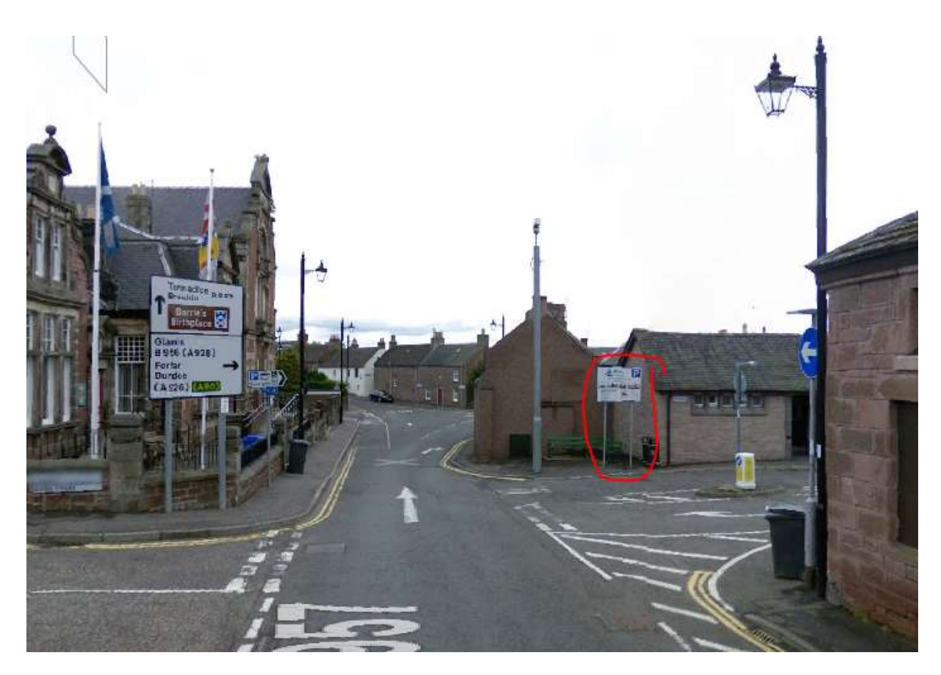
Image 10: Can this sign be moved? One way signage on right hand side to be placed on the lighting column?