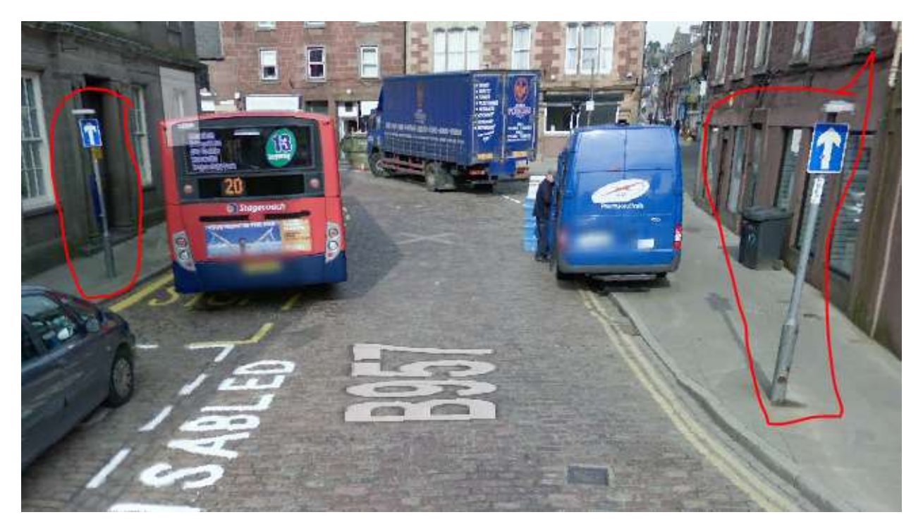
Image 3: One way signage to be replaced/painted as per image 2 to provide cohesion.