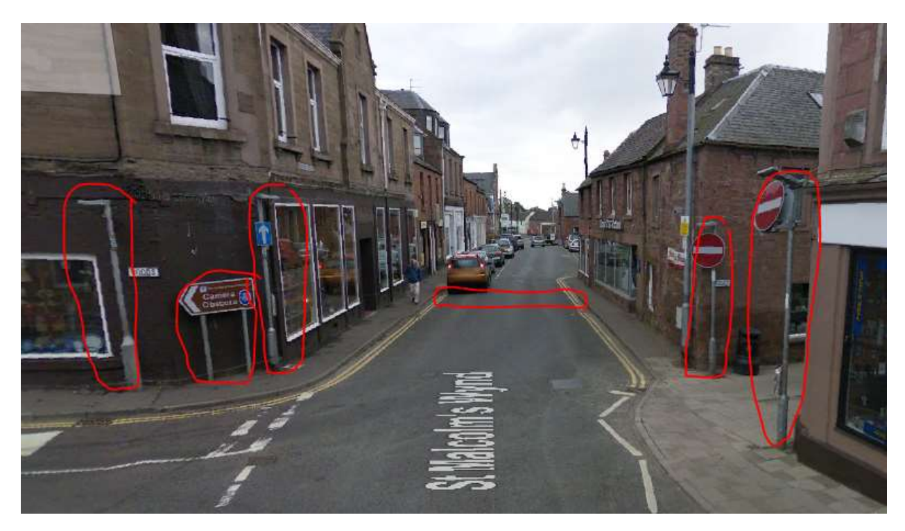
Image 9: replacement signage for no entry/directional signage either galvanised or painted black to match. Can Camera obscura sign go on building? Crossing point on right hand side to be installed to match crossing on the left side.

Image 8: Remove 3<sup>rd</sup> signal box and consider where this crossing is on replacement/upgrade plan, bring forward if possible.