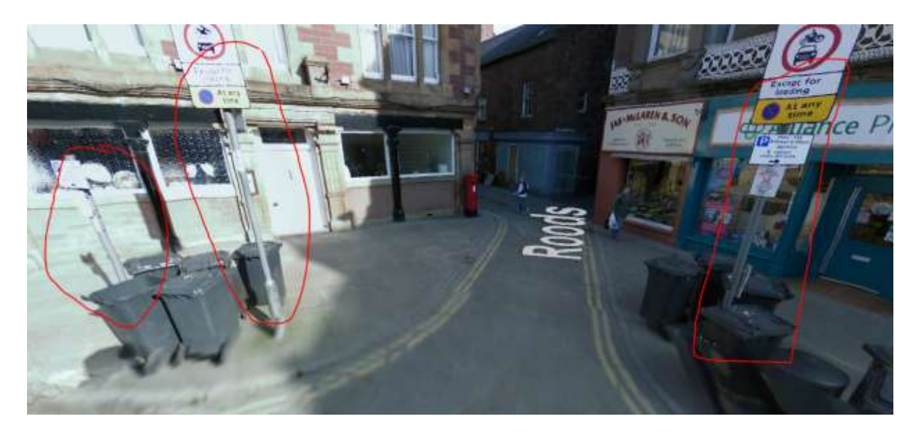
Image 4: Remove small signage pole to left, and if possible have only one signage pole (again to met as per image 2/3 regarding pole type).

Image 3: One way signage to be replaced/painted as per image 2 to provide cohesion.