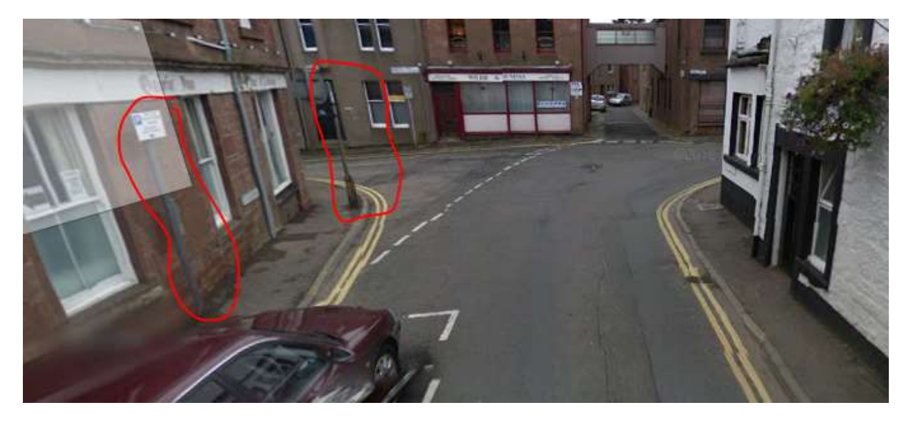
Image 11: Remove poles and place signage on building. If appropriate to replace then consider either galvanised or black.