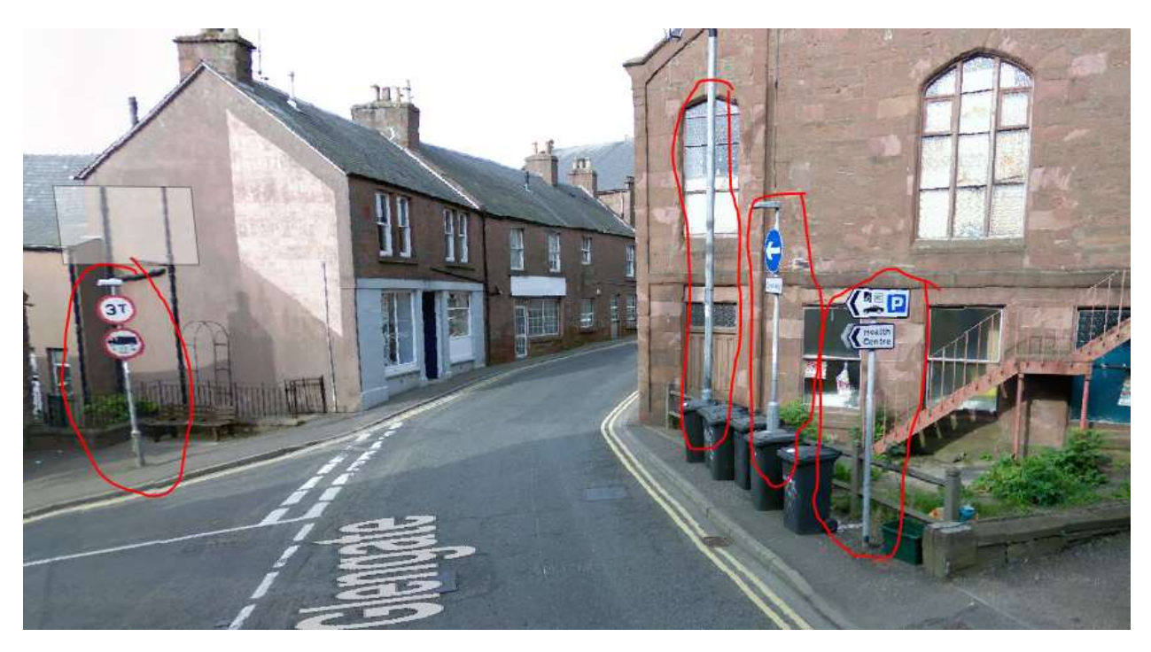
Image 5: Remove pole and signage to left. Rationalise signage on the right to be included on the one lamp standard. Lamp standard to be moved to where existing directional signage exists.