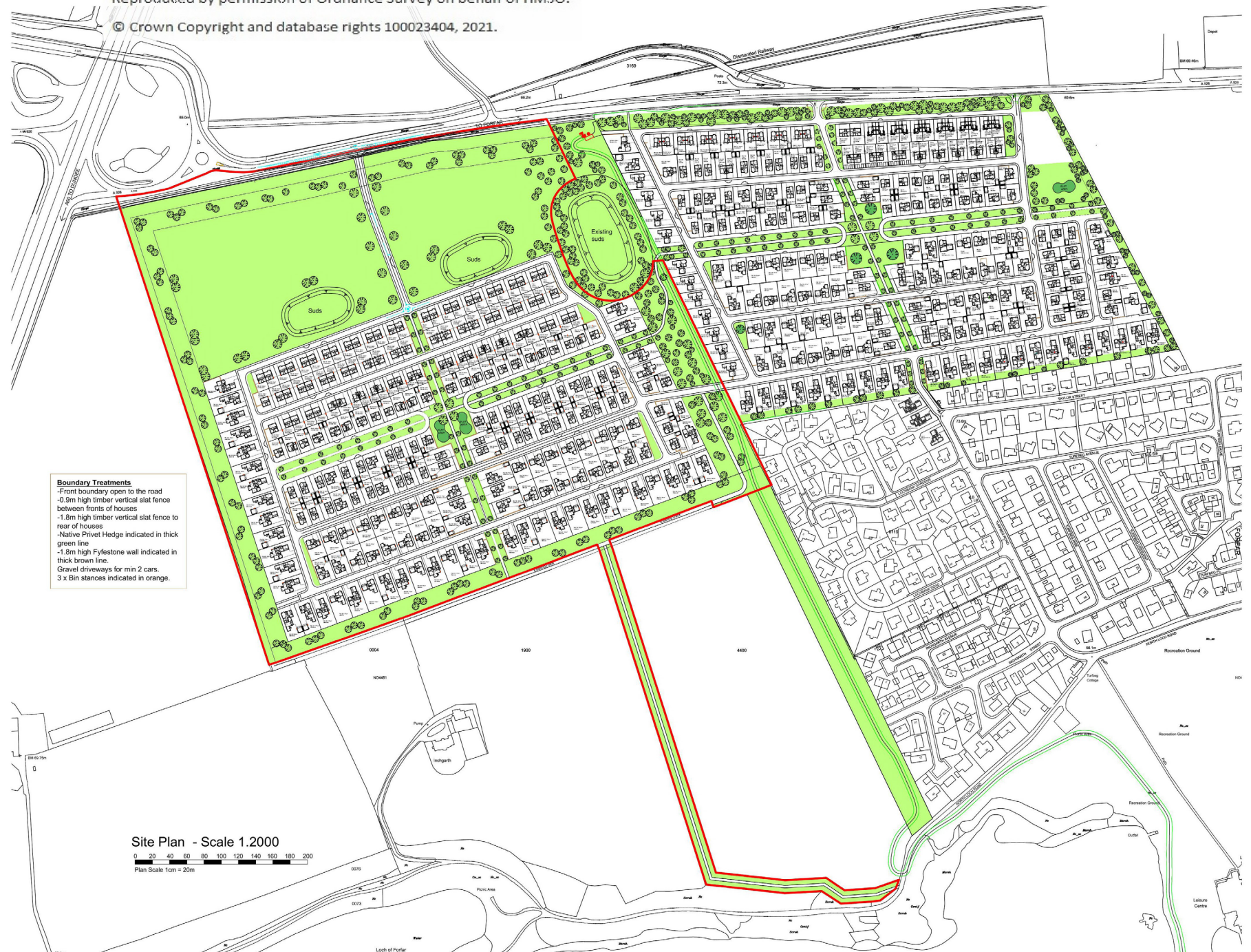
Site Plan - Scale 1:2000 0 20 40 60 80 100 120 140 160 180 200 Plan Scale 1cm = 20m