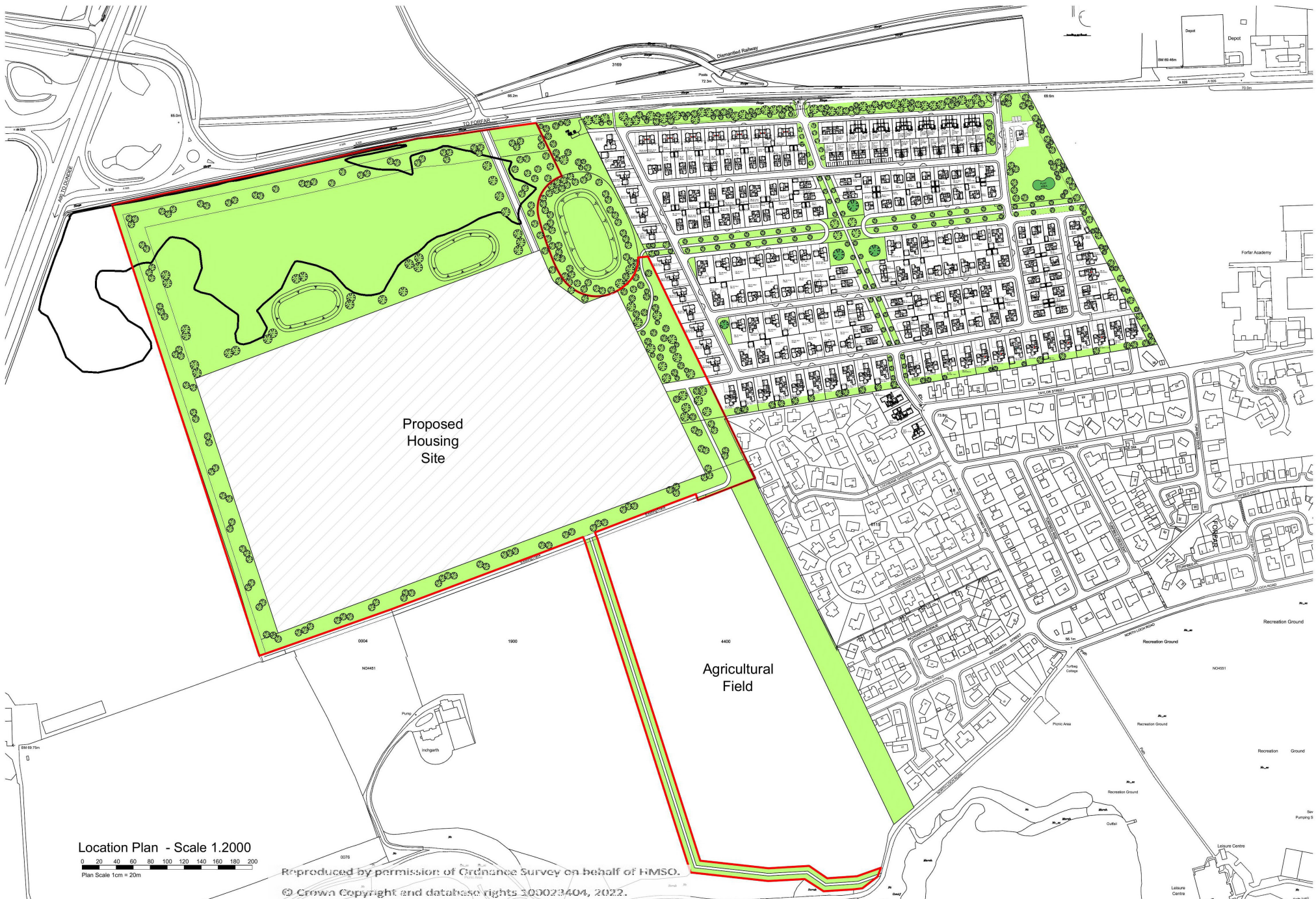
Location Plan - Scale 1:2000