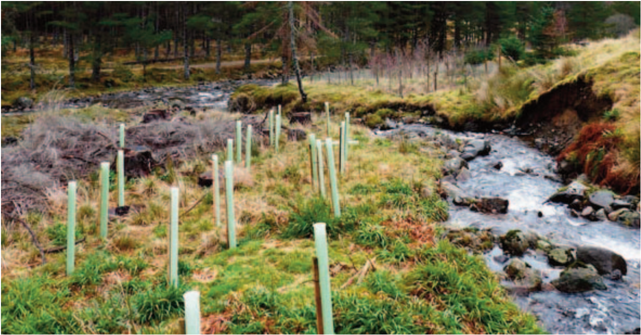
Image showing site monitoring at the Rottal Burn in Glen Clova.

not ratified by SEPA until September 2021 thus we can only report on 2020 data to date.