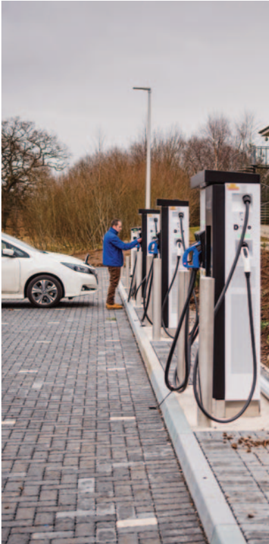
Image showing electric vehicle charging points at Orchardbank in Forfar.