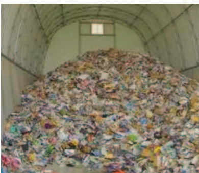
Image showing recycling collection containers.