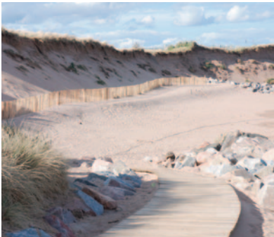
Image showing Montrose Bay, a 'Dynamic Coast' coastal erosion study site.