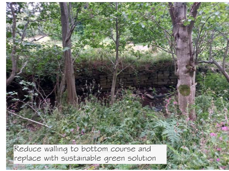
Reduce walling to bottom course and replace with sustainable green solution