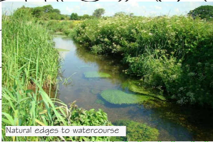
Natural edges to watercourse