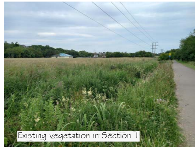
Existing vegetation in Section 1