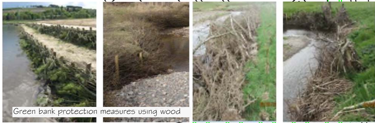
Green bank protection measures using wood