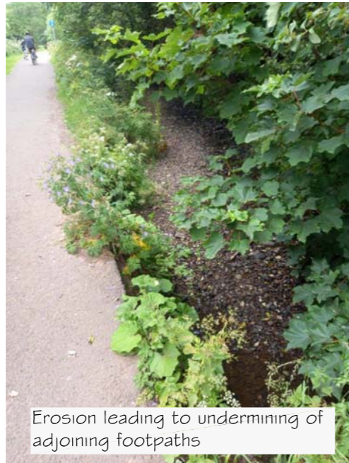
Erosion leading to undermining of adjoining footpaths