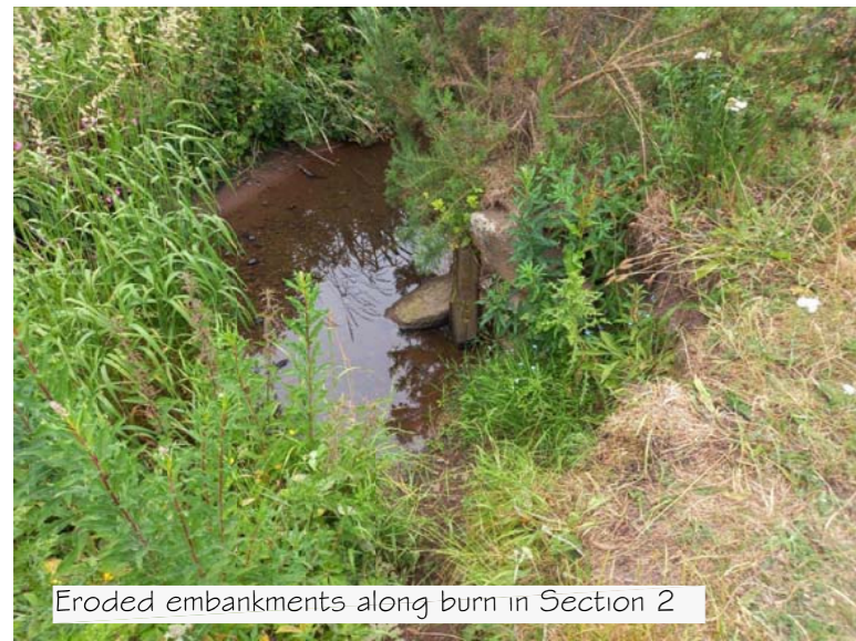
Eroded embankments along burn in Section 2