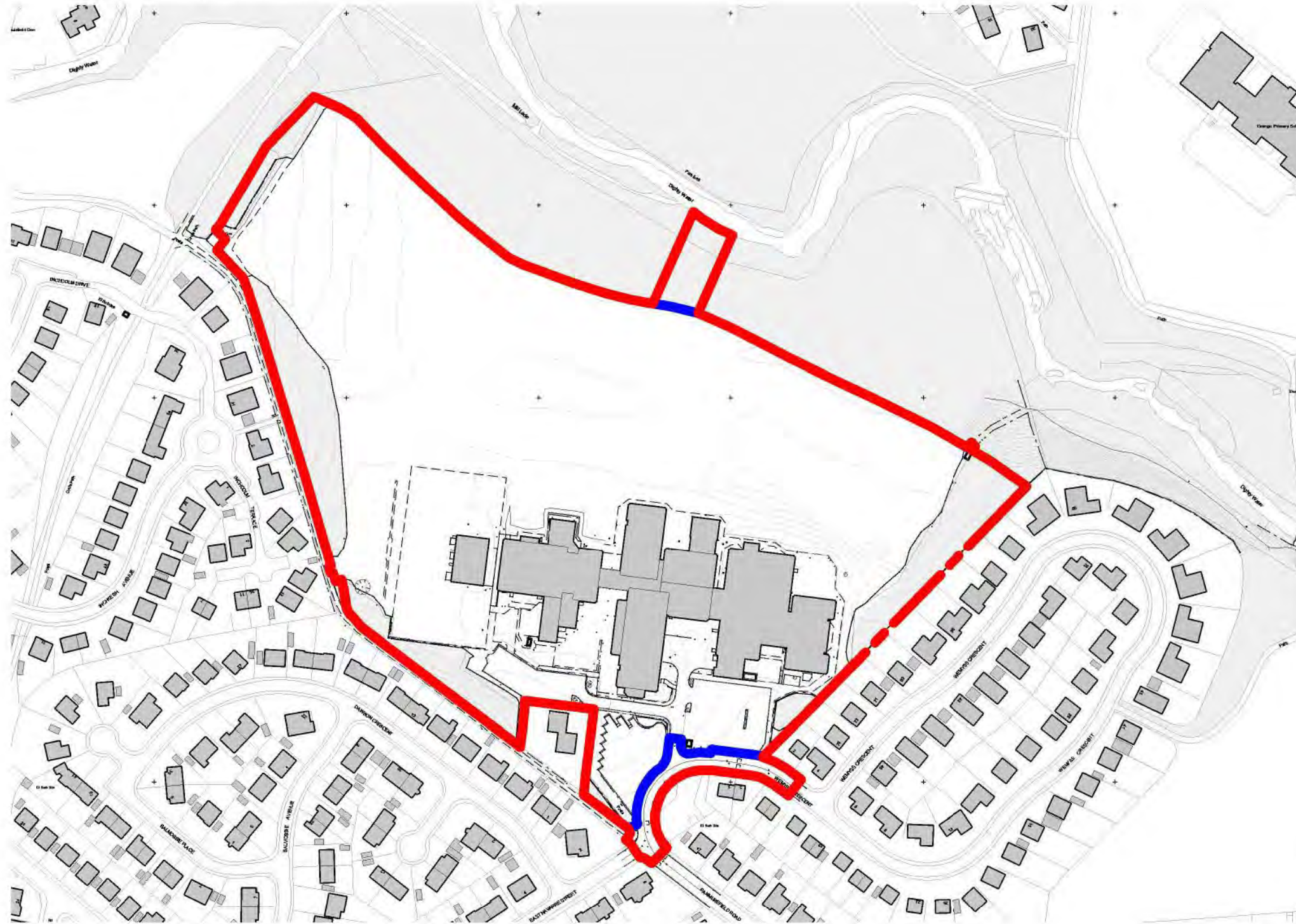
LOCATION PLAN SCALE: 1 : 2500