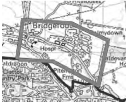
Map of area served by Service 538