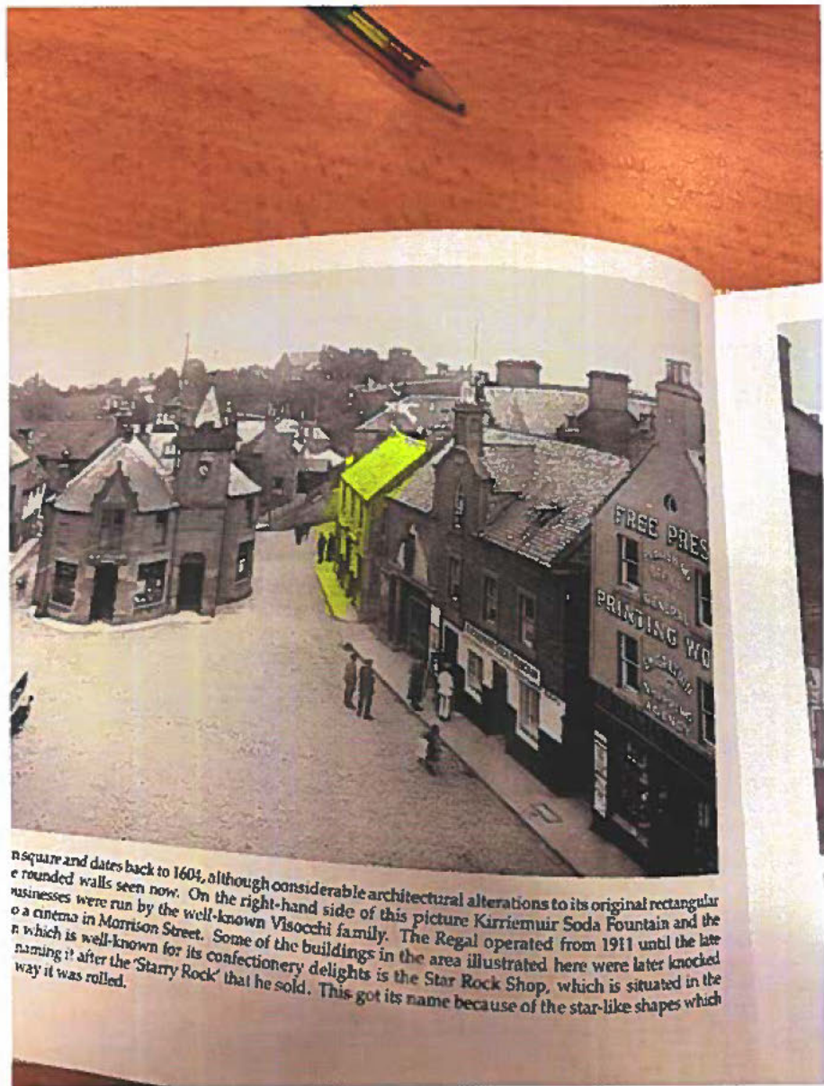
square and dates back to 1604, although considerable architectural alterations to its original rectangular rounded walls seen now. On the right-hand side of this picture Karriemuir Soda Fountain and the businesses were run by the well-known Visocchi family. The Regal operated from 1911 until the late 1920s when it was replaced by a cinema in Morrison Street. Some of the buildings in the area illustrated here were later knocked down which is well-known for its confectionery delights is the Star Rock Shop, which is situated in the way it was rolled.

MILLERS GROCERS SINCE DEMOLISHED. THIS IS NOW THE CAR PARK LEADING TO CUMBERLAND CLOSE.