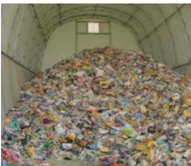
Recycling collection containers