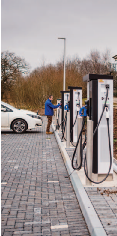
Electric vehicle charging points at Orchardbank in Forfar