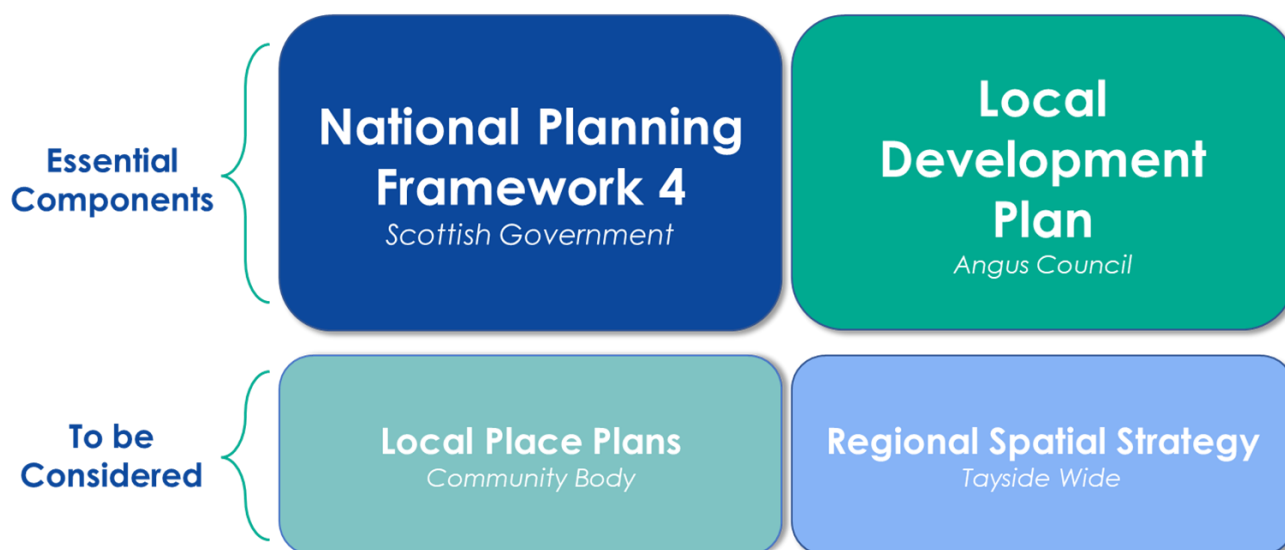
Figure 1 - New structure of the Development Planning System in Scotland.

Although the Angus Local Development Plan was adopted in 2016, it was meant to be replaced within 5 years from the date of its adoption. However, the Council decided to prepare their next LDP under the requirements of the new planning system set out in the Planning (Scotland) Act 2019. Significant delays in the new planning system coming forward, alongside the COVID-19 pandemic, greatly impacted the LDP preparation timescales in recent years.