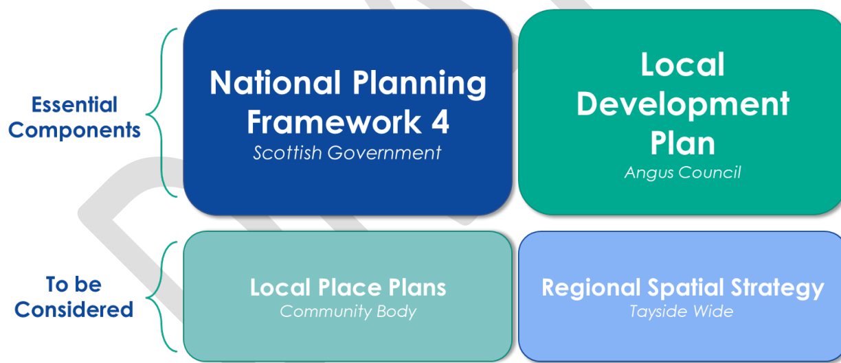
Figure 1 - New structure of the Development Planning System in Scotland.

Although the Angus Local Development Plan was adopted in 2016, it was meant to be replaced within 5 years from the date of its adoption. However, the Council decided to prepare their next LDP under the requirements of the new planning system set out in the Planning (Scotland) Act 2019. Significant delays in the new planning system coming forward, alongside the COVID-19 pandemic, greatly impacted the LDP preparation timescales in recent years.