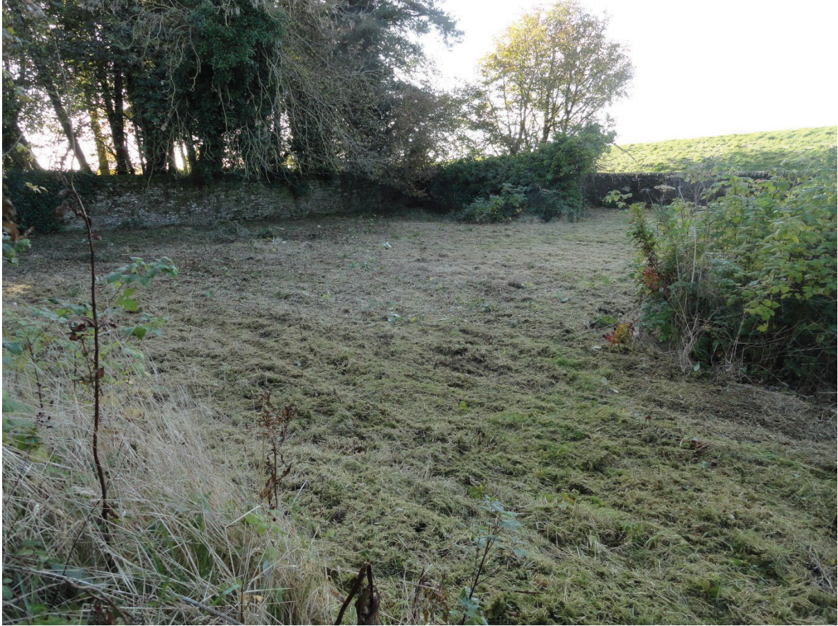
Ground level view of proposed site looking South-West (weeds cut)