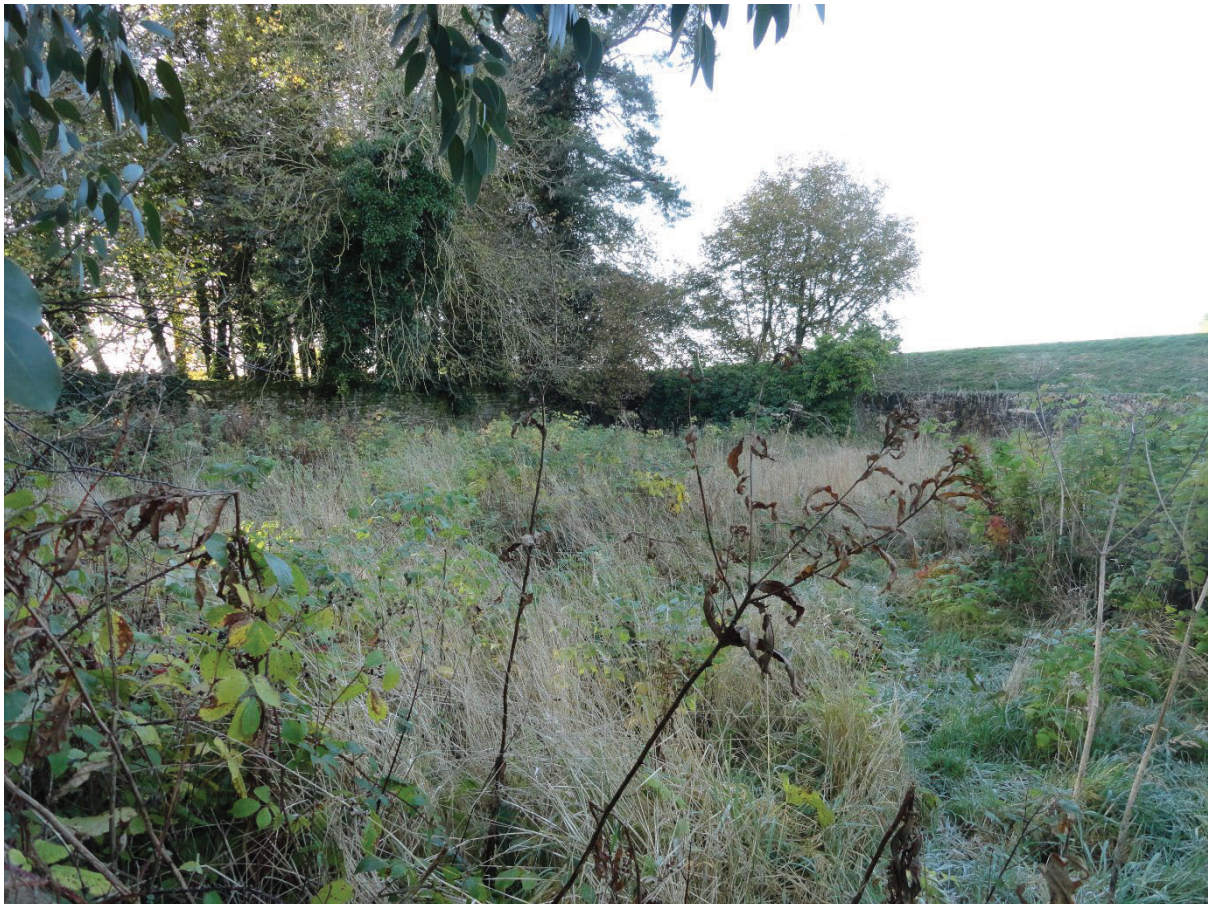
Ground level view of proposed site looking South-West (weeds uncut)