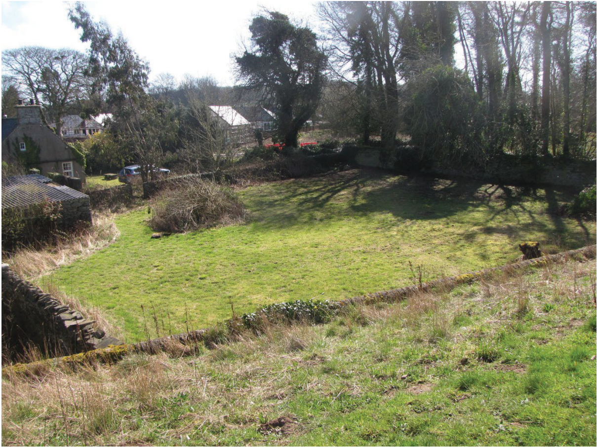
View of proposed site looking South-East from elevated reservoir path.