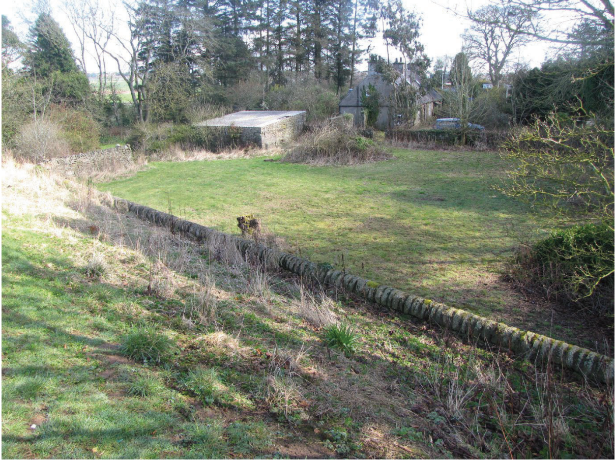
View of proposed site looking North-East from elevated reservoir path