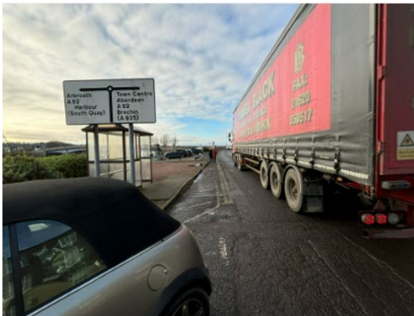
Current conditions for active travel on Wharf Street

External funding support will be sought to progress these improvements in future years.