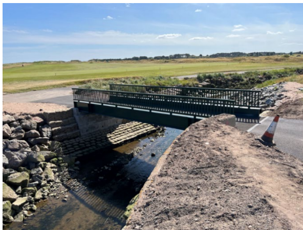
Example of new steel bridge