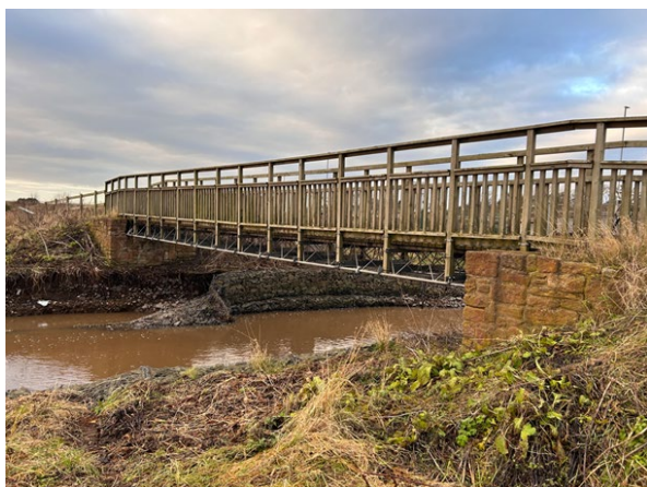
Existing wooden bridge

Funding was made available by Sustrans Scotland late last year for the purchase of new structures for the Elliot Water to Easthaven route. The £74,821.96 received allowed for the purchase of two structures including a new 15m span bridge over Elliot Water. The new bridge is wider, more accessible and ties into future plans to improve the section from the bridge heading west to connect to previous improvements. The funding awarded for this financial year will allow for the construction of the path improvements and installation of the new bridge. This new structure will also bolster future funding bids for other local active travel projects and allow for better access for both maintenance and construction of future sections. Construction of the path and installation of the bridge will take place in early autumn.