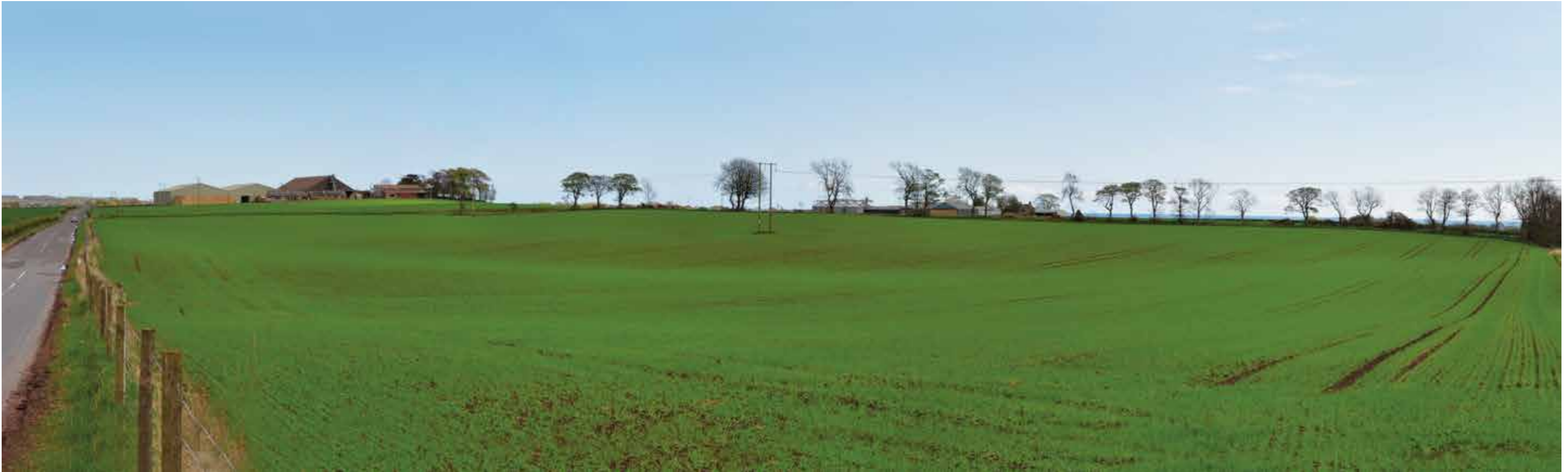
3.8 Approach from South-West via B9127 (Arbirlot / East Muirlands Road)