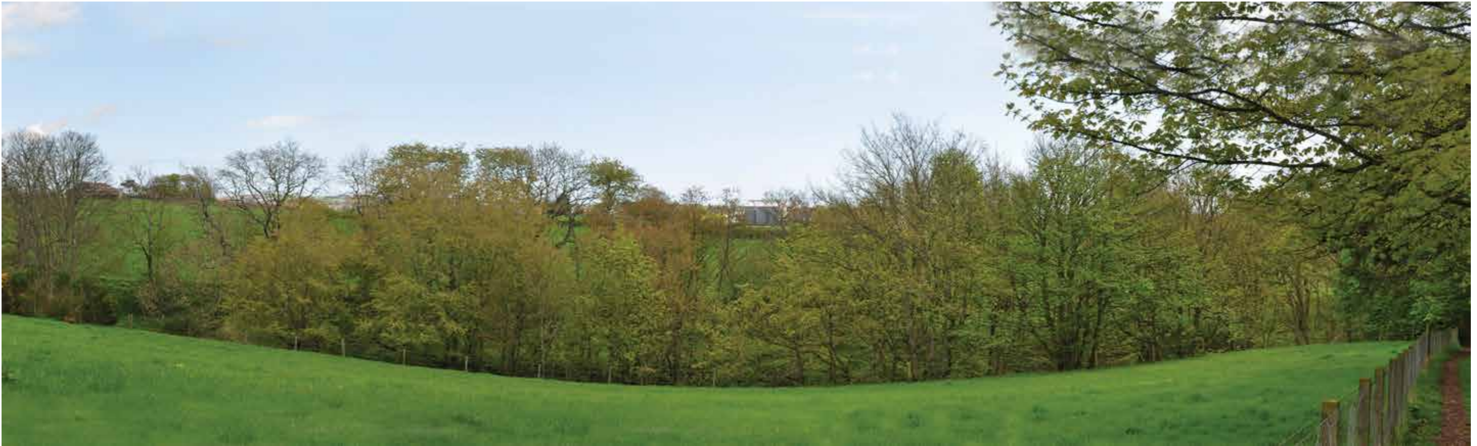
3.2 Arbroath from Elliot Nature Trail