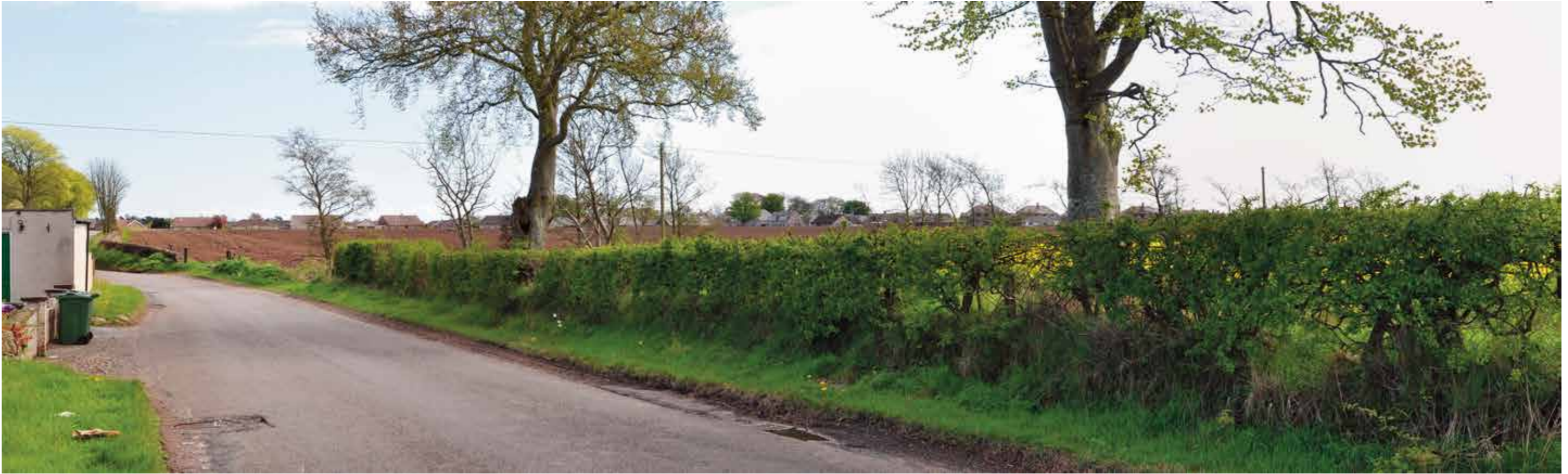
3.12 Approach from North-West via C51 (from Woodville Feus)