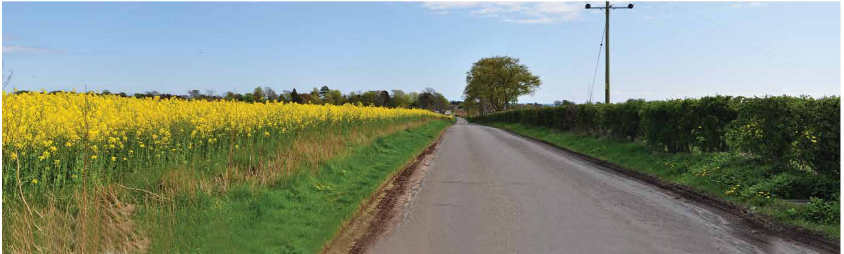
3.11 Approach from North-West via C51 (from Woodville Feus)