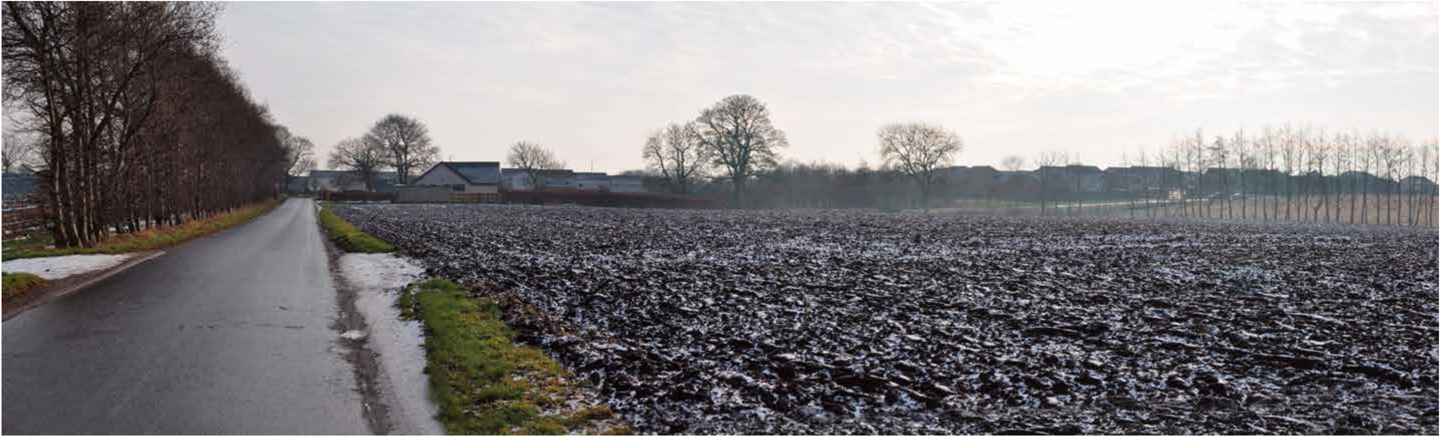
3.14 Approach via U492 (from Mains of Letham)