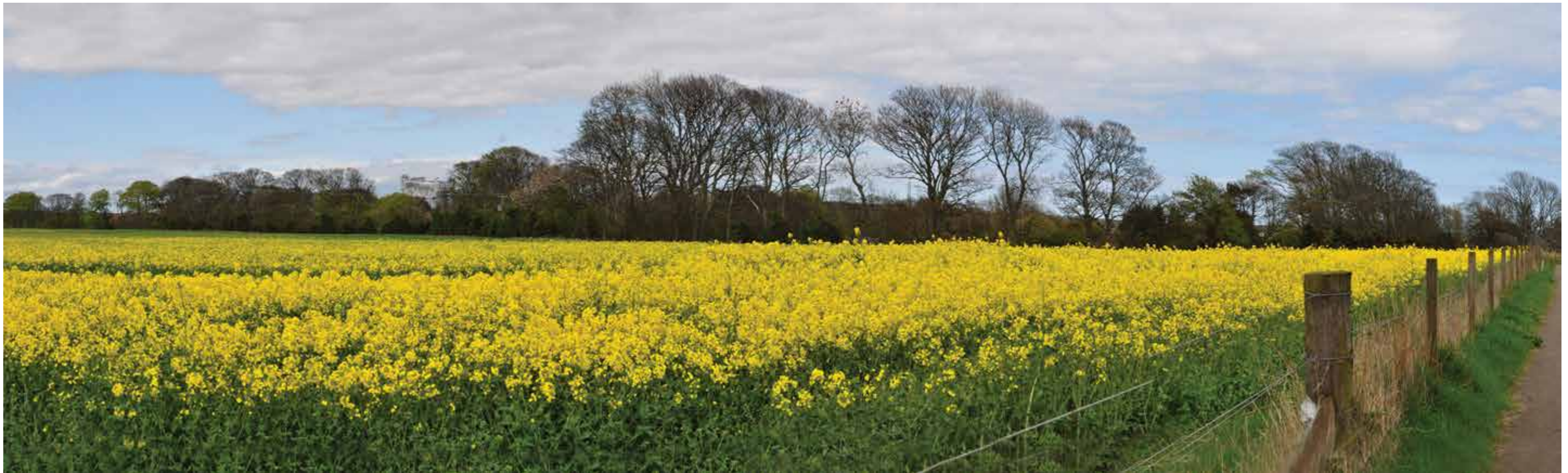
3.7 Approach from South-West via A92 (Dundee Road)