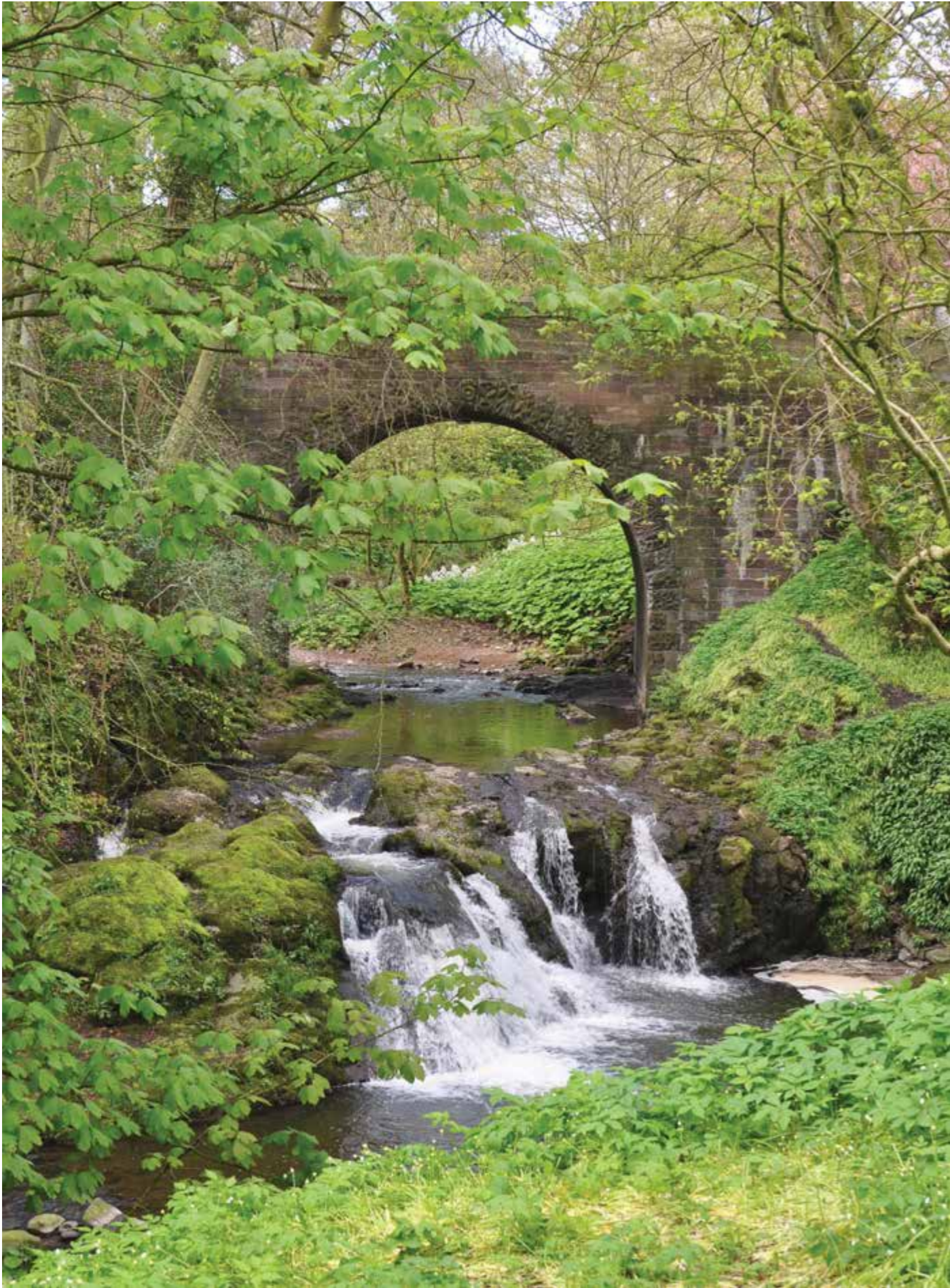
3.3 Elliot Nature Trail