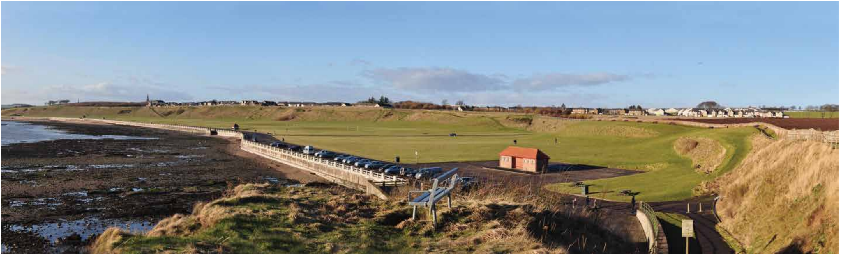
3.1 Arbroath from Seaton Cliffs