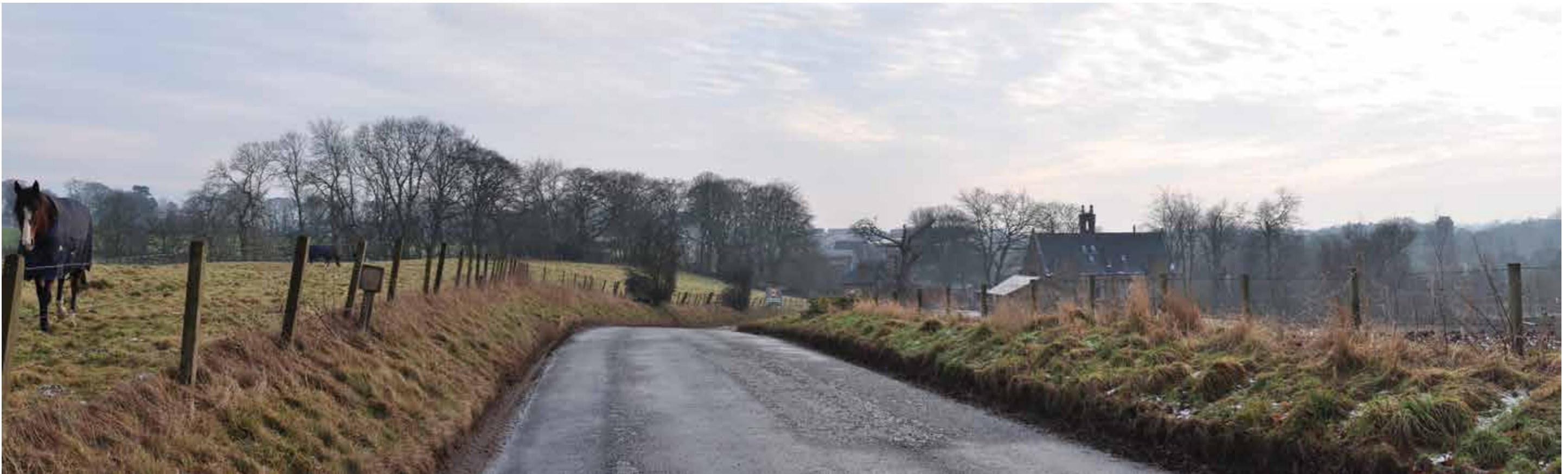
3.15 Approach from North via C48 (from Letham Grange)