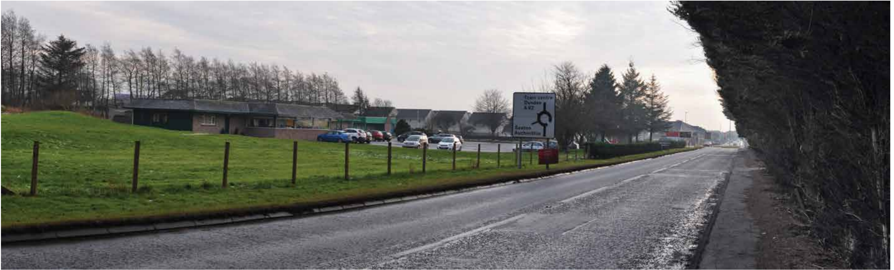
3.16 Approach from North via A92 (Montrose Road)