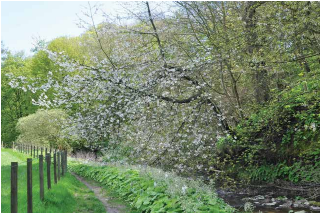
3.5 Elliot Nature Trail