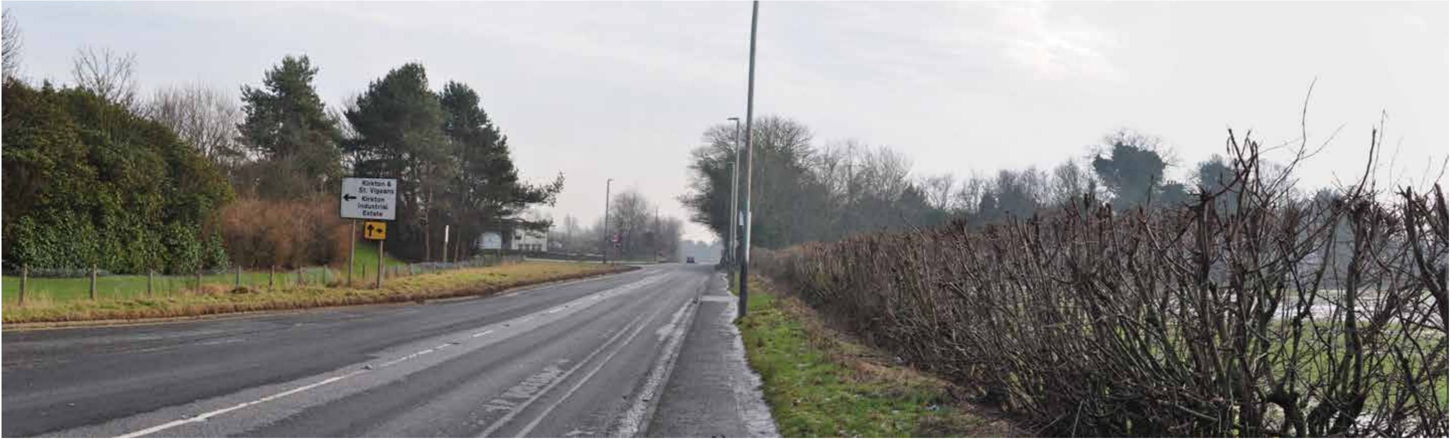
3.13 Approach from North-West via A933 (Forfar Road)