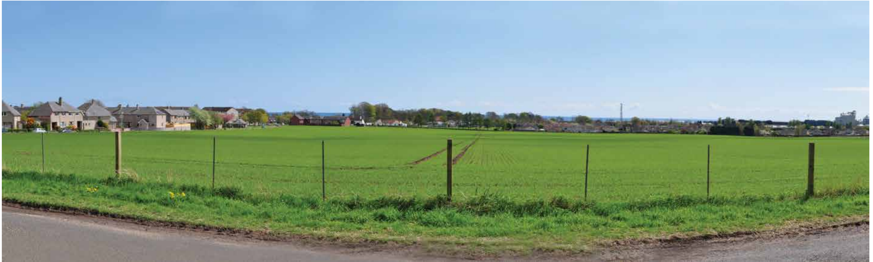
3.10 Approach from South-West via B9127 (Arbirlot / East Muirlands Road)