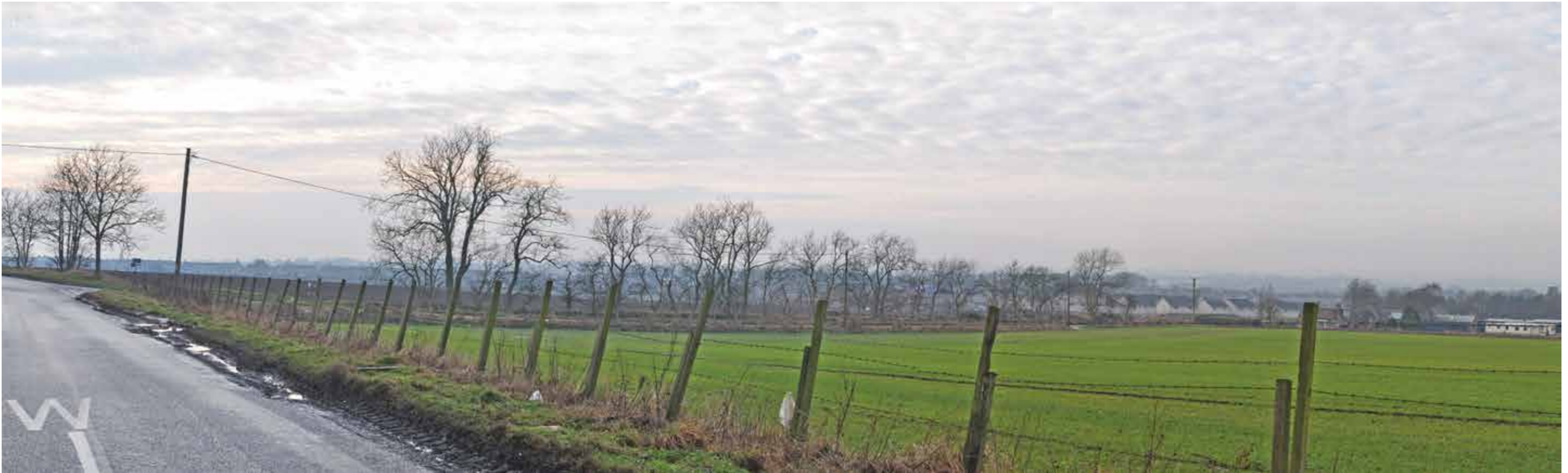
3.17 Approach from North via C46 (Seaton Road)