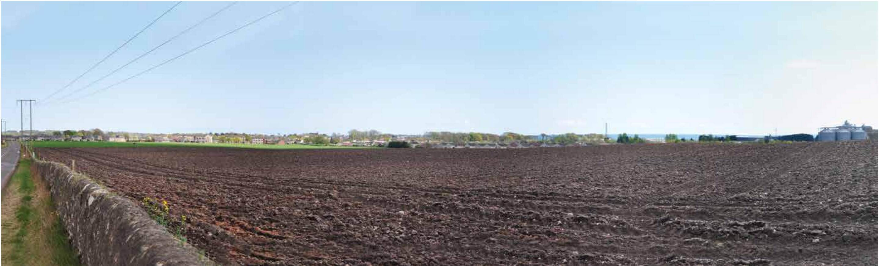
3.9 Approach from South-West via B9127 (Arbirlot / East Muirlands Road)