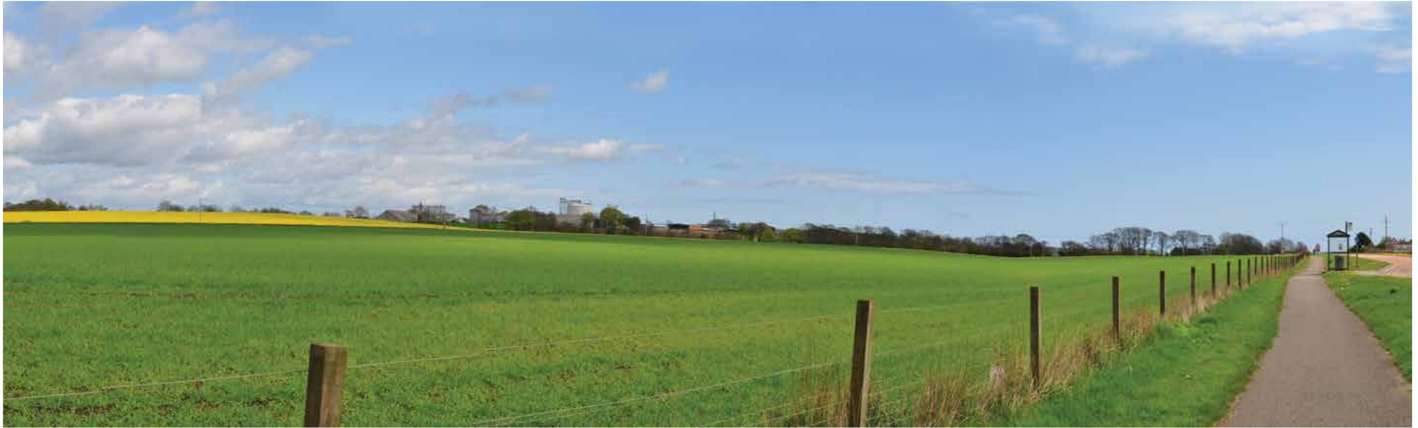
3.6 Approach from South-West via A92 (Dundee Road)