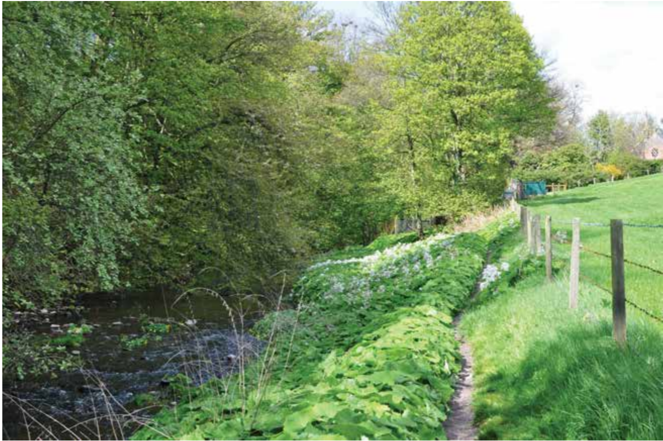
3.4 Elliot Nature Trail