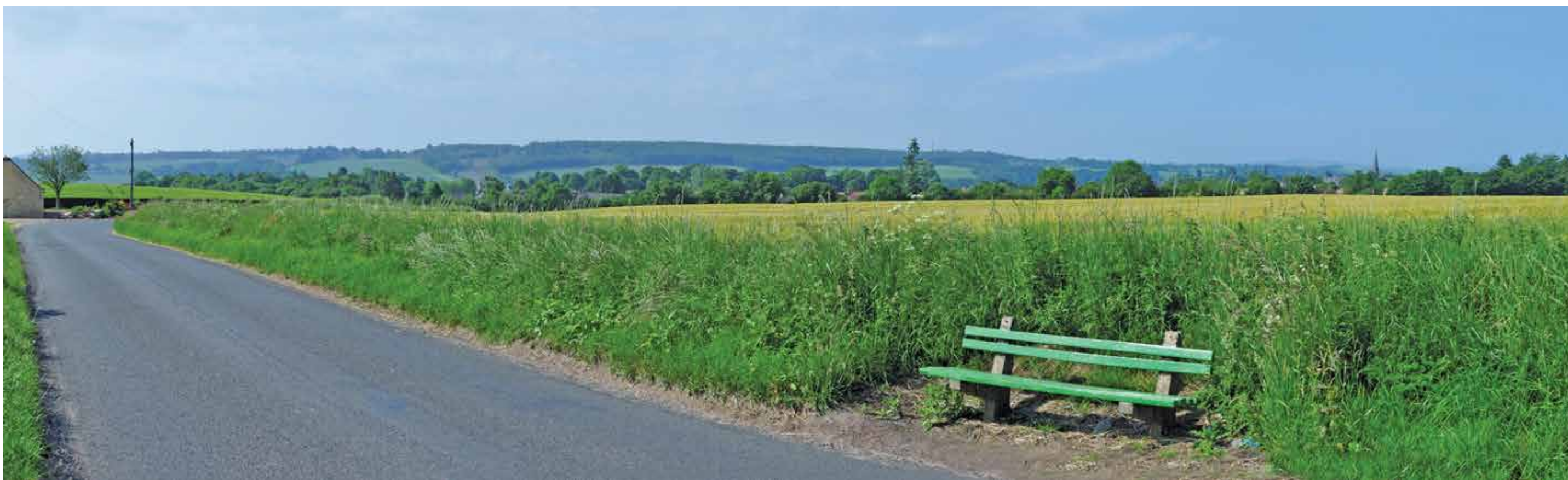
4.12 Approach from North via C40 (Towards Mains of Pitforthie)