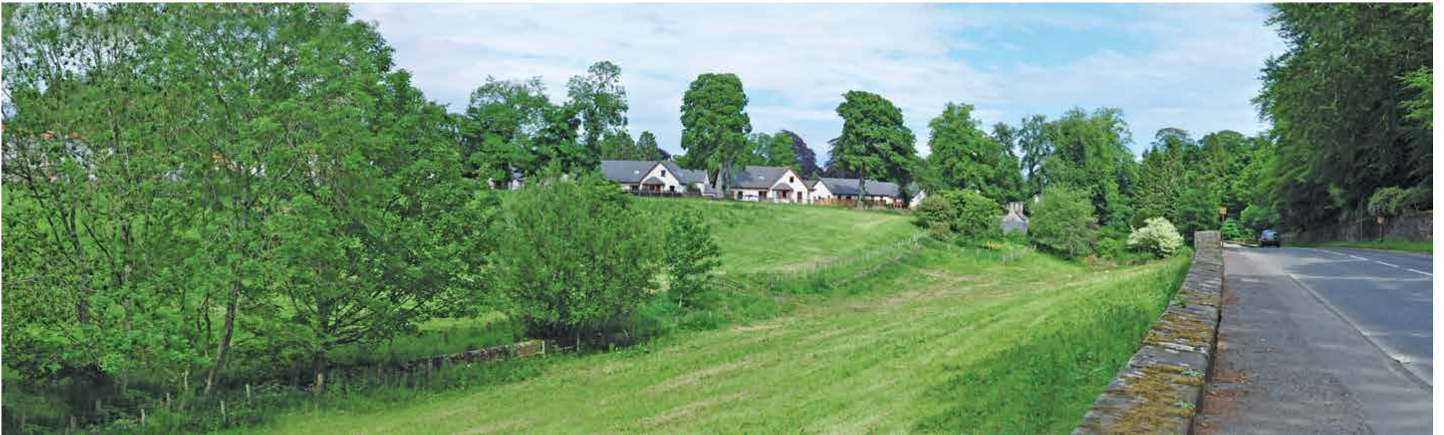
4.8 Approach from West via A935 (Castle Street)