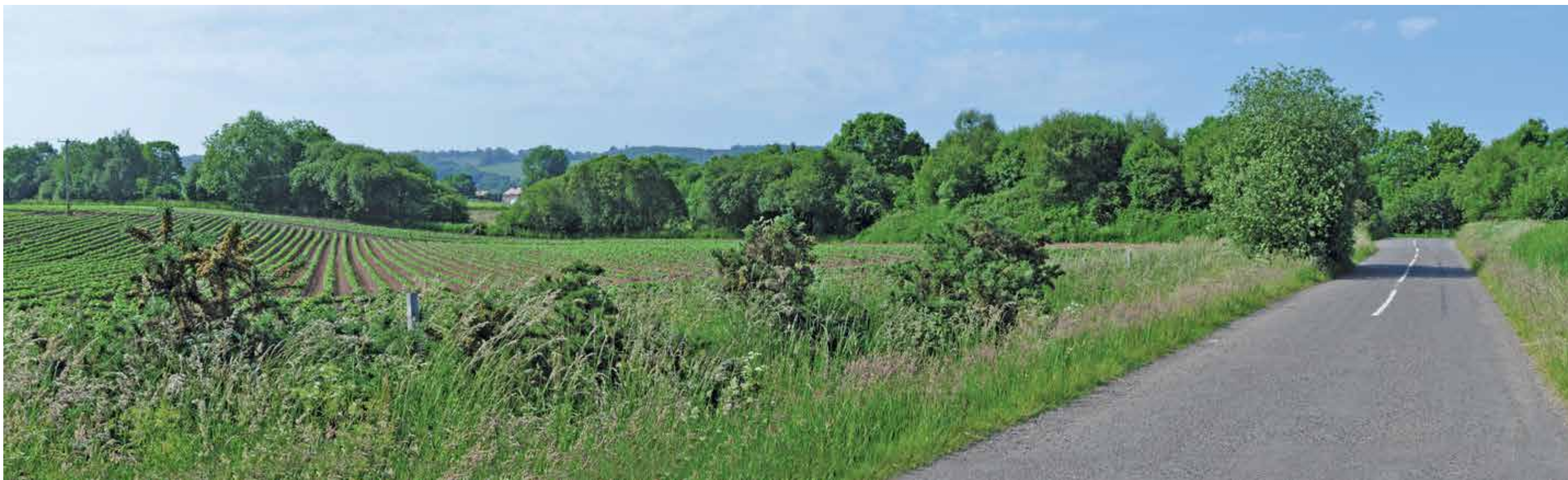
4.11 Approach from North-East via U442 (Towards East Pitforthie)