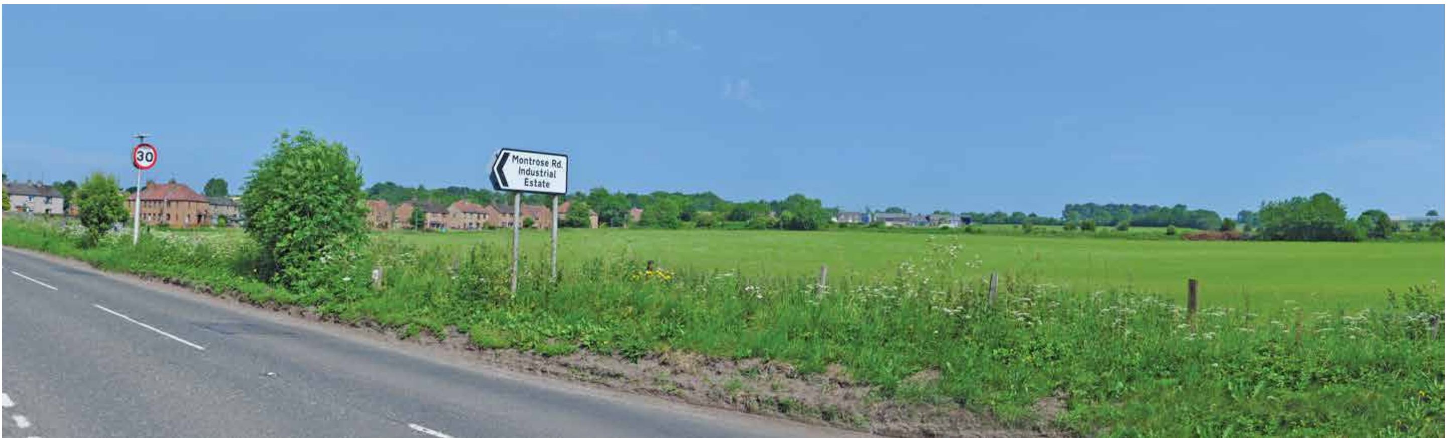
4.10 Approach from East via A935 (Montrose Street)