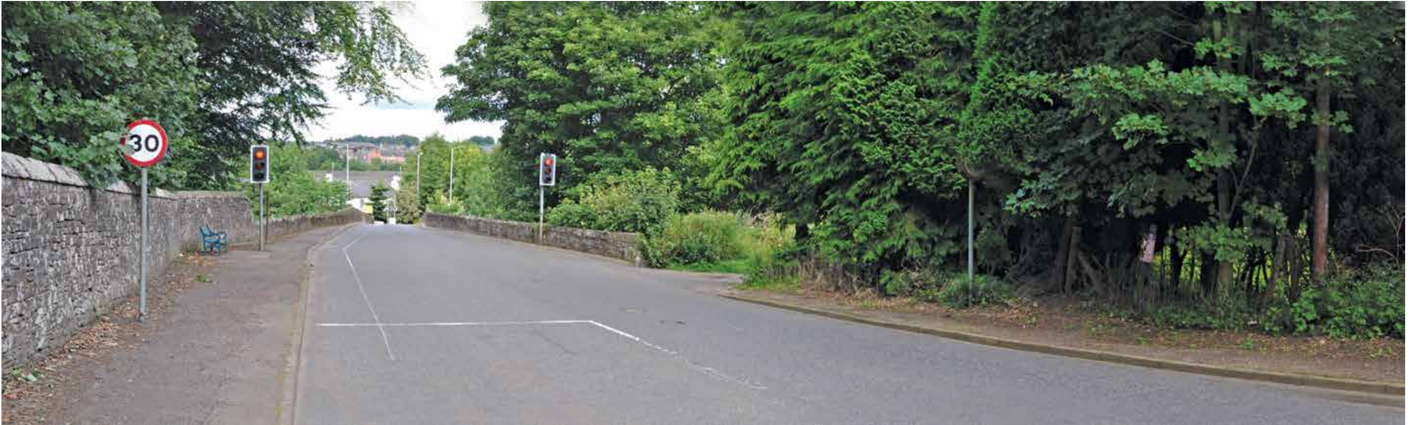
4.9 Approach from South via A933 (River Street)