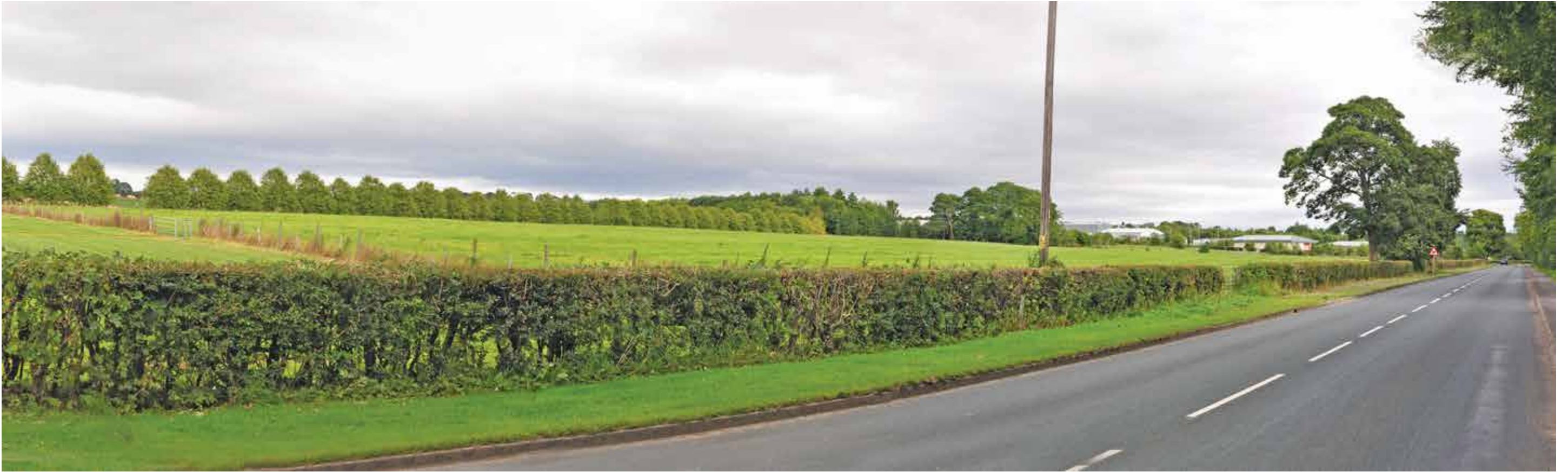
4.7 Approach from West via A935 (Castle Street)