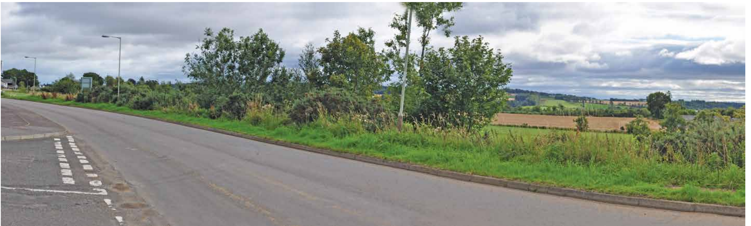
4.16 Approach from North-West via U415 (Pittendrieck Road)