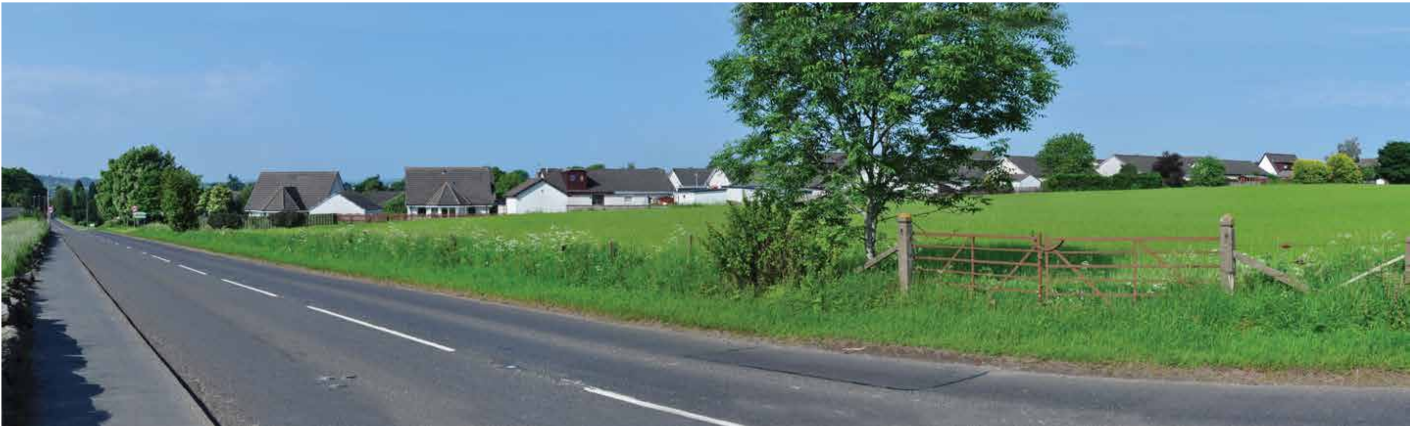
4.14 Approach from North via B966 (Trinity Road)