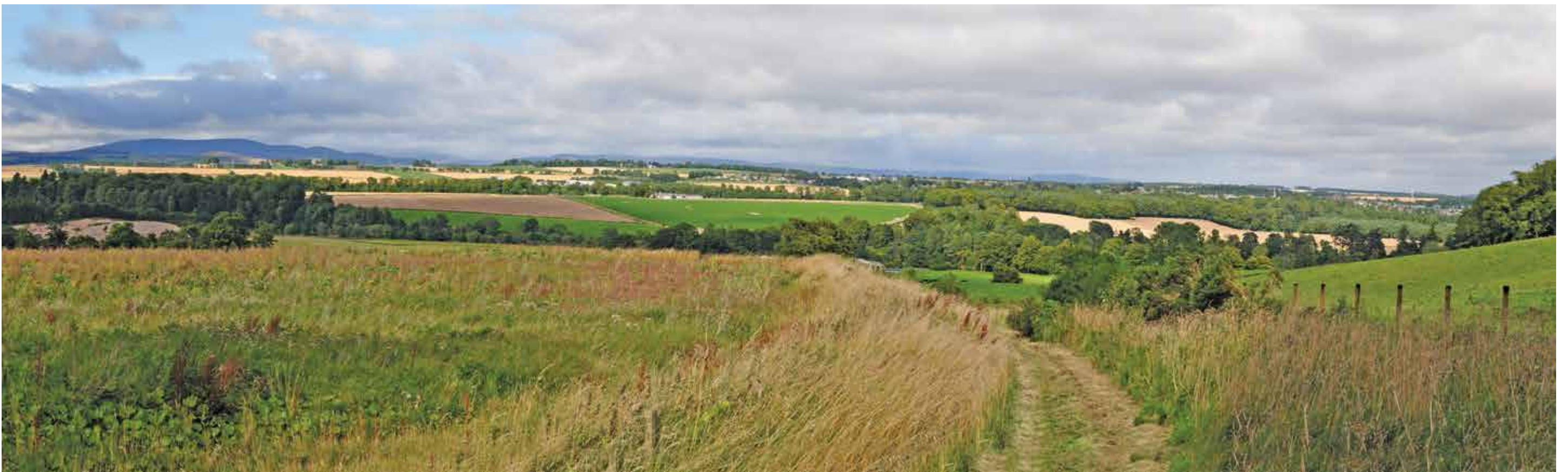
4.4 Brechin from Core Path 063, Burghill