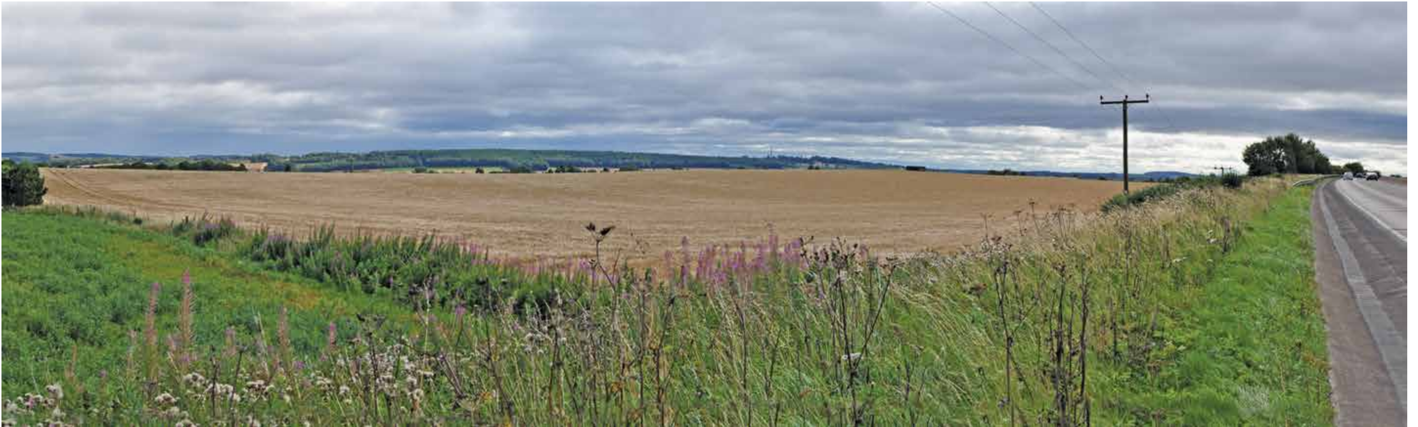
4.6 View from A90(T) Southbound