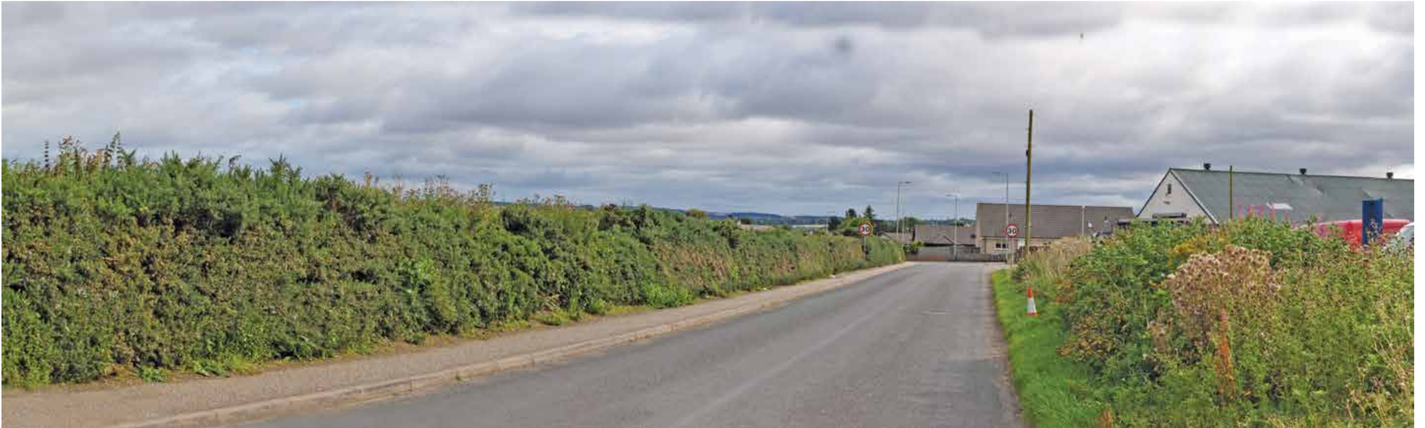
4.15 Approach from North via C30 (Cookston Road)