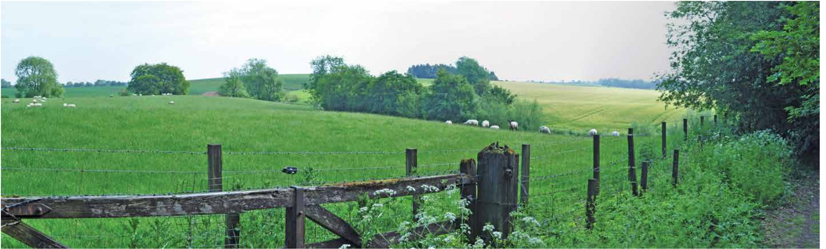
4.1 View North from Brechin Nature Trail (Core Path 053)