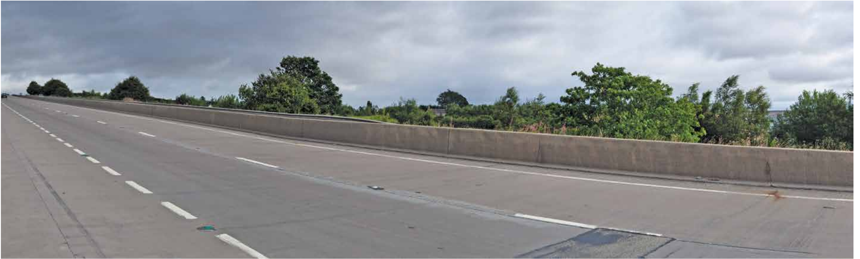
4.5 View from A90(T) Northbound