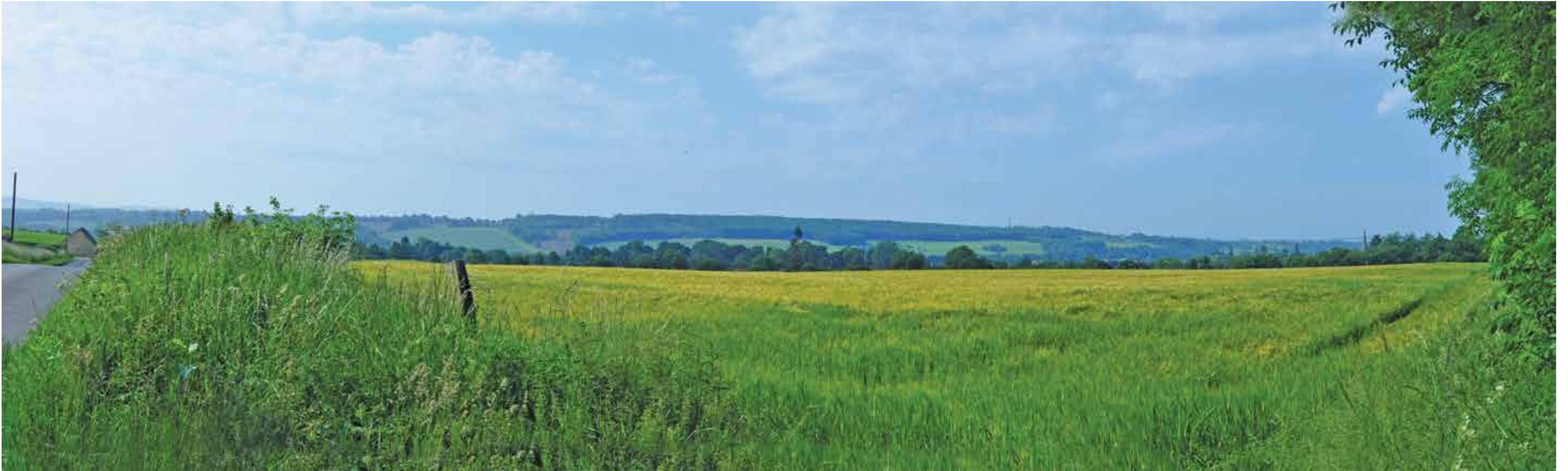
4.3 View from C40 at Core Path 054