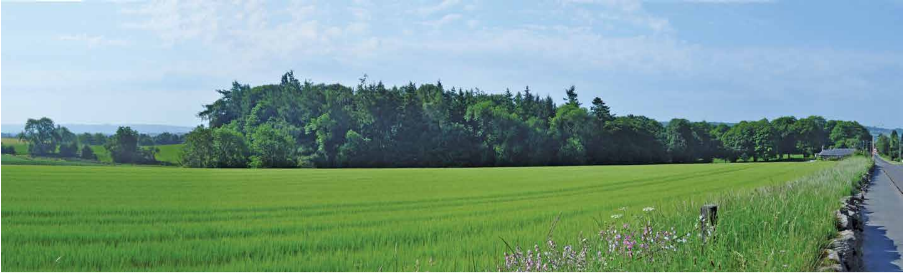
4.13 Approach from North via B966 (Trinity Road)