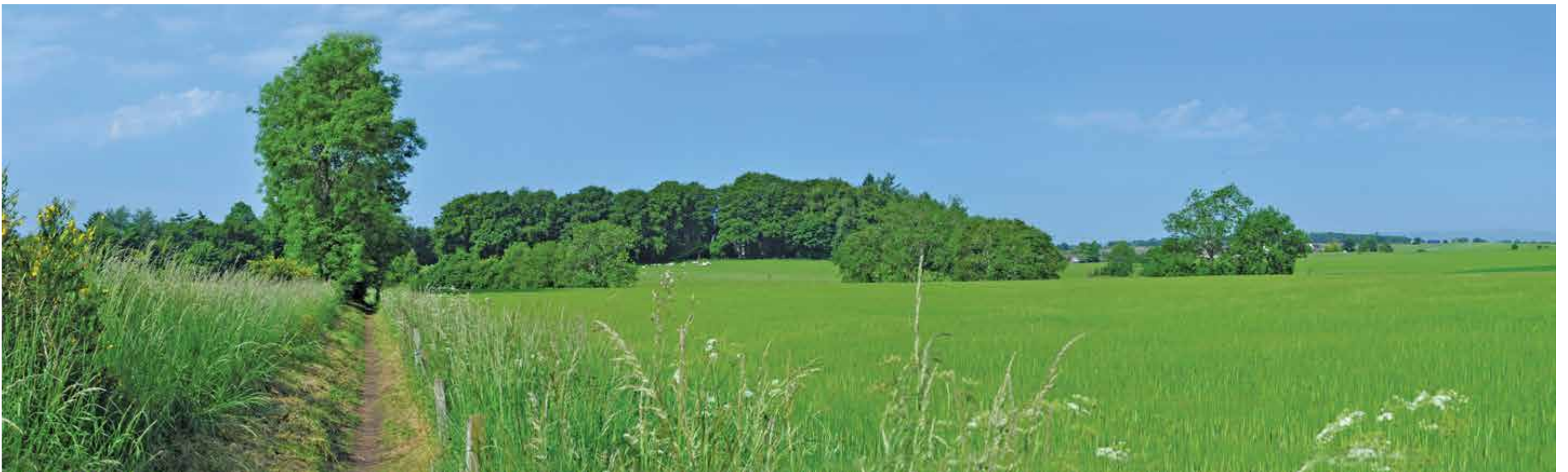
4.2 View from Core Path 054