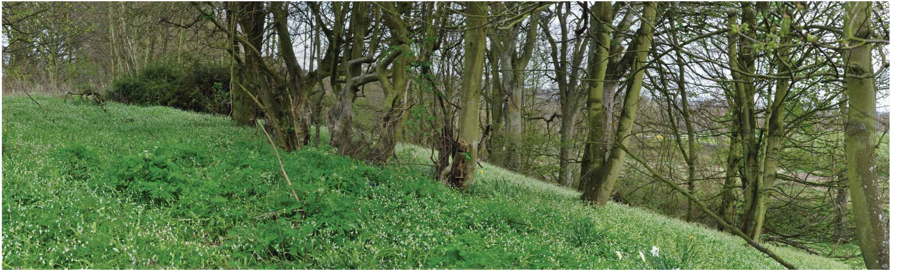
5.1 Raised Beach Escarpment from Core Path 174 ( click here to return to text )