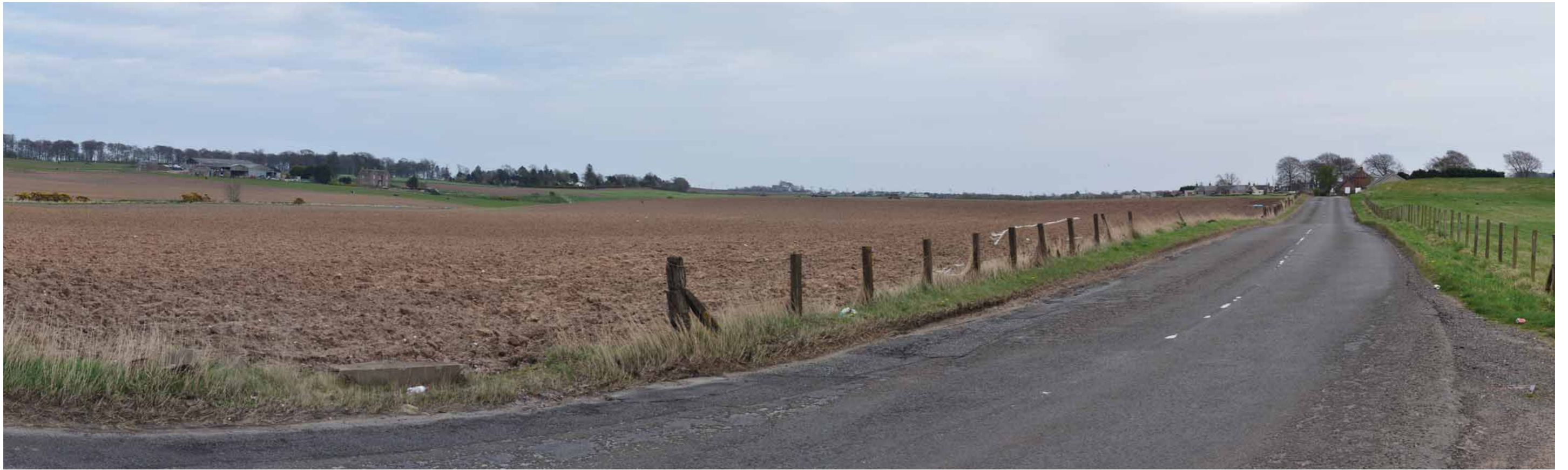
5.8 Approach from North via C62 (Balmachie Road) ( click here to return to text )