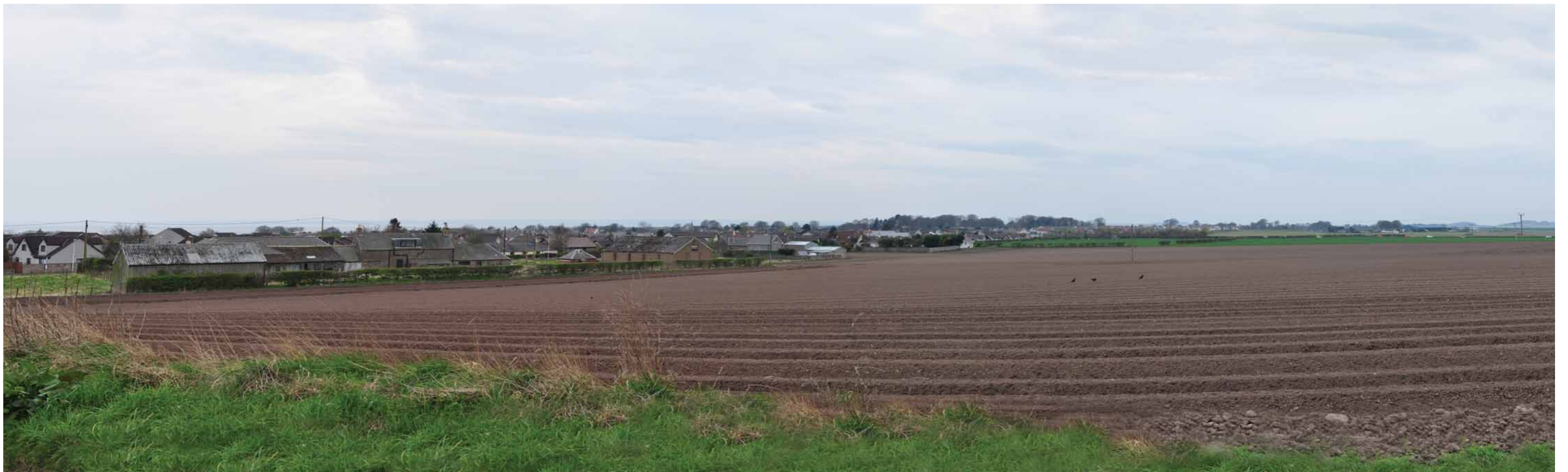
5.13 Approach from the North via U508-2 (From U508 Panbride Crossroads to A930) ( click here to return to text )