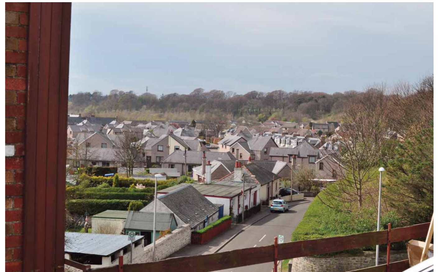
5.3 Raised Beach Escarpment from Terrace Road ( click here to return to text )