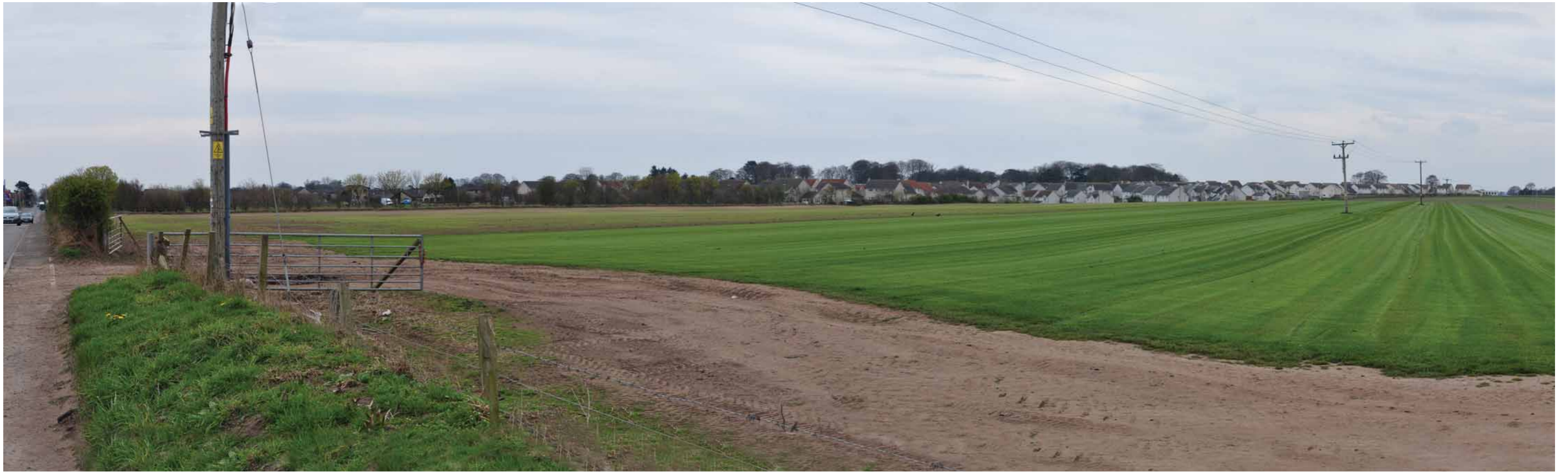
5.12 Approach from North via A930 (Carlogie Road) ( click here to return to text )