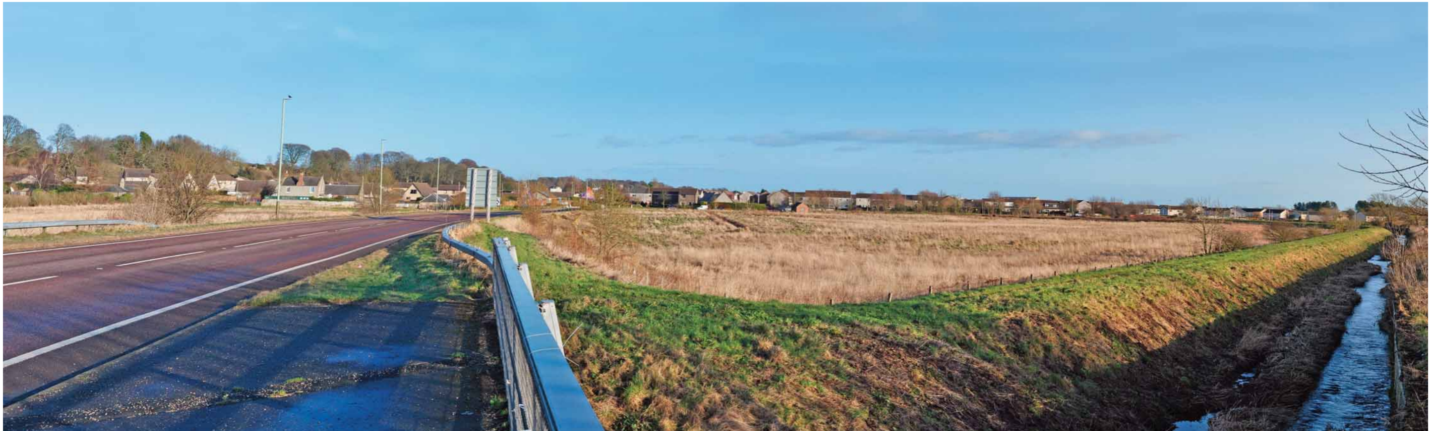
5.5 Approach from West via A930 (Barry Road) ( click here to return to text )