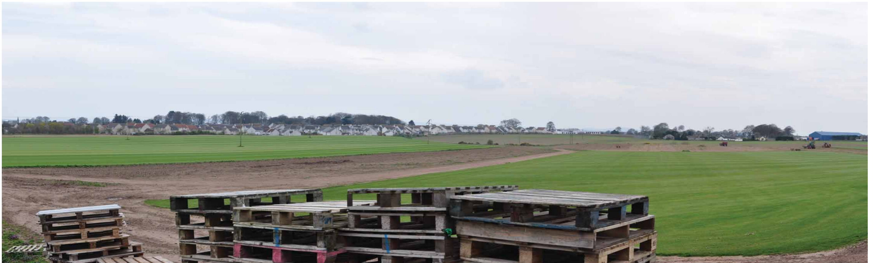
5.11 Approach from North via A930 (Carlogie Road) ( click here to return to text )