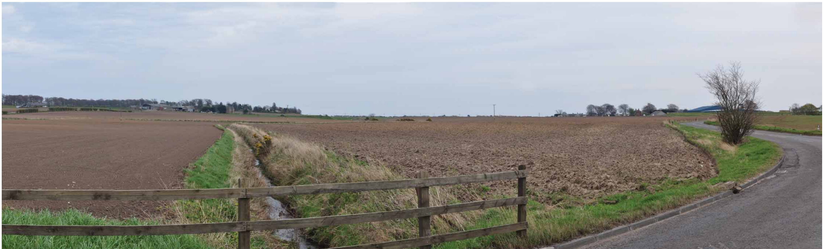
5.7 Approach from North via C62 (Balmachie Road) ( click here to return to text )