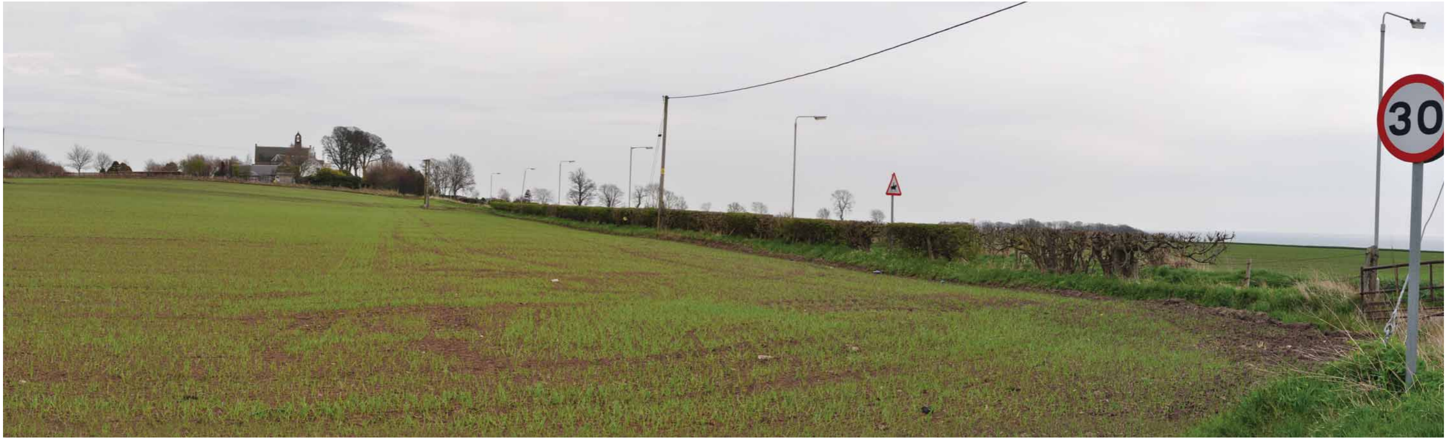
5.14 Approach from the North via U508-2 (From U508 Panbride Crossroads to A930) ( click here to return to text )