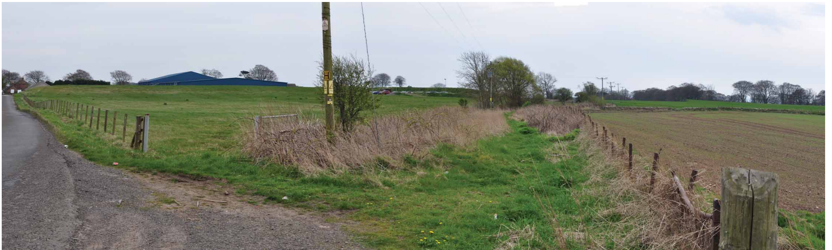
5.9 Approach from North via C62 (Balmachie Road) ( click here to return to text )