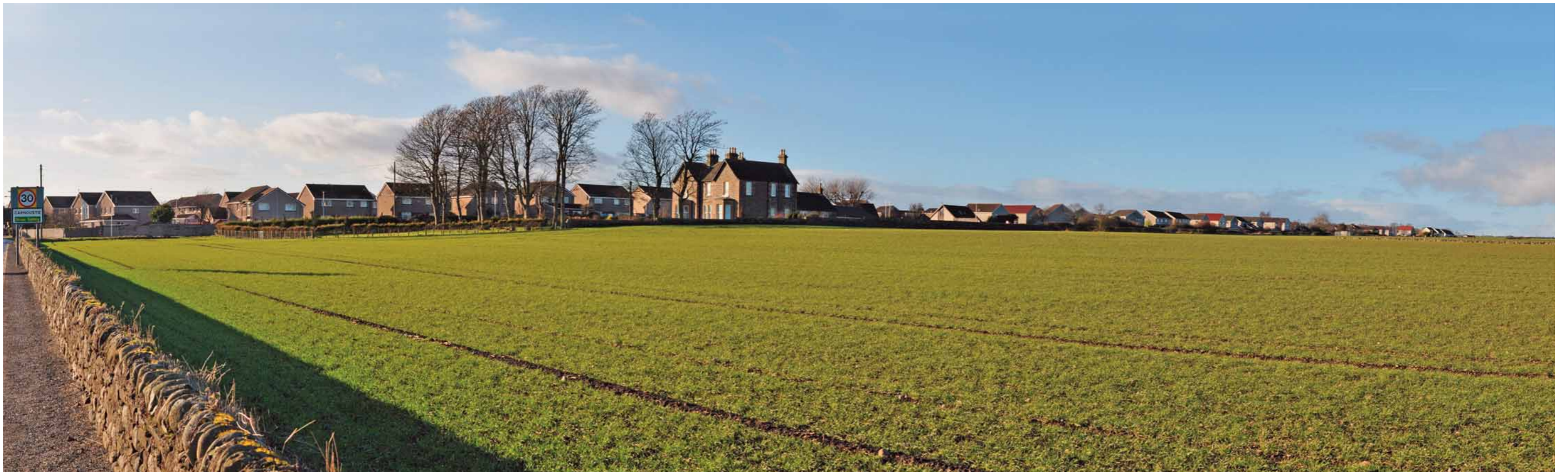
5.15 Approach from East via C61 (Easthaven Road) ( click here to return to text )