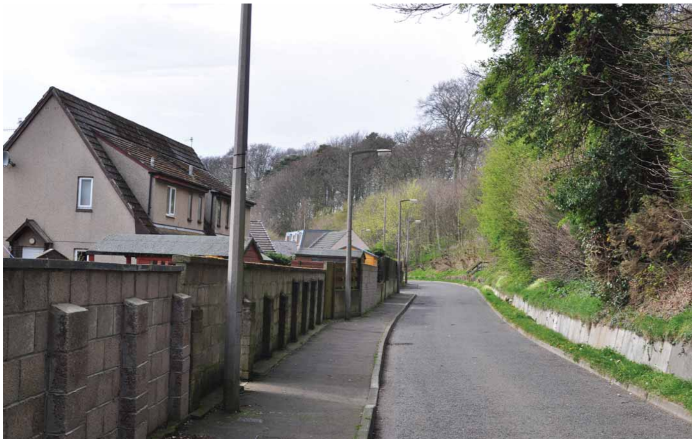
5.2 Raised Beach Escarpment from Braefoot ( click here to return to text )