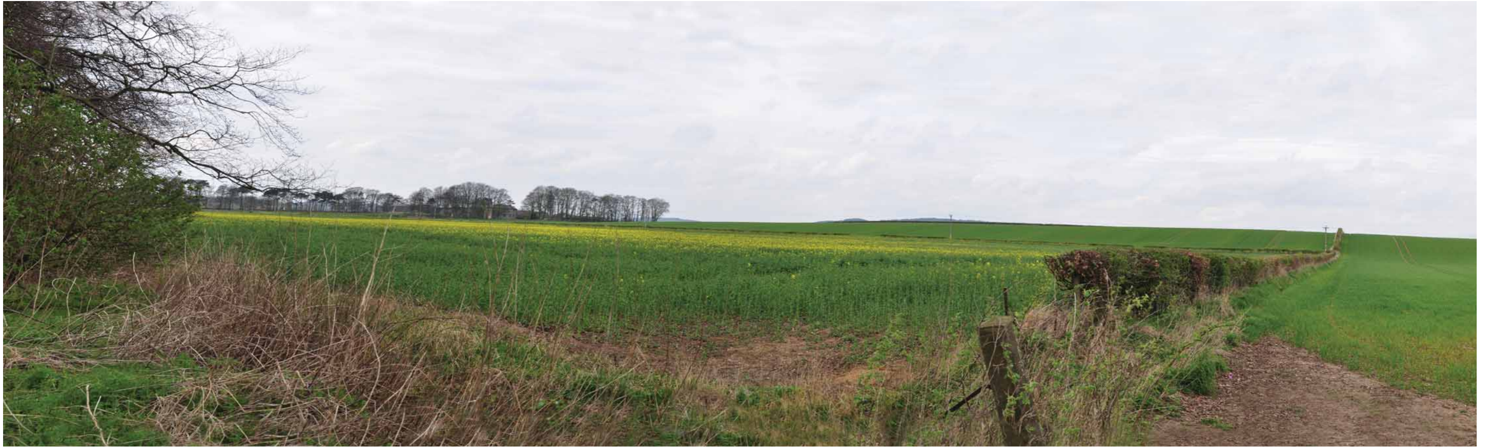
5.16 Pitskelly Farm from Core Path 176 ( click here to return to text )