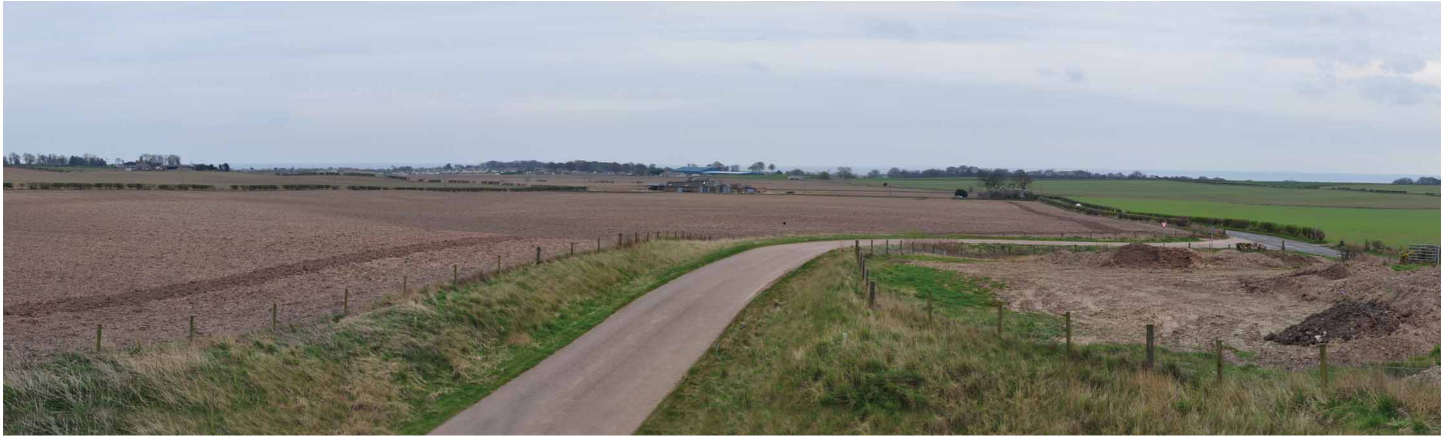
5.4 Carnoustie from A92 ( click here to return to text )