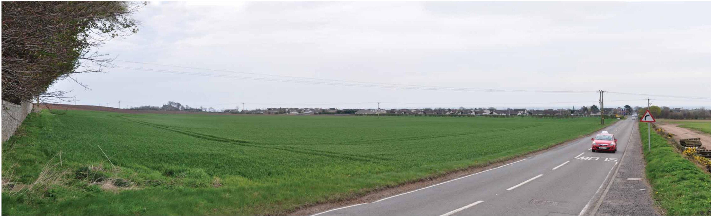
5.10 Approach from North via A930 (Carlogie Road) ( click here to return to text )