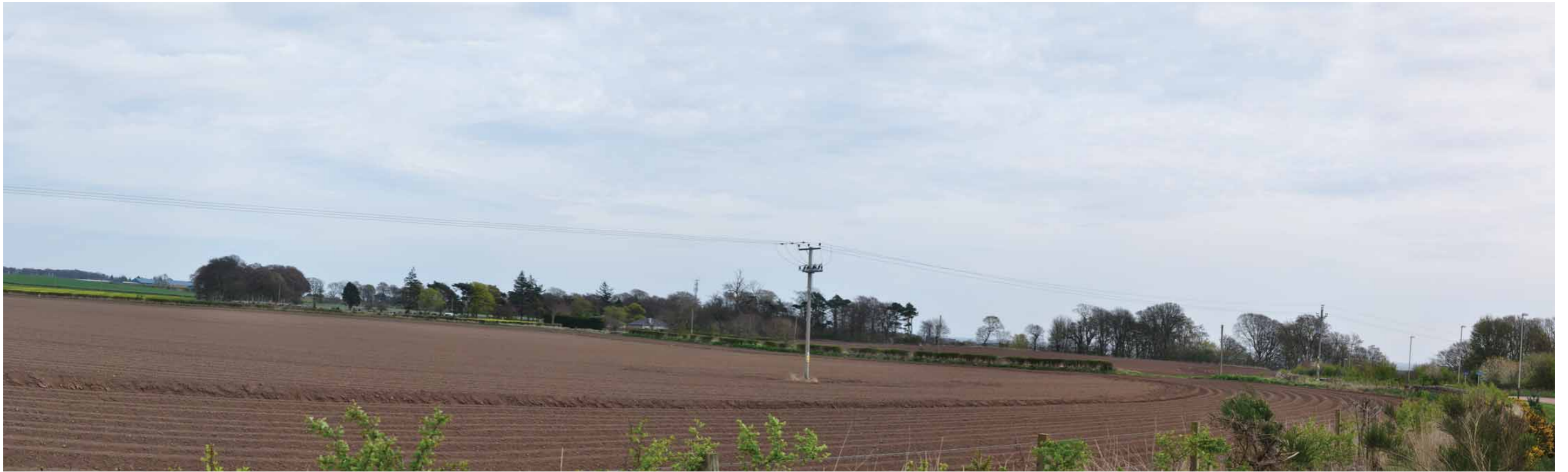
5.6 Approach from North via C1 (towards Upper Victoria) ( click here to return to text )