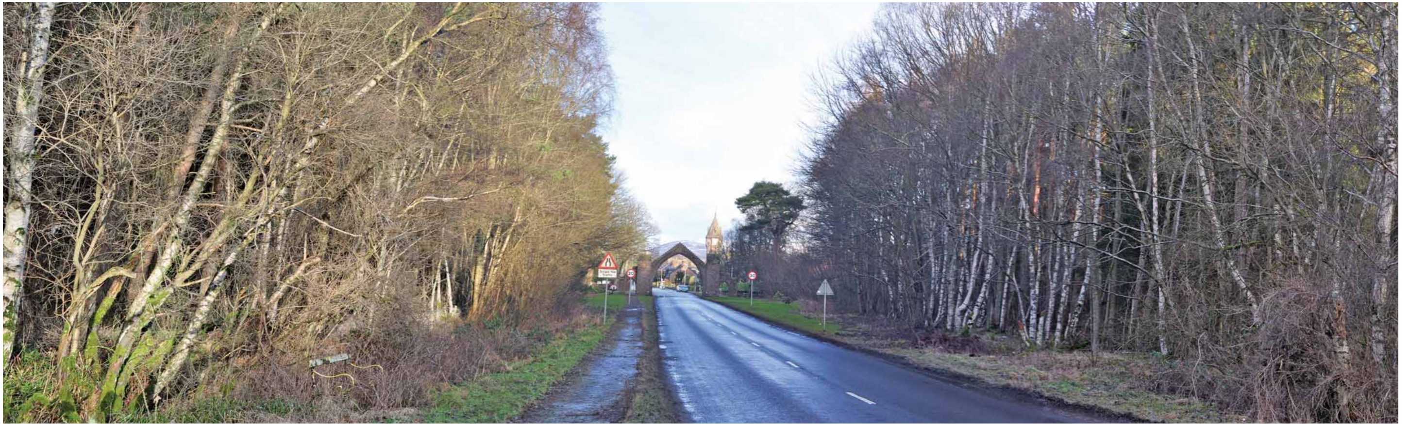
10.1 Approach from South via B966 (towards Brechin) ( click here to return to text )