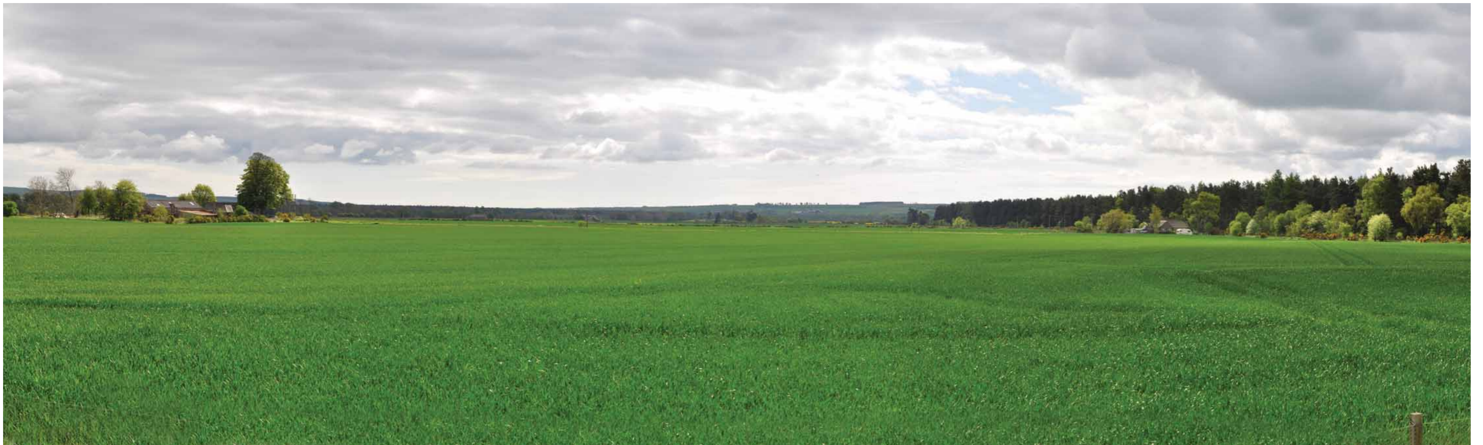
10.8 East of Edzell from Durie Place ( click here to return to text )