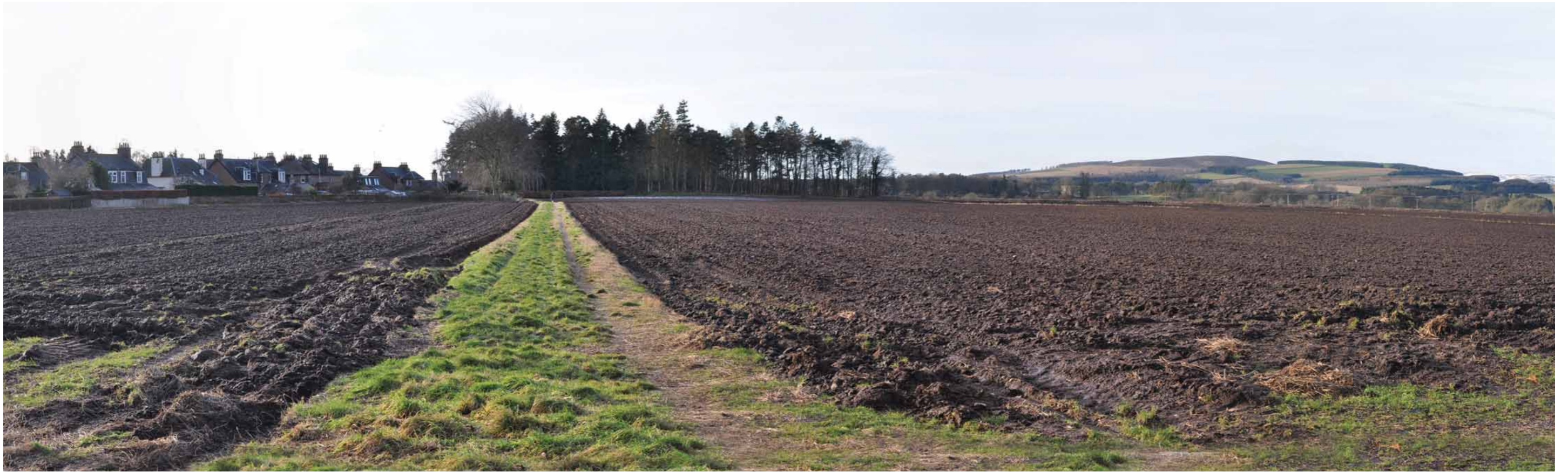
10.5 West of Edzell from Core Path 014 ( click here to return to text )