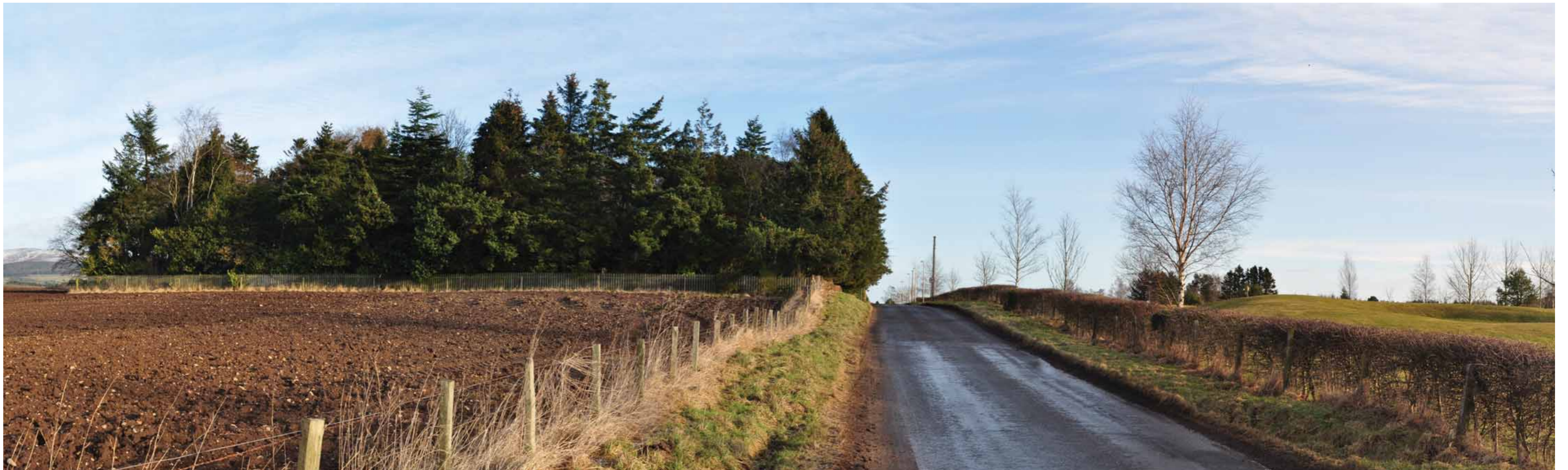
10.2 Approach from South West via U428 (Dunlappie Road) ( click here to return to text )