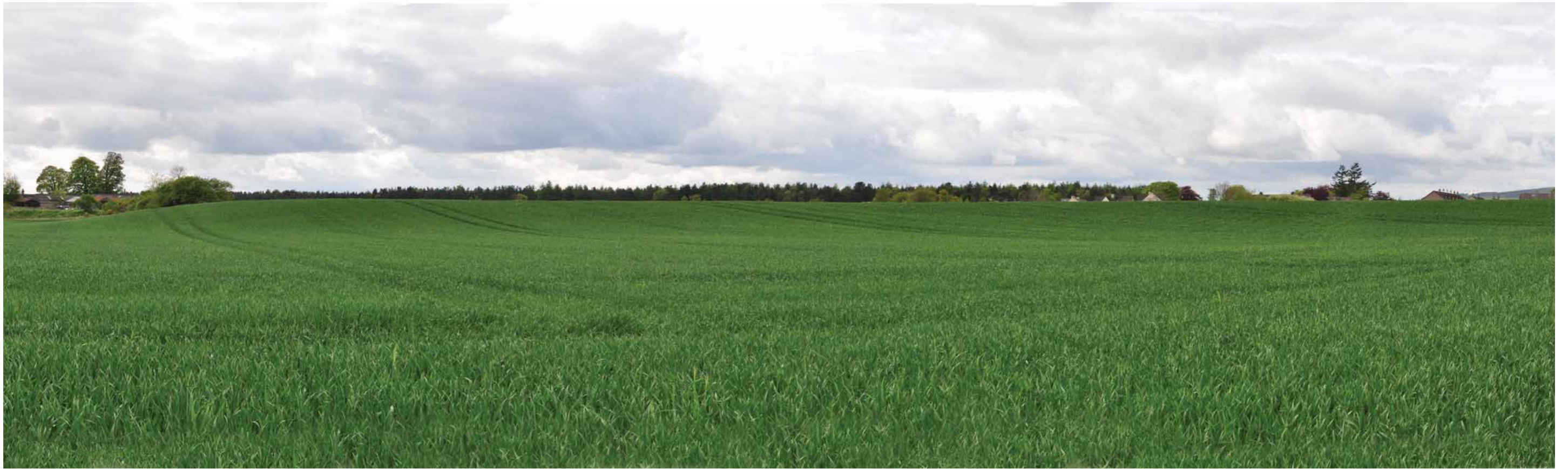
10.7 Kame Terrace Escarpment from Edzell Sewage Works ( click here to return to text )