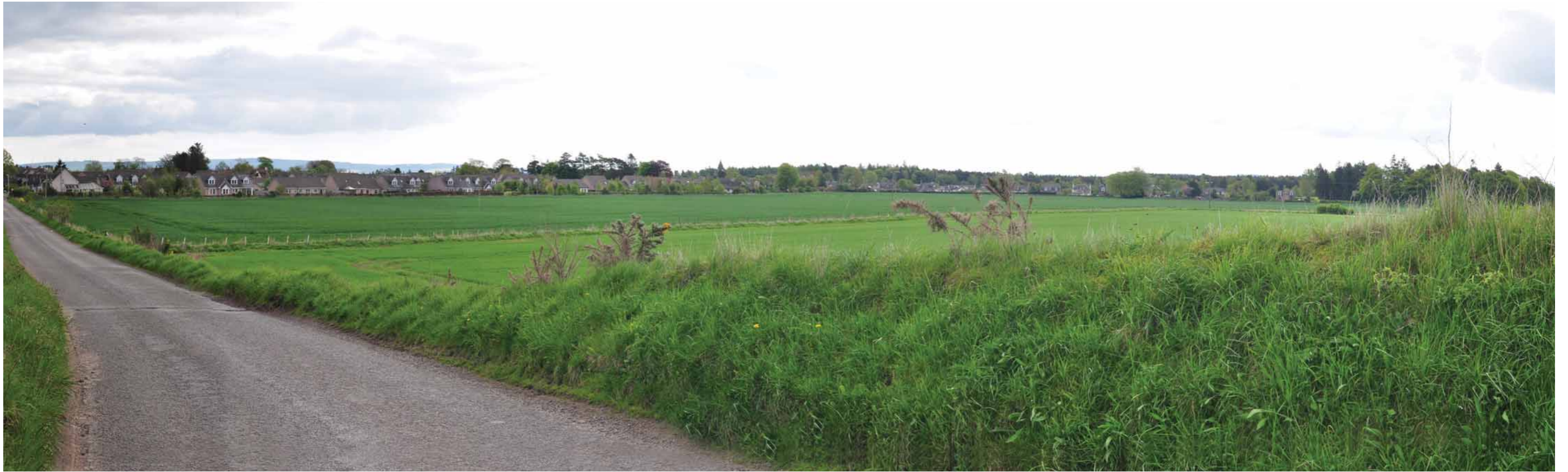
10.3 Approach from West via C34 (Lethnot Road) ( click here to return to text )