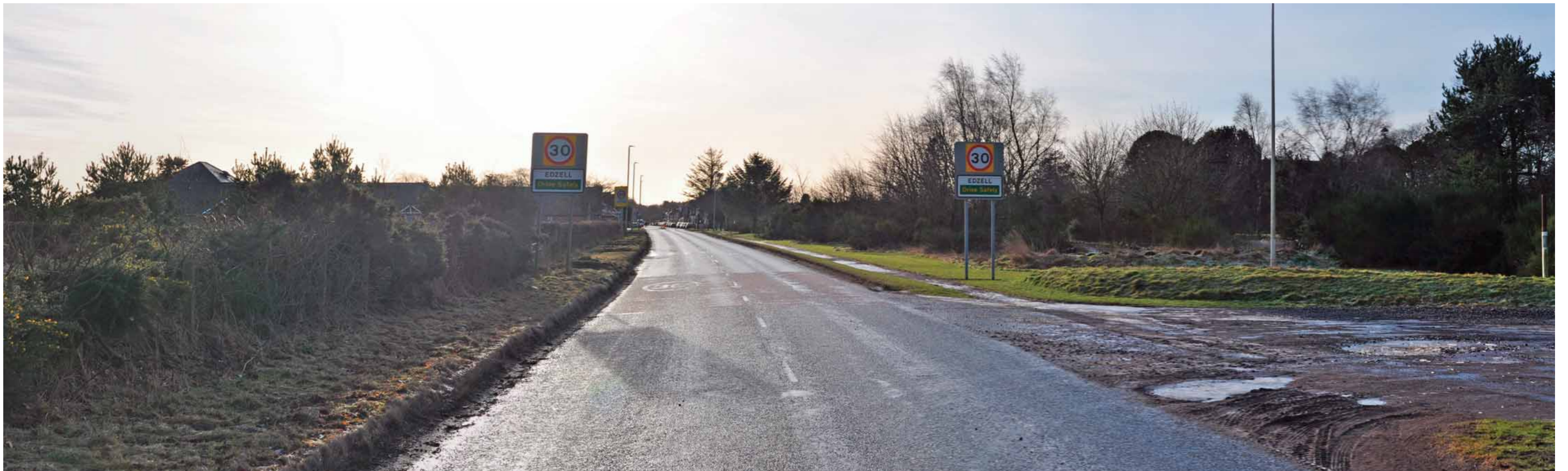
10.4 Approach from North via 8966 (towards Fettercairn) ( click here to return to text )