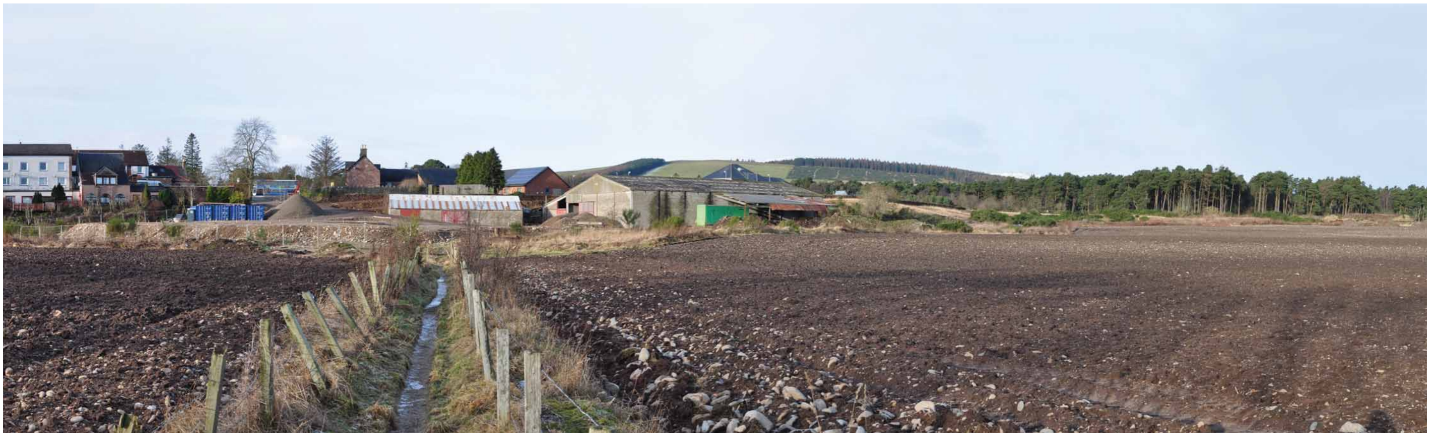
10.6 North-East of Edzell from Core Path 011 ( click here to return to text )