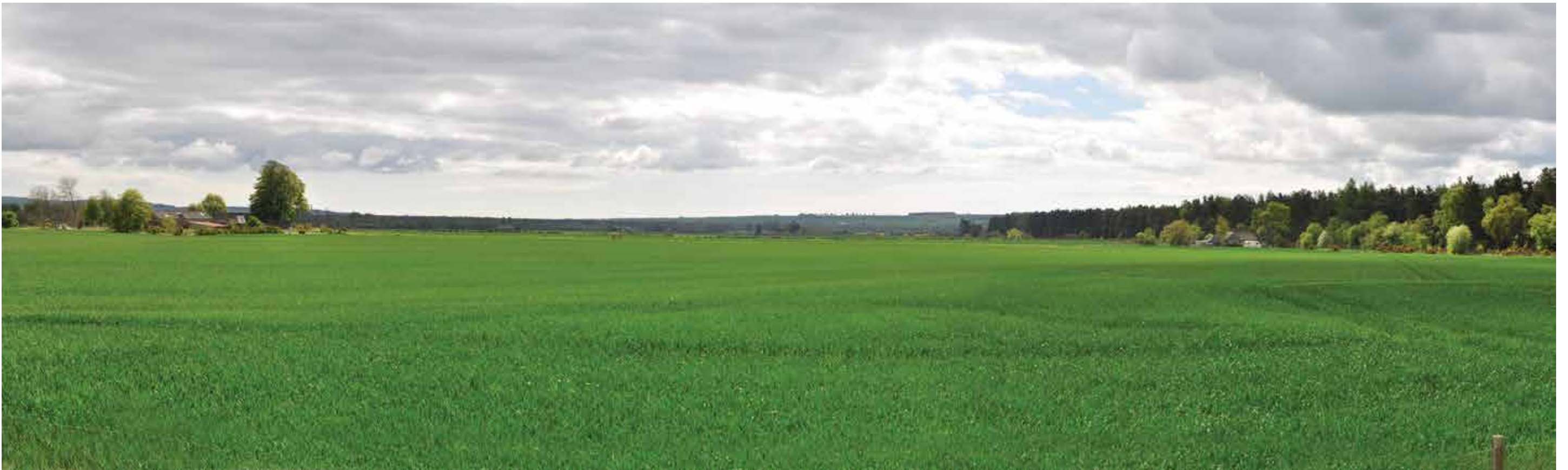
10.8 East of Edzell from Durie Place