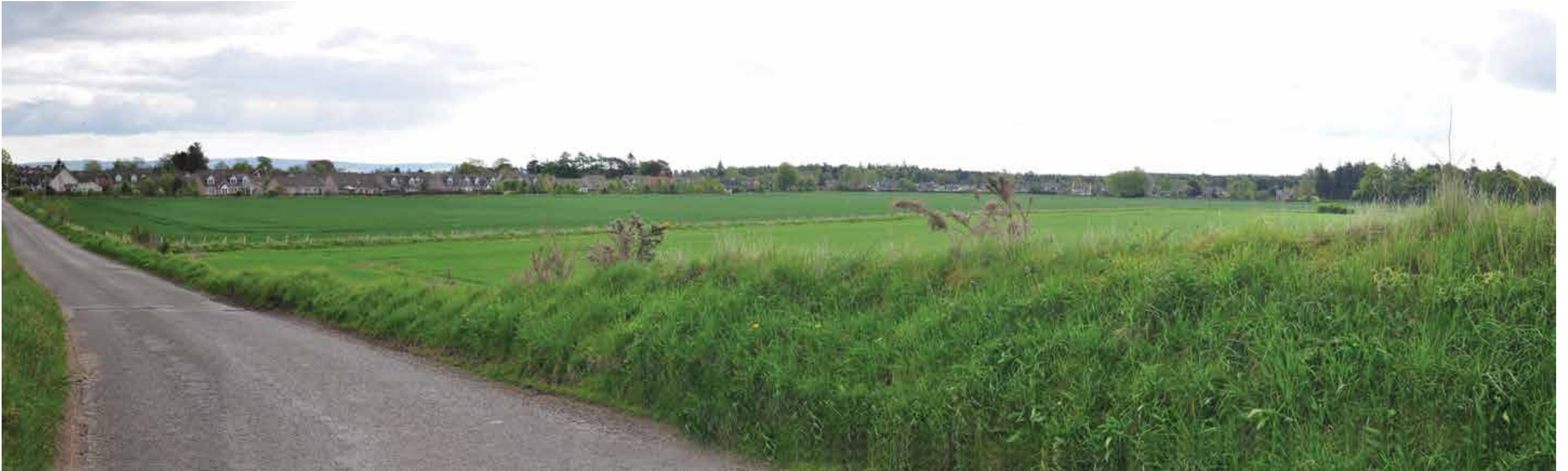
10.3 Approach from West via C34 (Lethnot Road)