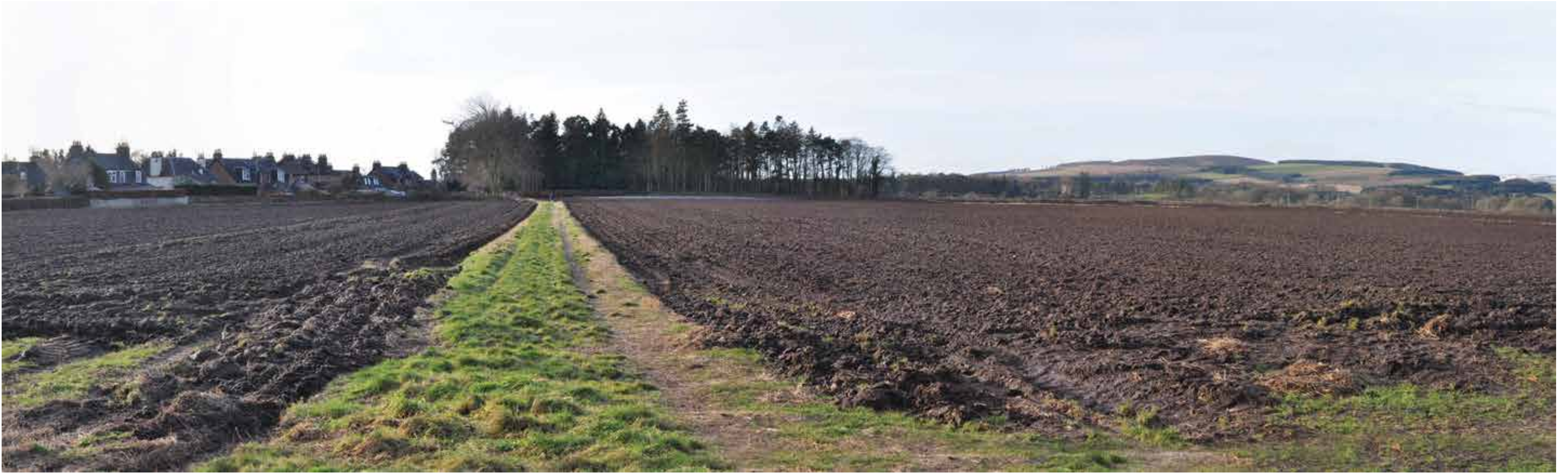
10.5 West of Edzell from Core Path 014