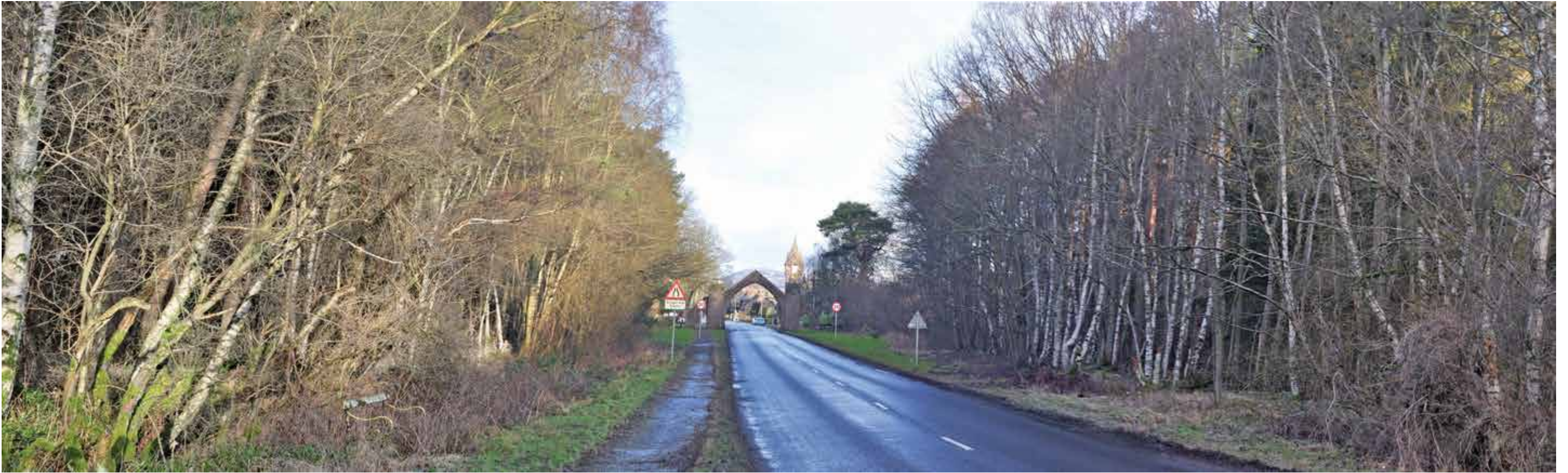
10.1 Approach from South via B966 (towards Brechin)