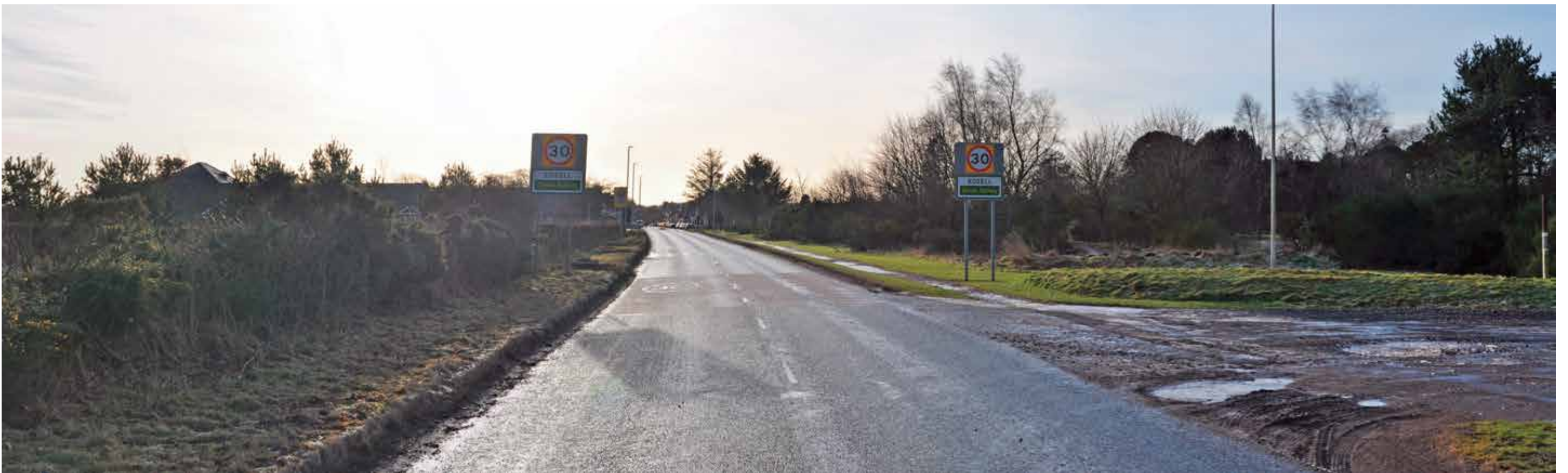
10.4 Approach from North via 8966 (towards Fettercairn)