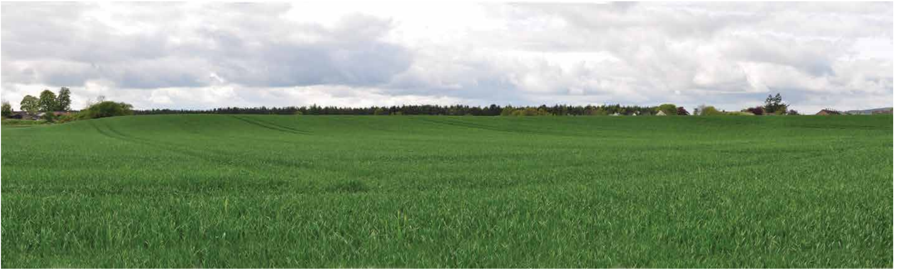
10.7 Kame Terrace Escarpment from Edzell Sewage Works