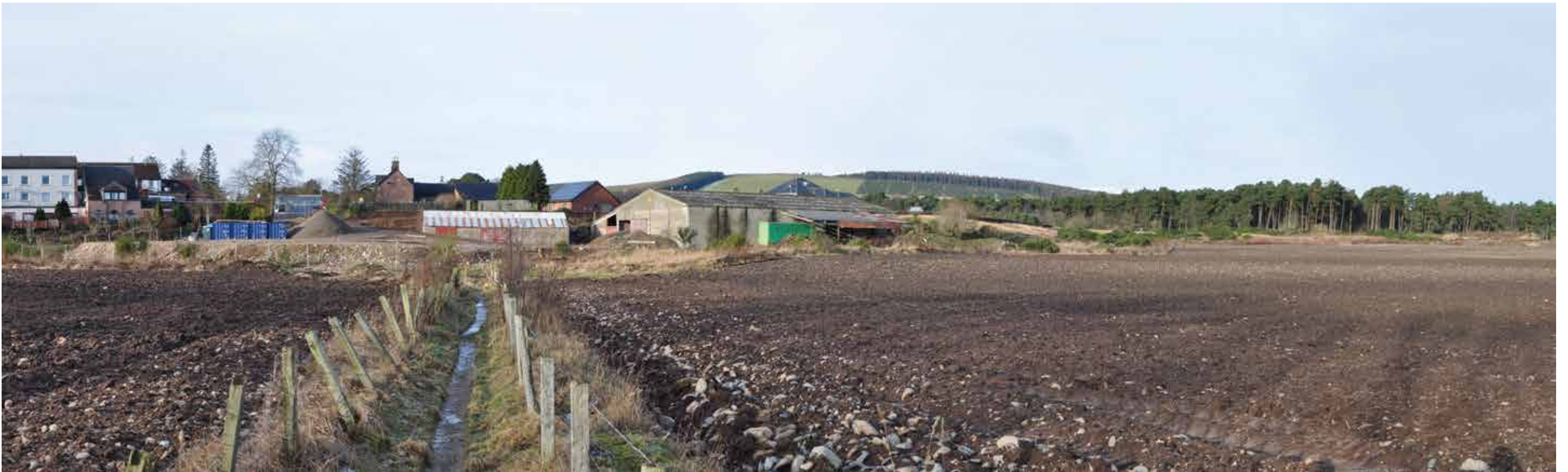
10.6 North-East of Edzell from Core Path 011