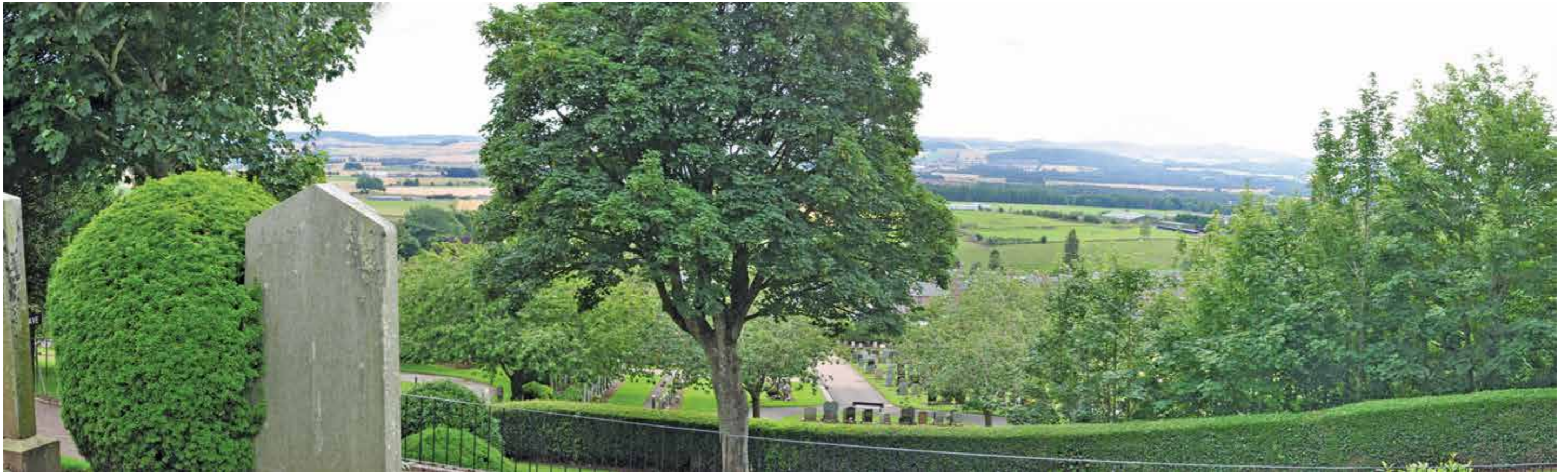
7.7 View from JM Barrie's Grave ( click here to return to text )