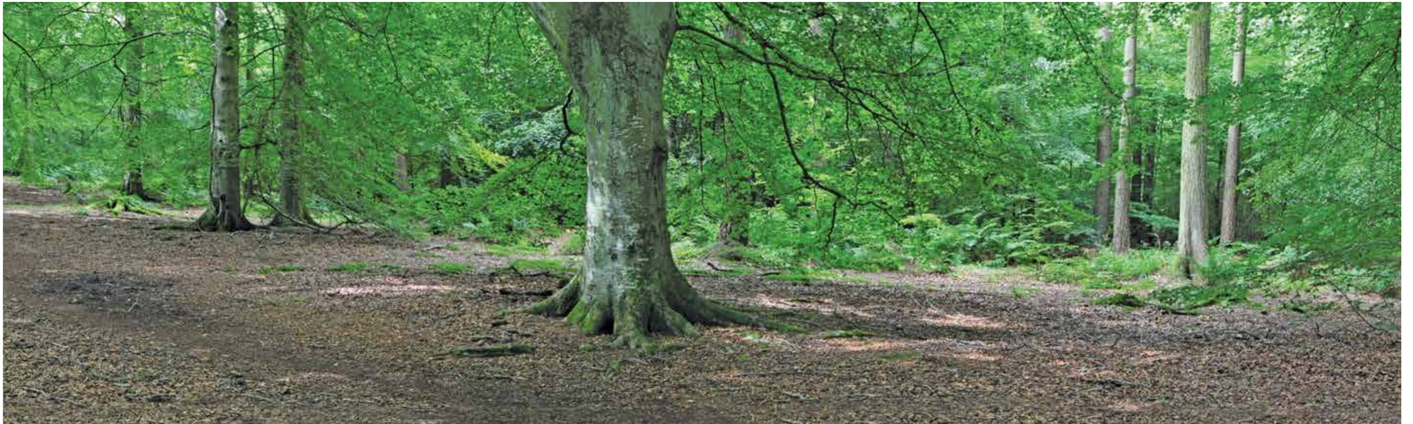
7.2 Caddam Wood ( click here to return to text )