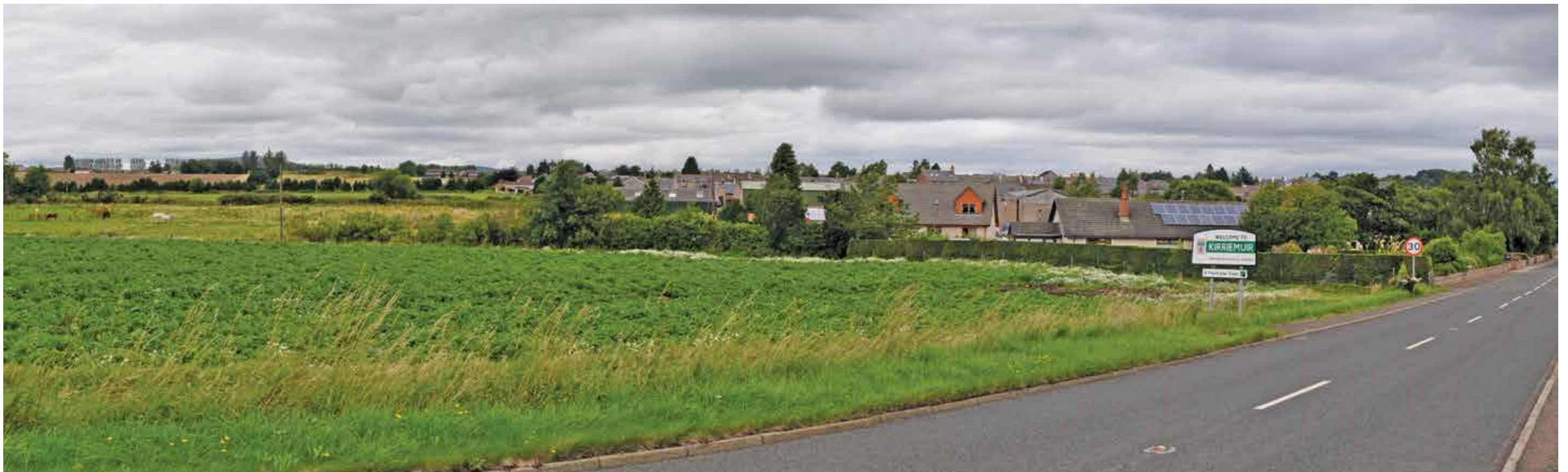
7.18a Approach from South via A920 (Glamis Road) ( click here to return to text )