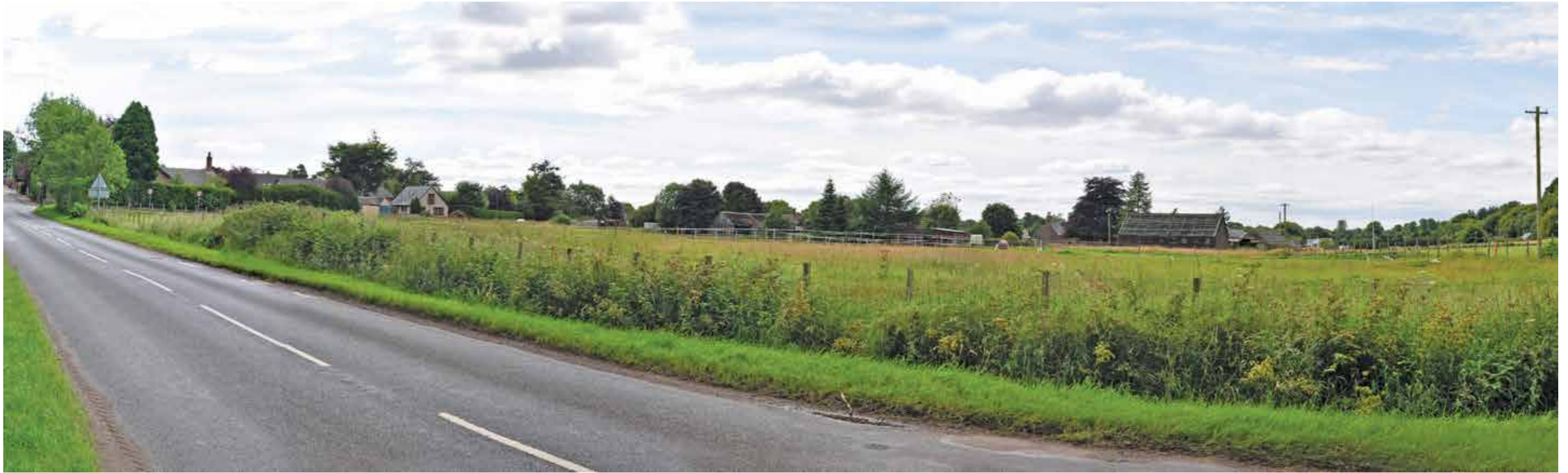
7.11 Approach from North via B955 (Golf Road) ( click here to return to text )