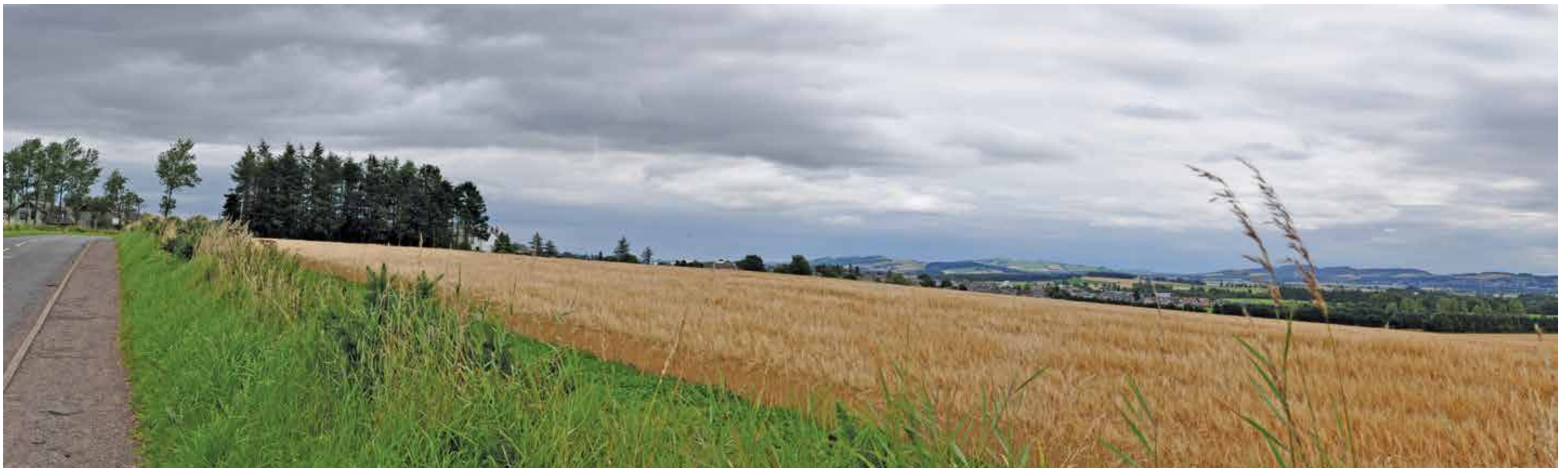
7.19 Approach from South-West via A926 (towards Westmuir) ( click here to return to text )