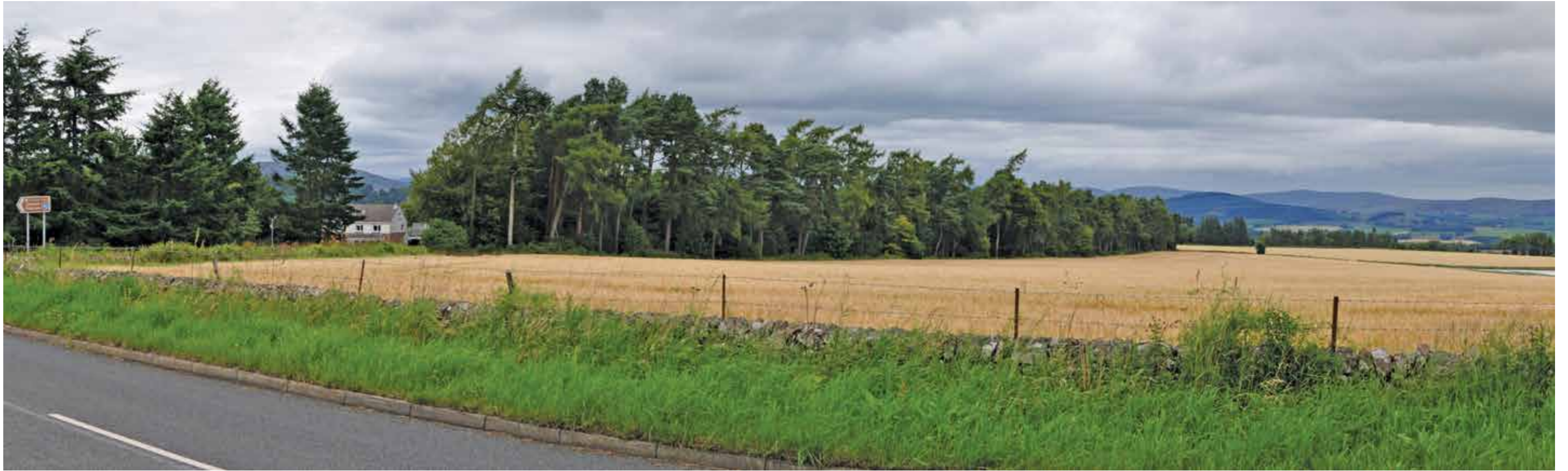
7.13 Approach from East via U376 (East Hill Road) ( click here to return to text )