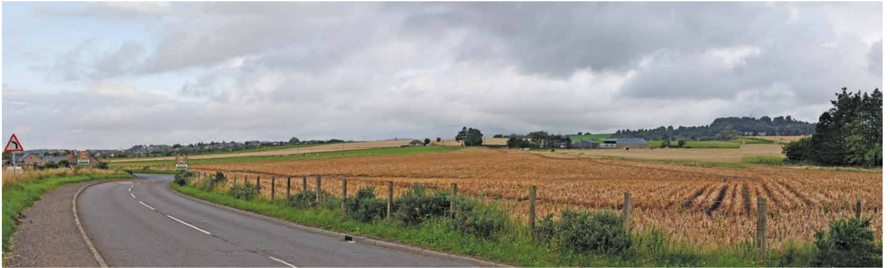
7.9 Kirriemuir from Core Path 253 ( click here to return to text )