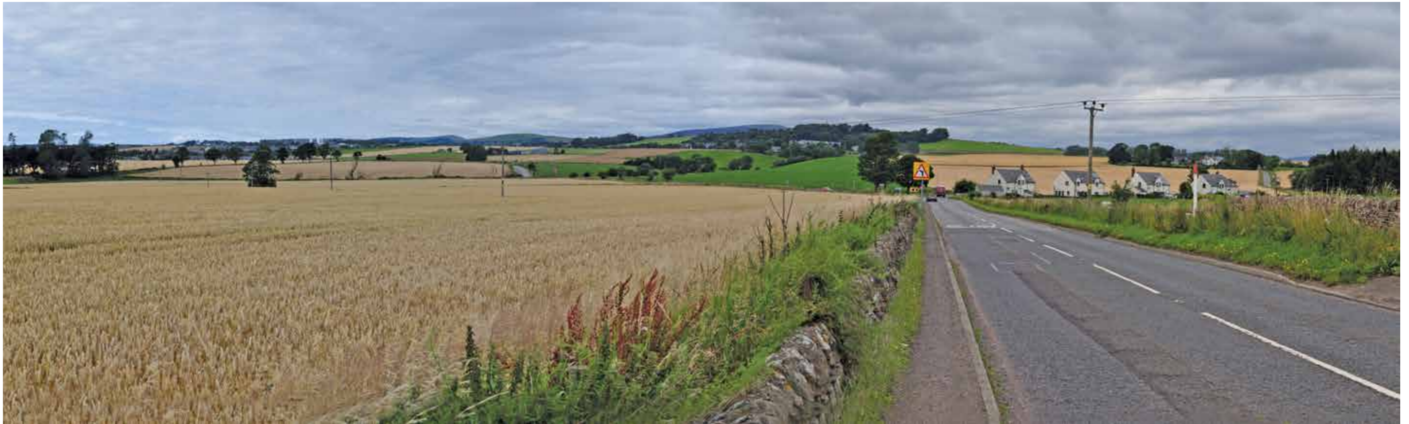
7.15 Approach from South-East via A926 (at Checkiefield) ( click here to return to text )