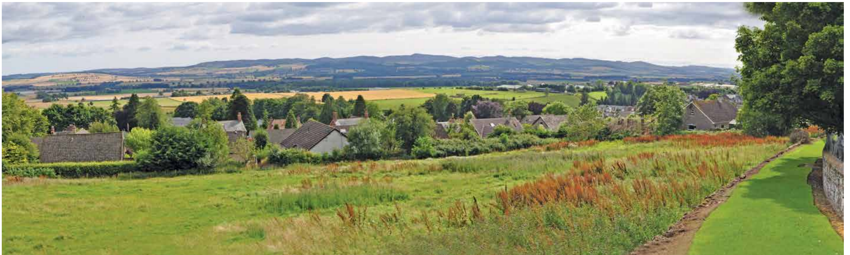
7.6 Kirriemuir from Cemetery ( click here to return to text )