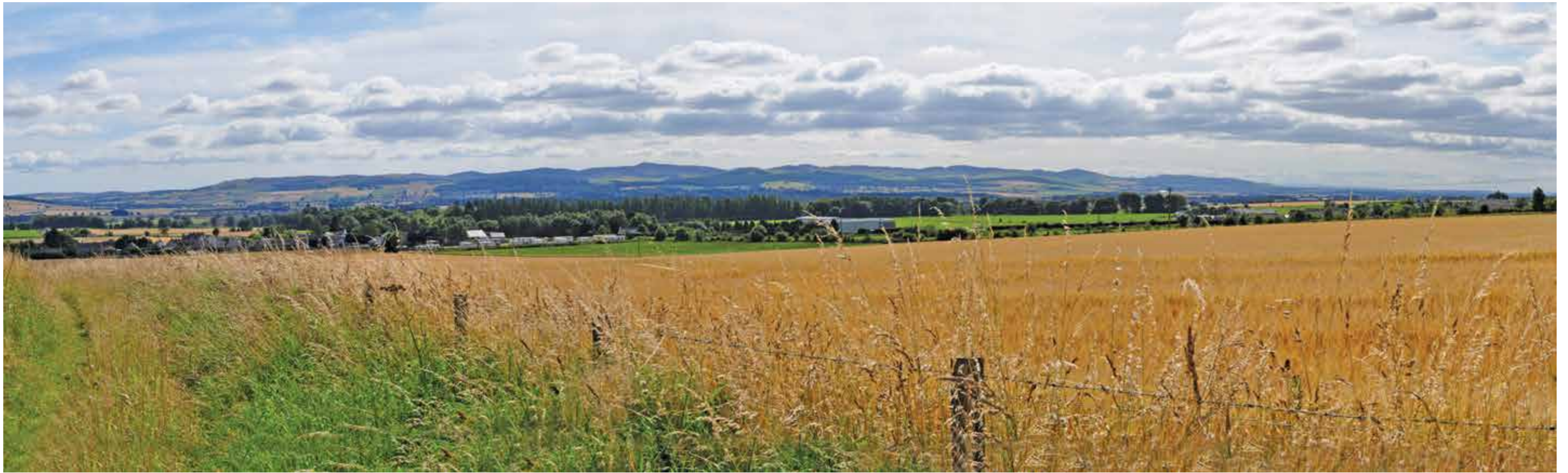
7.5 Maryton & Southmuir from Core Path 270 ( click here to return to text )