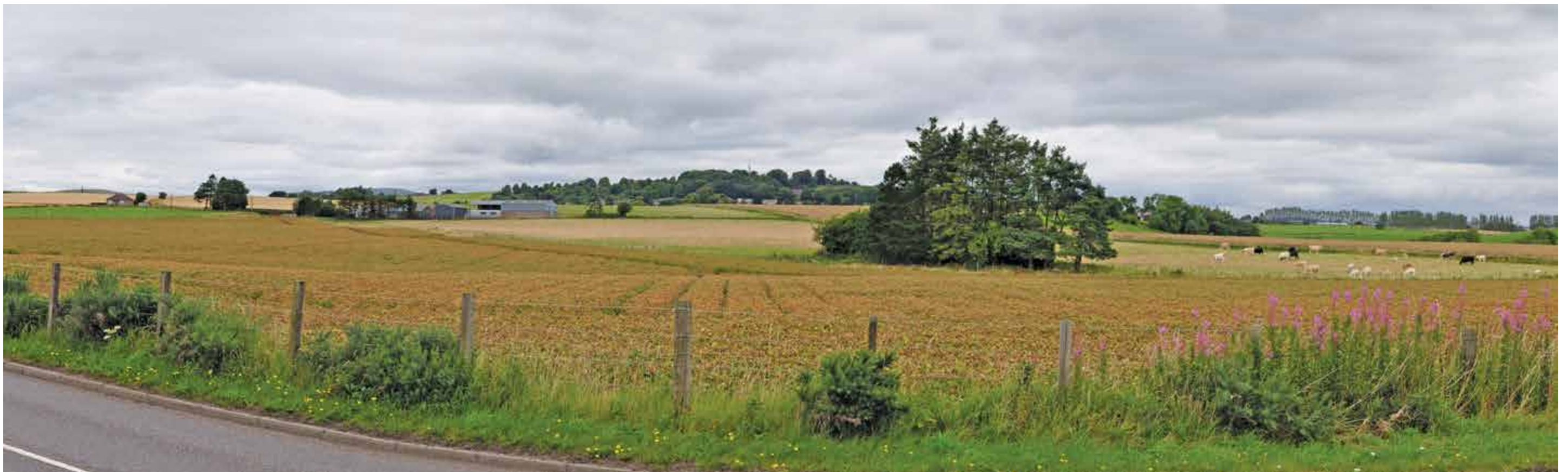
7.16 Approach from South-East via A926 (at Maryton) ( click here to return to text )