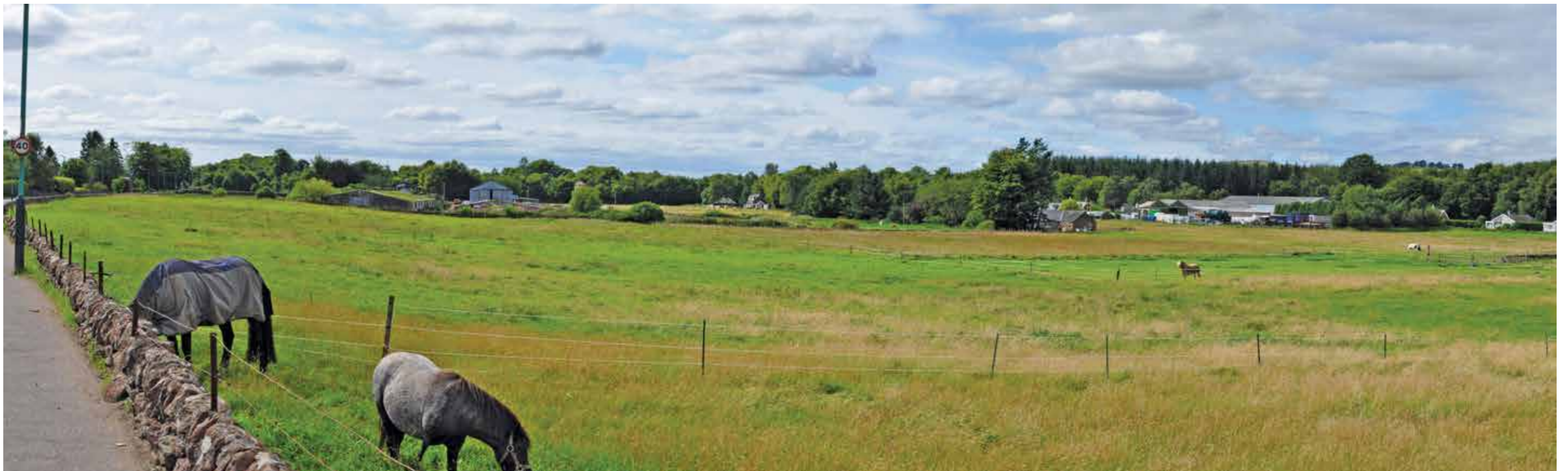
7.8 Woodside from B955 (Cortachy Road) ( click here to return to text )