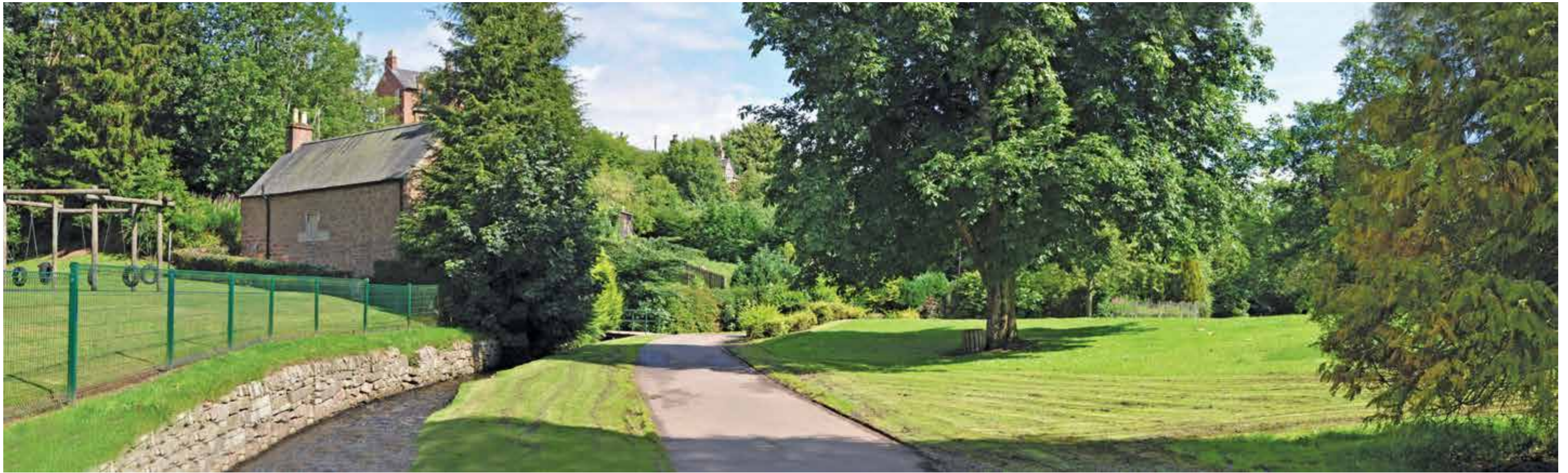
7.3 Kirriemuir Den ( click here to return to text )