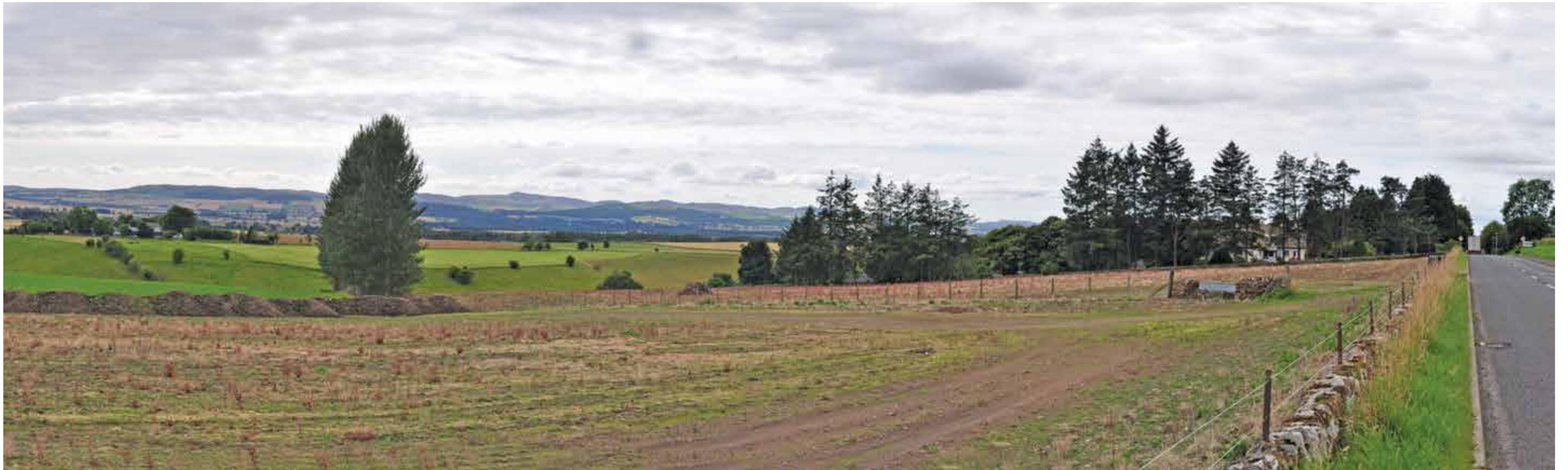
7.14 Approach from East via B957 (Brechin Road) ( click here to return to text )