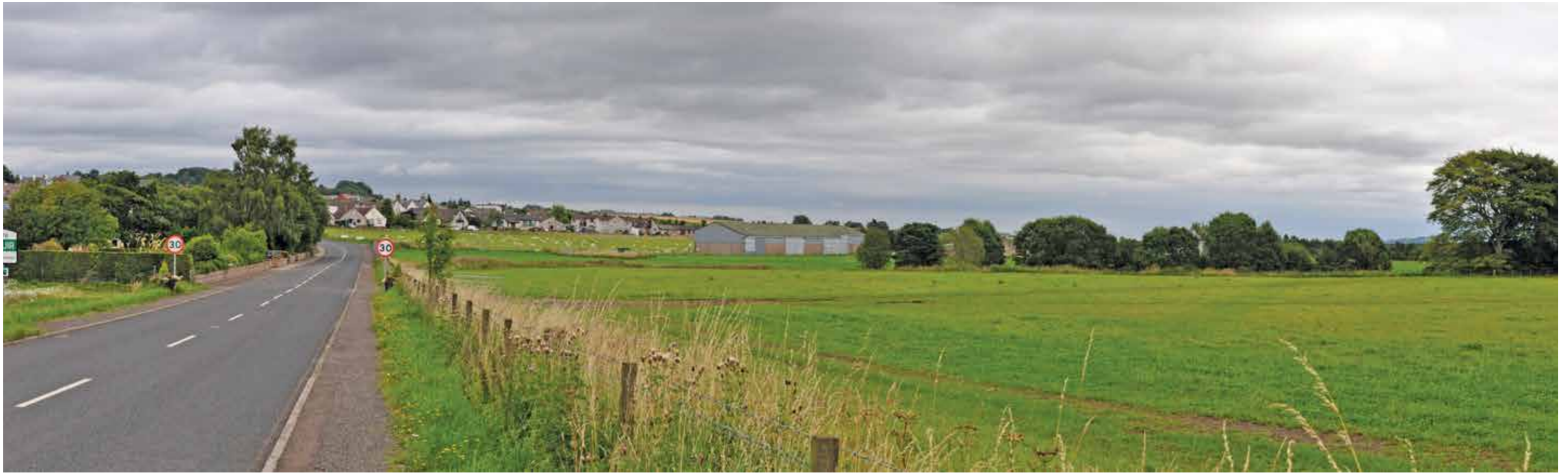
7.18b Approach from South via A920 (Glamis Road) ( click here to return to text )