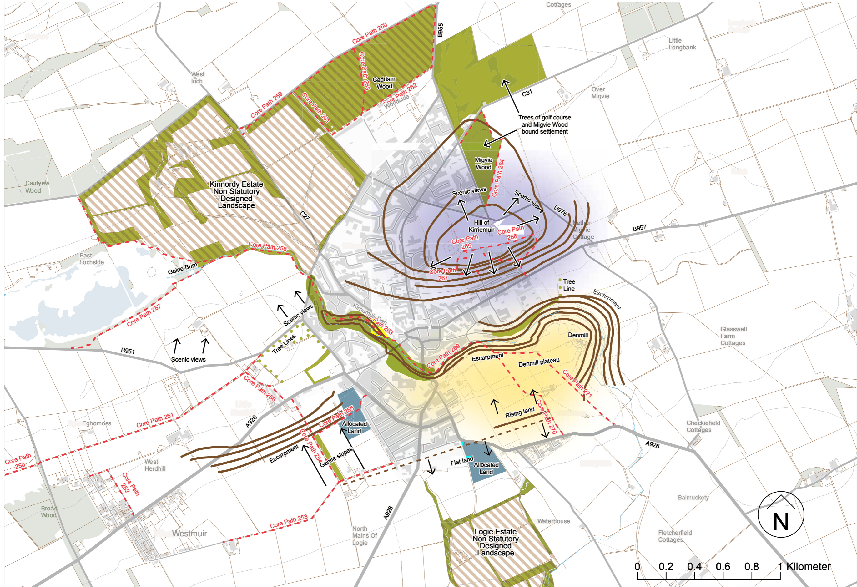
Figure 7.1 Kirriemuir Landscape and Visual Analysis (click here to return to text)