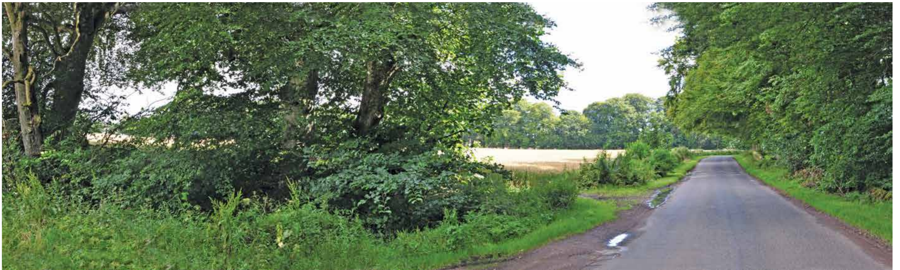
7.10 Approach from North West via C27 (towards Pearsie) ( click here to return to text )