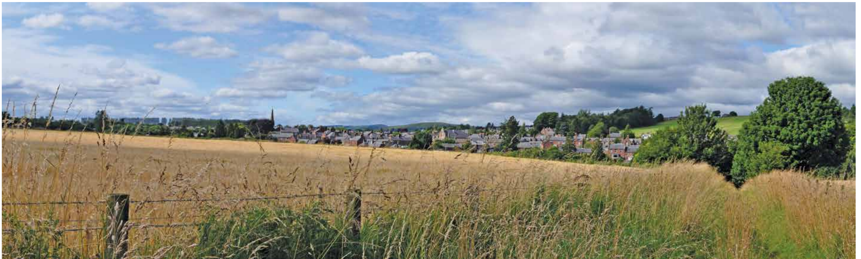
7.4 Kirriemuir from Core Path 270 ( click here to return to text )