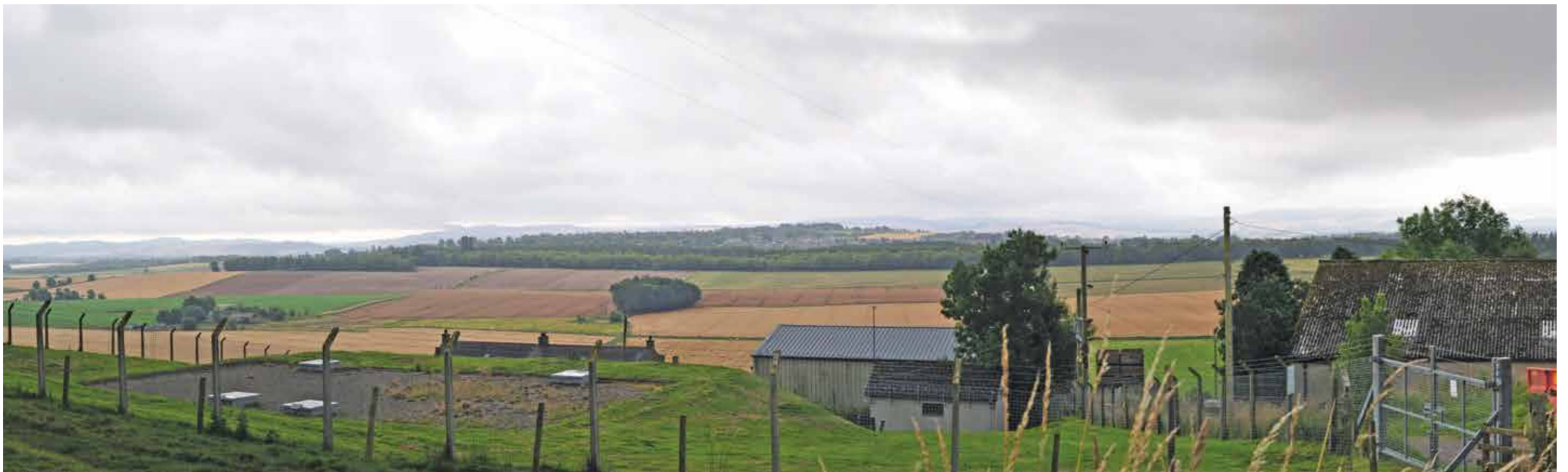
7.21 Kirriemuir from North at Meams ( click here to return to text )