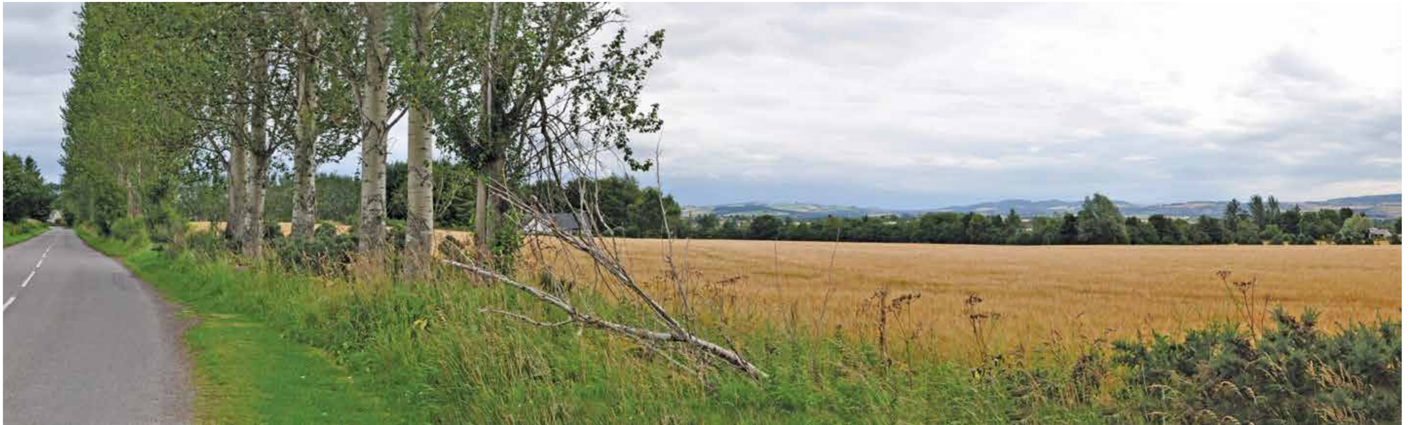
7.20 Approach from West via B951 (towards Glen Isla) ( click here to return to text )