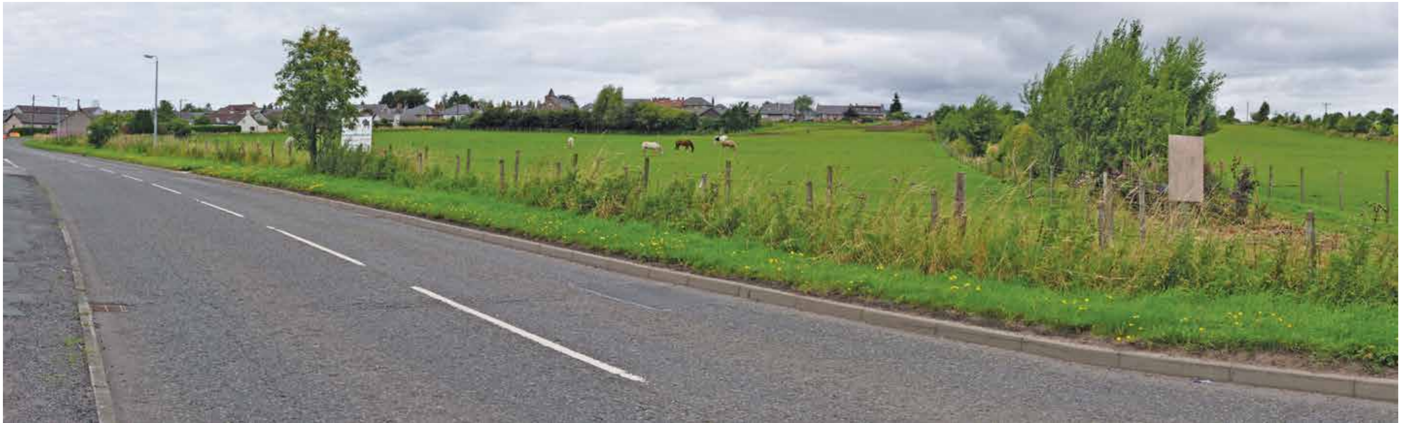
7.17 Approach from South-East via A926 (Forfar Road) ( click here to return to text )