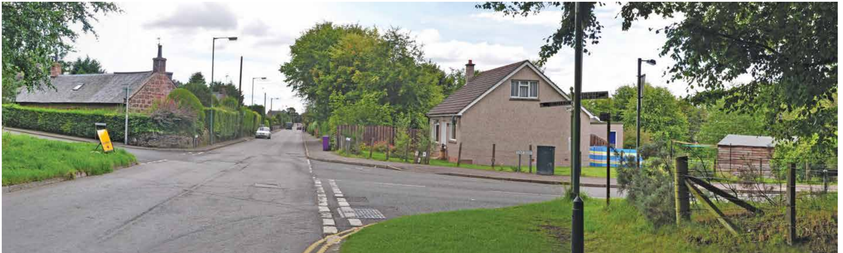
7.12 Approach from East via C31 (Shielhill Road) ( click here to return to text )