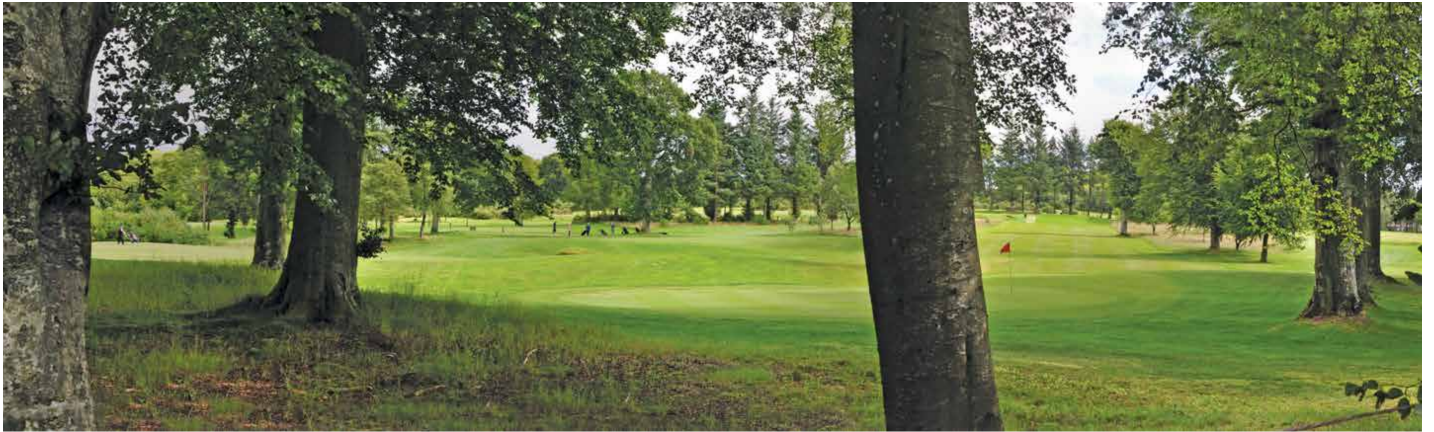
7.1 Kirriemuir Golf Course ( click here to return to text )